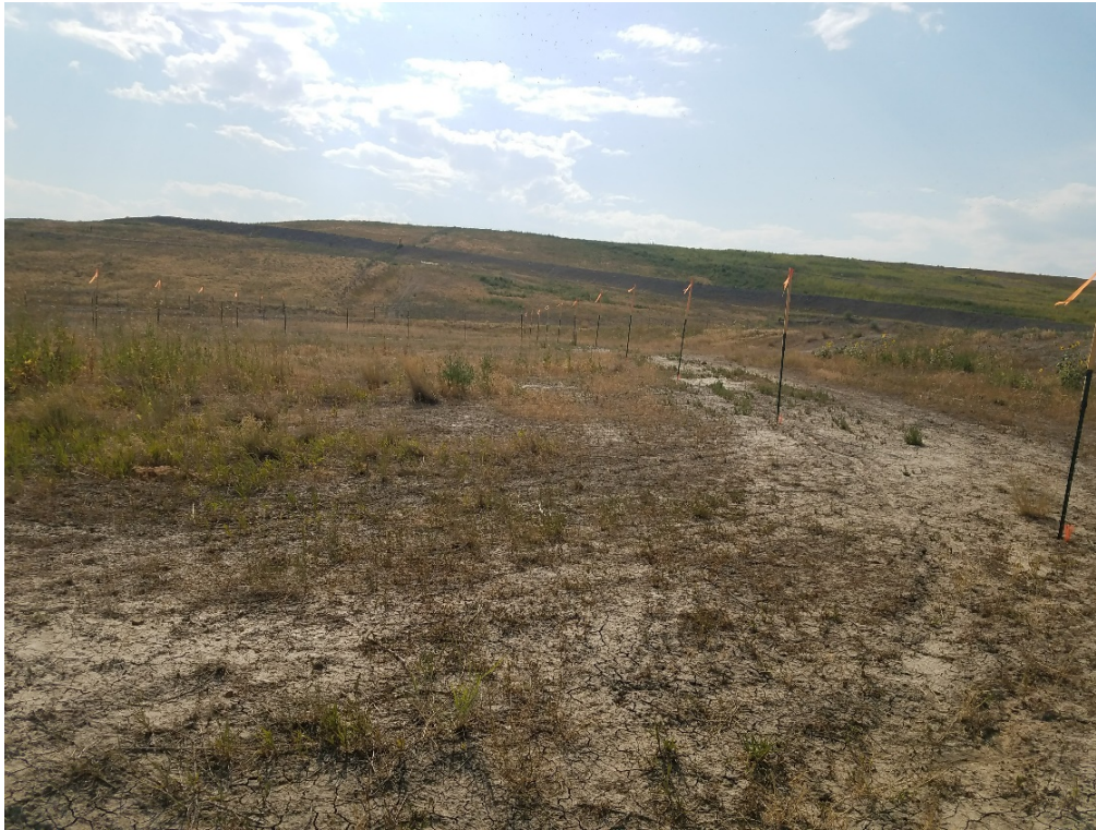
Photo 1. Center of pad, looking east.