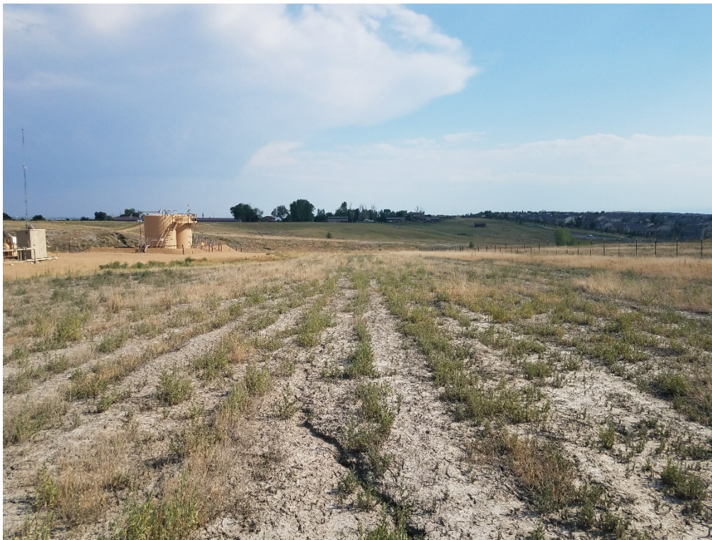
Photo 2. Center of pad, looking south.