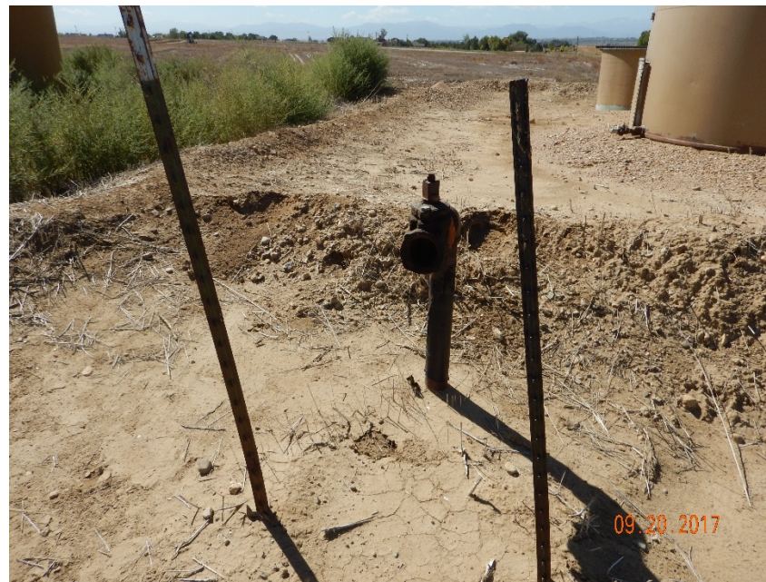
Photo #8 – Truck loadout at SE corner of tank battery lacks secondary containment device. Note eroded earthen berm in background.