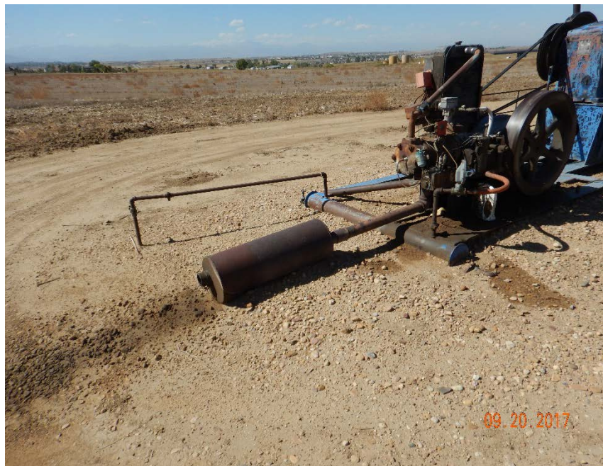
Photo #3 – Localized, oil-stained soil beneath prime mover and pump jack exhaust.