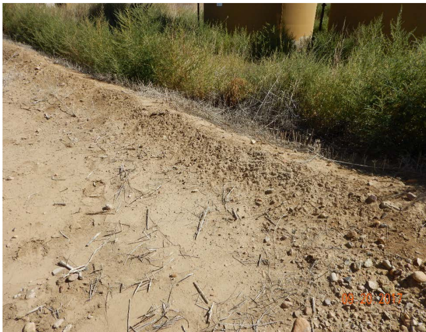
Photo #9 – South berm (shared with Energy Search battery) is shallow.