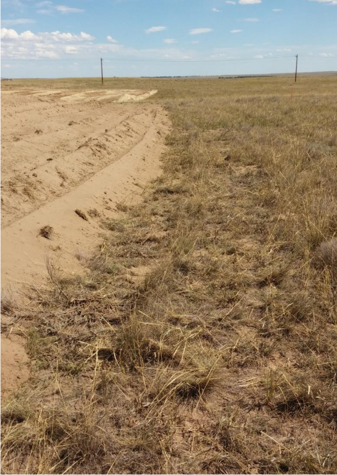
Photo 3. Photo taken from the southern location, facing East. Did not observe any stormwater or erosion control BMPs during construction operations.