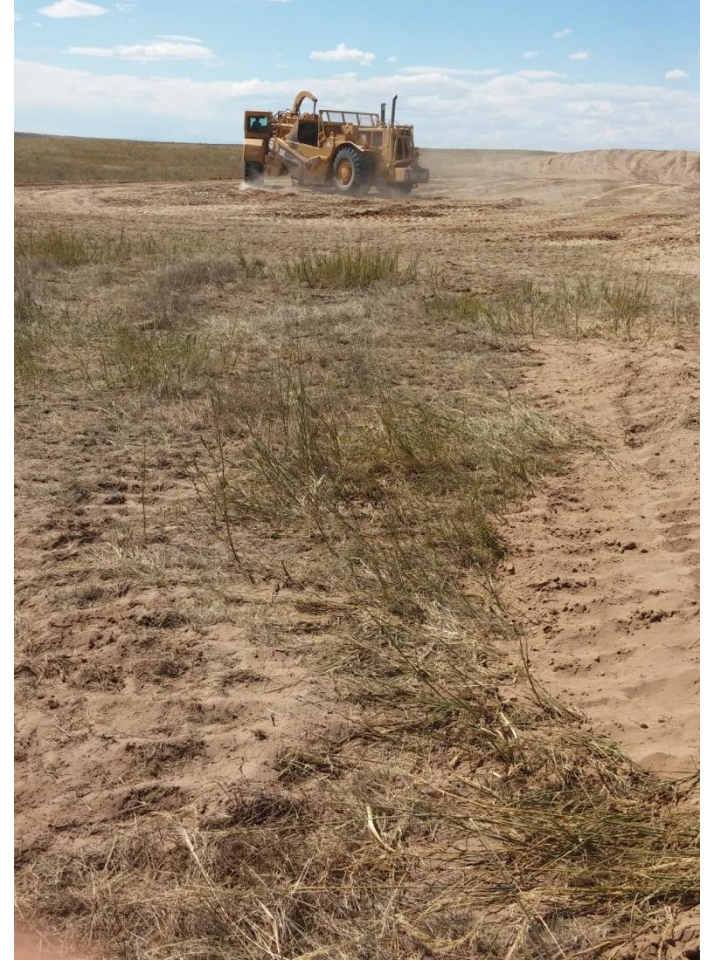
Photo 4. Photo taken from the southeastern location, facing West. Did not observe any stormwater or erosion control BMPs during construction operations.