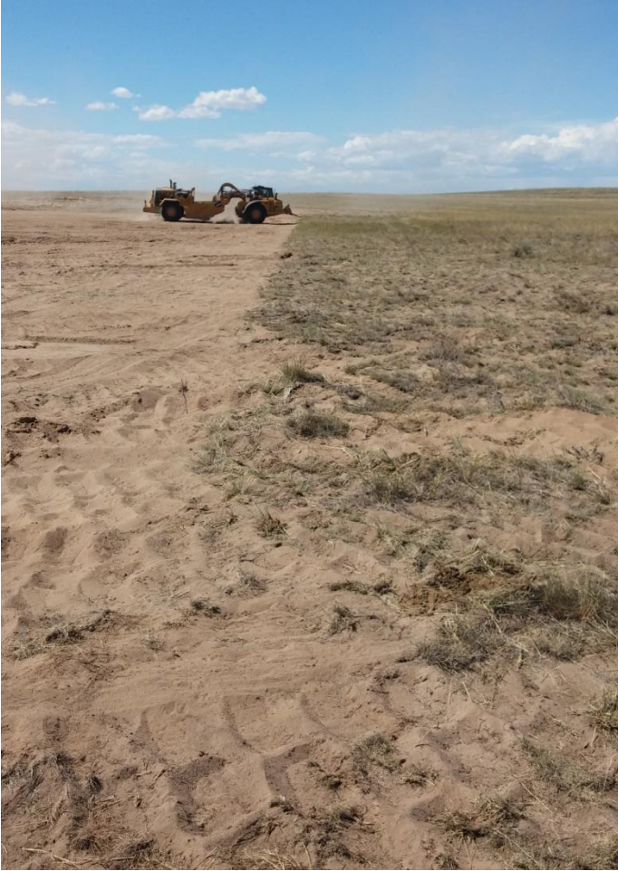
Photo 1. Photo taken from the northern location, facing West. Did not observe any stormwater or erosion control BMPs during construction operations.