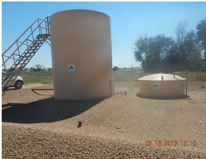
Photo 4: Unused riser in battery. Berm is not properly engineered in floodplain. Tanks are not properly anchored in floodplain.