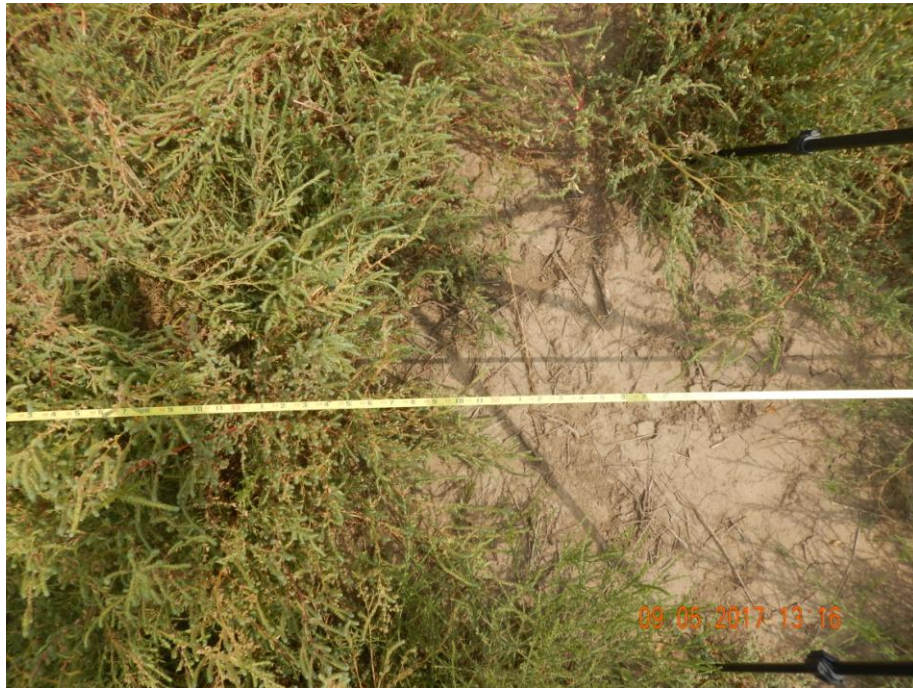
Photo 13: Photo shows vegetation at the 50th point of the disturbance area transect.