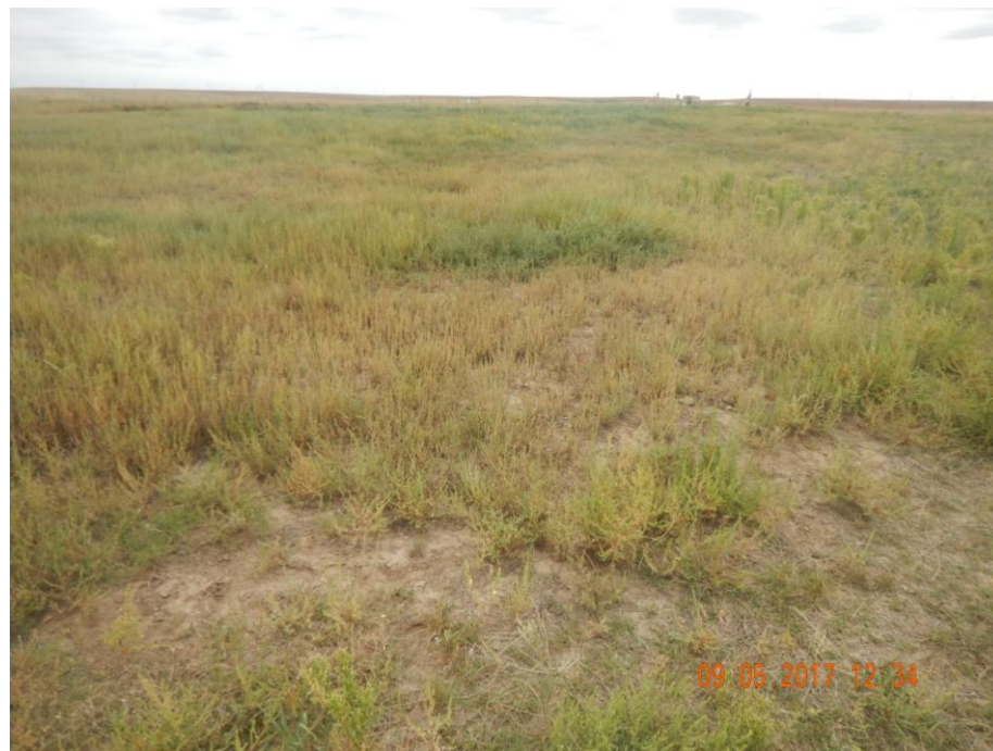
Photo 2: Photo taken from the northwest corner of the location, facing southeast. Photo shows vegetation over the reclamation area is predominantly undesirable weedy plant species and not reflective of the adjacent reference area. Well was PA'd 2014, at least three growing seasons have passed