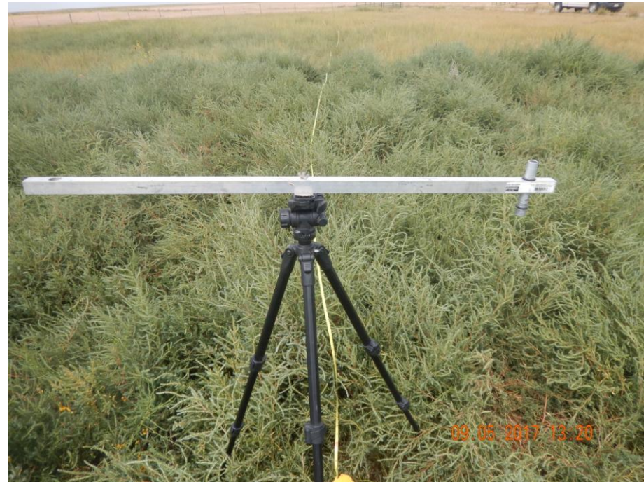
Photo 14: Photo taken from the disturbance area, facing north. Photo shows the end point for the disturbance area transect.