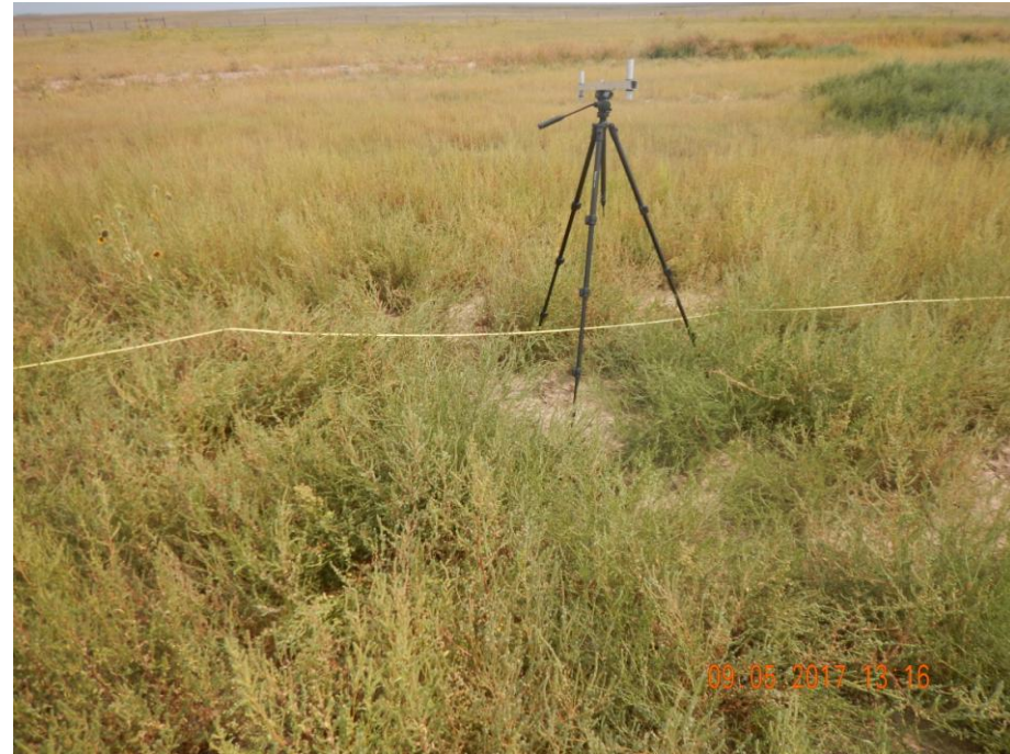
Photo 12: Photo shows vegetation at the 50th point of the disturbance area transect, facing east.