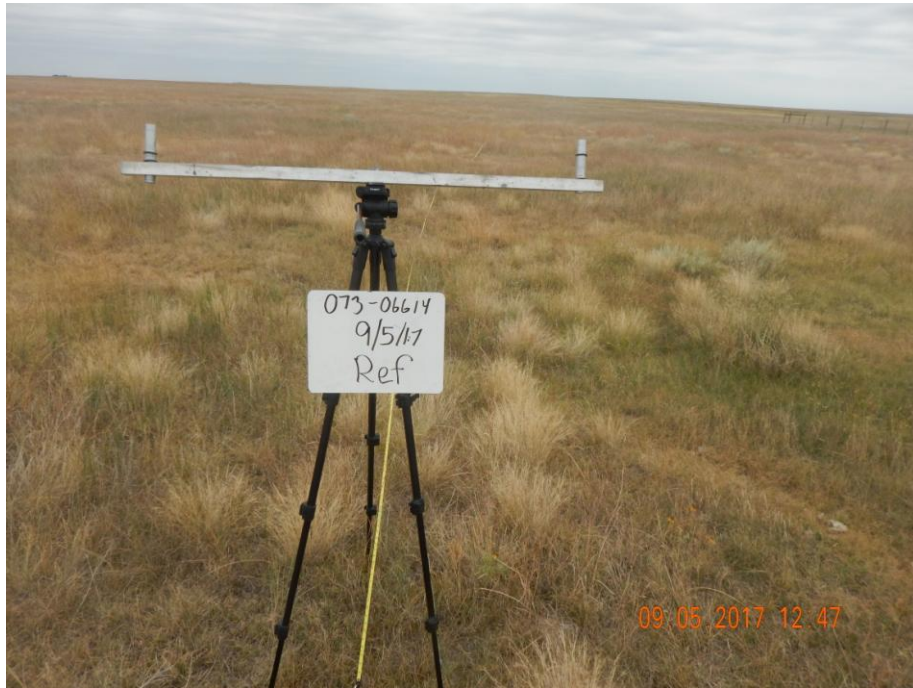
Photo 5: Photo taken from the adjacent reference area, facing east. Photo shows the start point for the reference area transect.