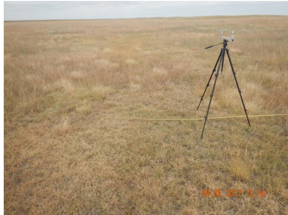
Photo 6: Photo shows vegetation at the 50th point of the reference area transect, facing north.