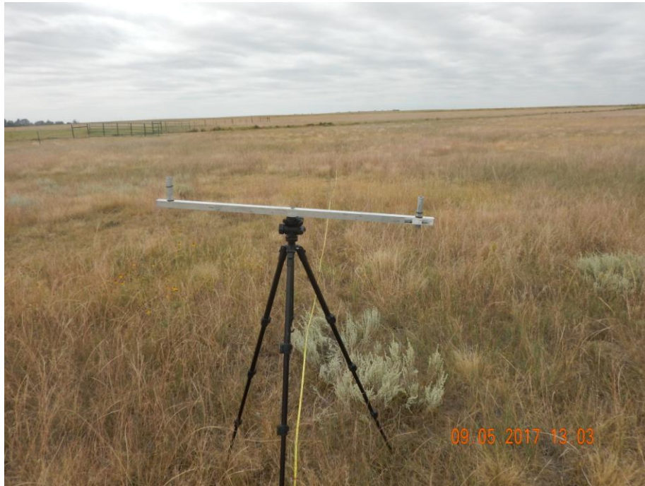
Photo 9: Photo taken from the adjacent reference area, facing west. Photo shows the end point for the reference area transect.