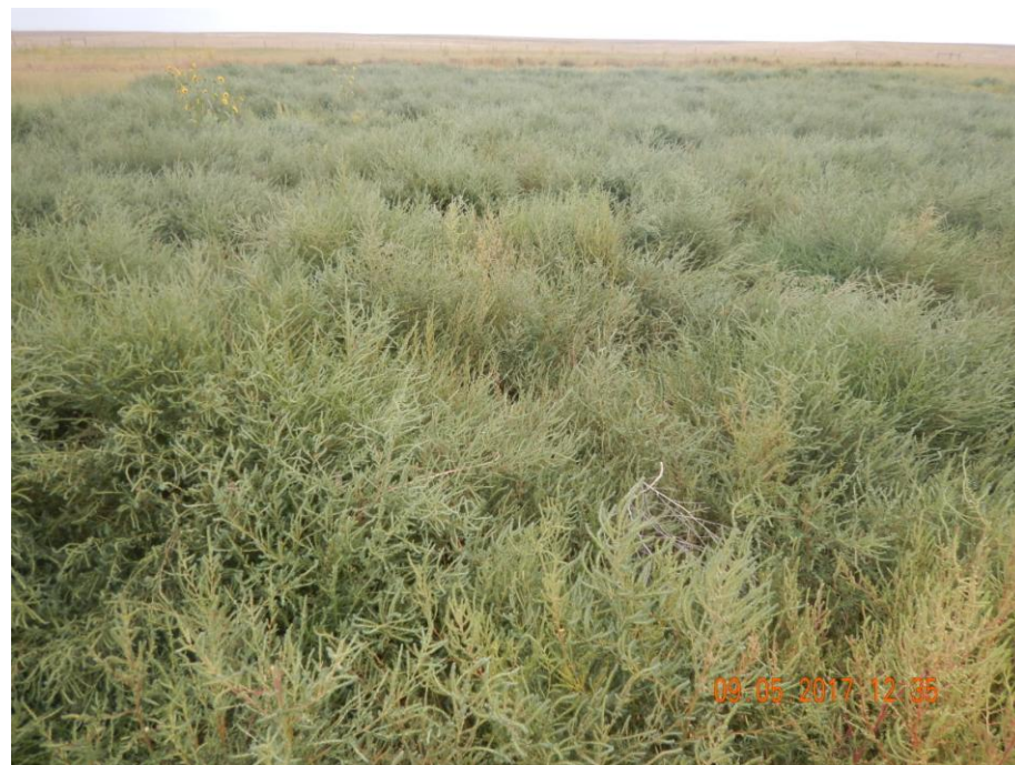
Photo 4: Photo taken from the central portion of the location, facing south. Photo shows vegetation over the reclamation area is predominantly undesirable weedy plant species and not reflective of the adjacent reference area. Well was PA'd 2014, at least three growing seasons have passed