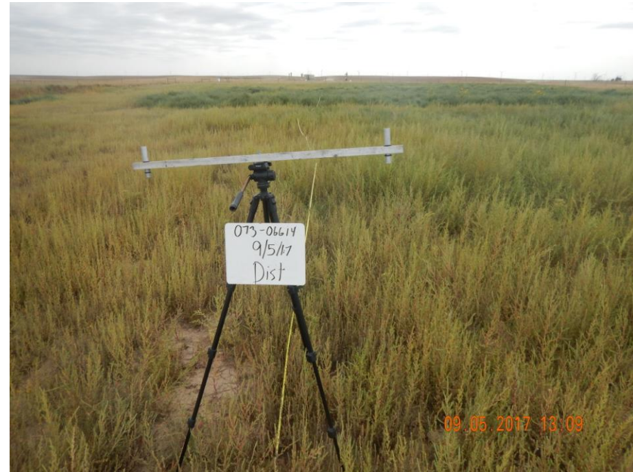
Photo 10: Photo taken from the location, facing south. Photo shows the start point for the disturbance area transect.