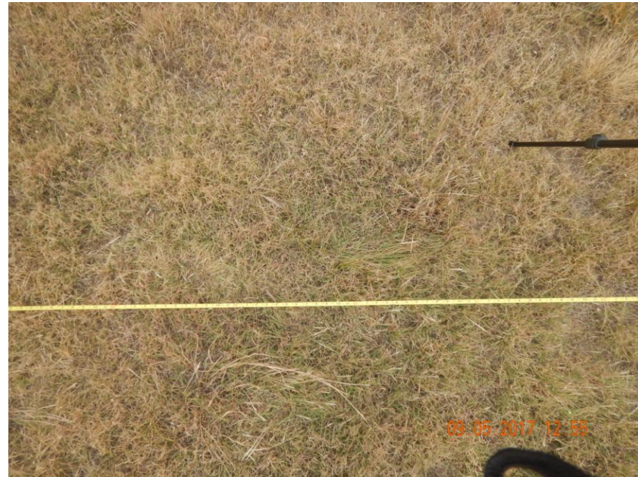
Photo 8: Photo shows vegetation at the 50th point of the reference area transect.