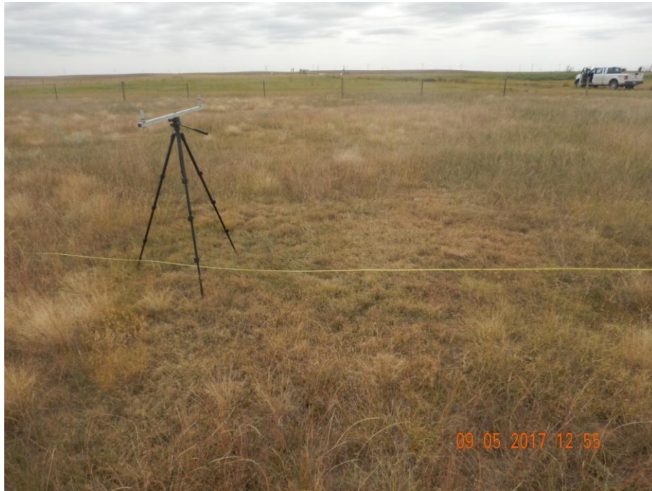
Photo 7: Photo shows vegetation at the 50th point of the reference area transect, facing south.