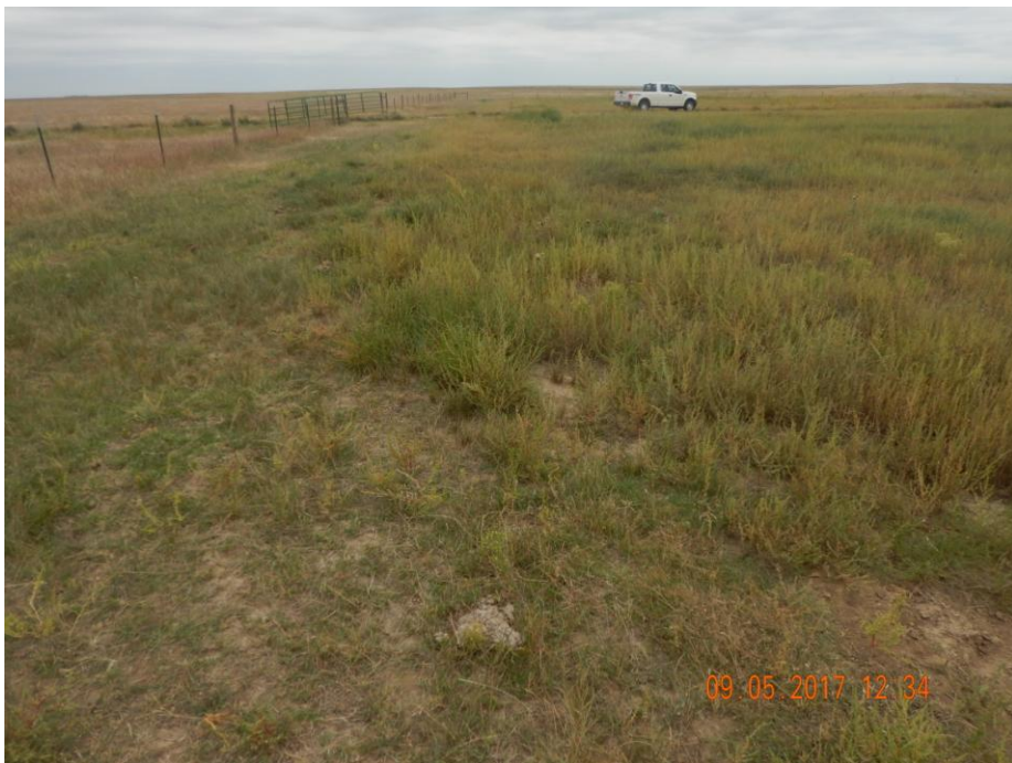
Photo 1: Photo taken from the northwest corner of the location, facing east. Photo shows vegetation over the reclamation area is predominantly undesirable weedy plant species and not reflective of the adjacent reference area. Well was PA'd 2014, at least three growing seasons have passed.