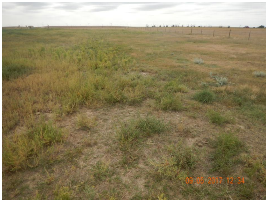
Photo 3: Photo taken from the northwest corner of the location, facing south. Photo shows vegetation over the reclamation area is predominantly undesirable weedy plant species and not reflective of the adjacent reference area. Well was PA'd 2014, at least three growing seasons have passed