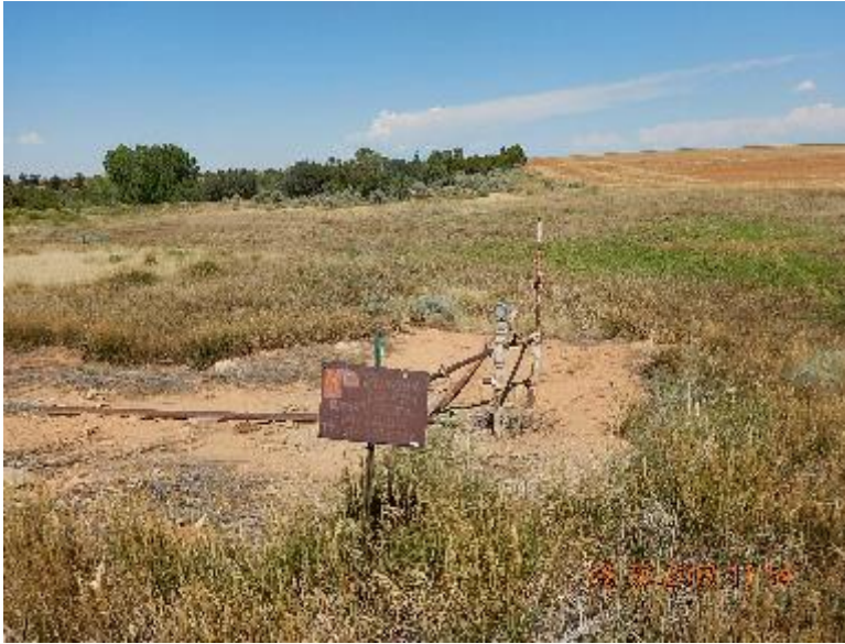
Photo 9: Above ground flowlines on NE side behind tanks along access road.