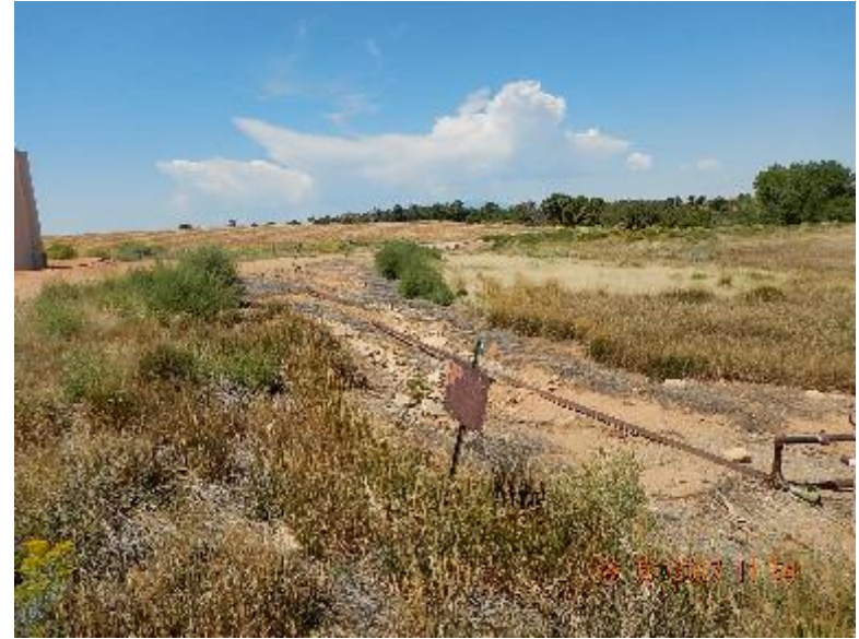
Photo 10: Closer view of above ground flowlines on NE side behind tanks along access road.