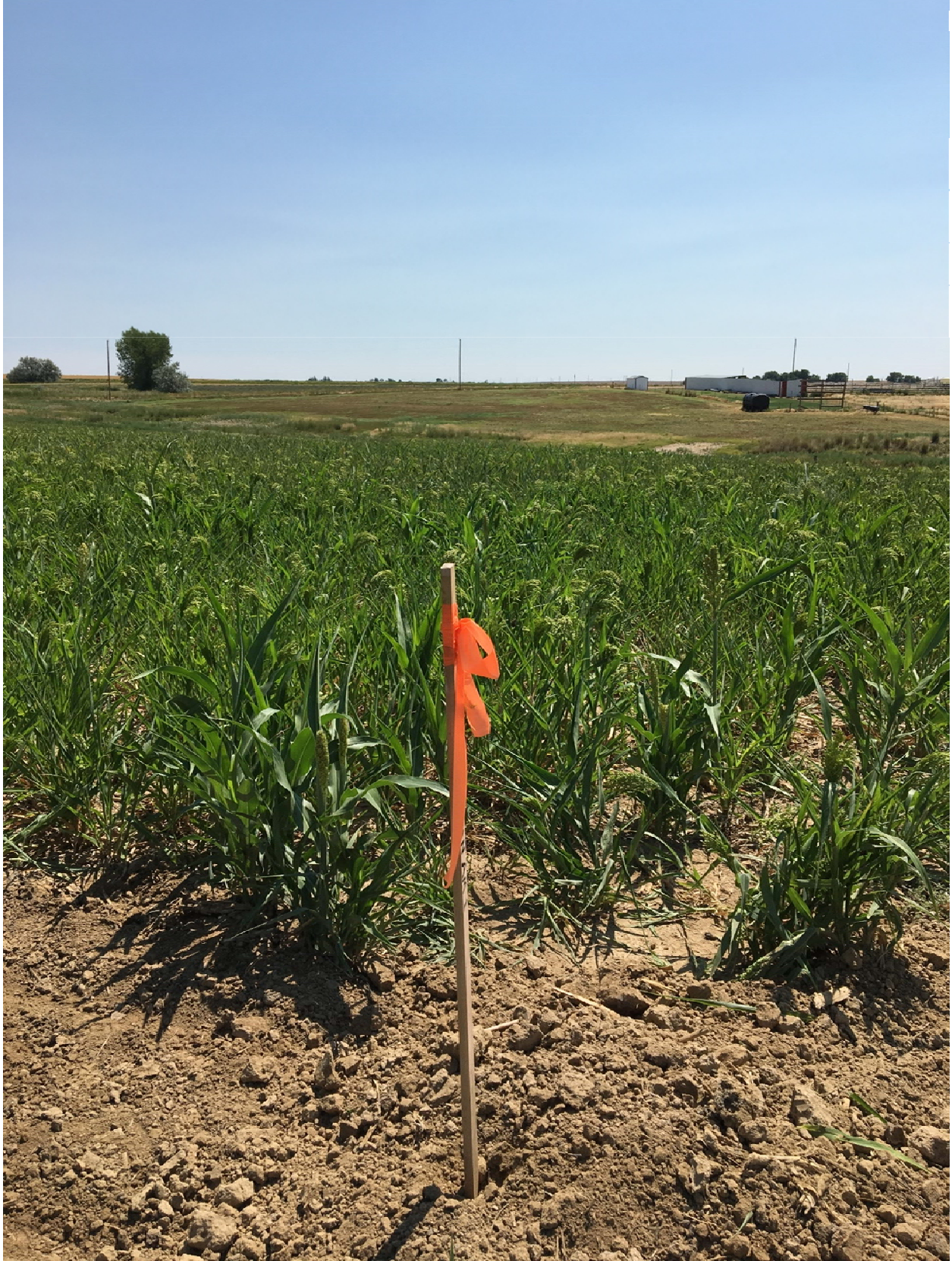
Photo: View of As-Drilled Location