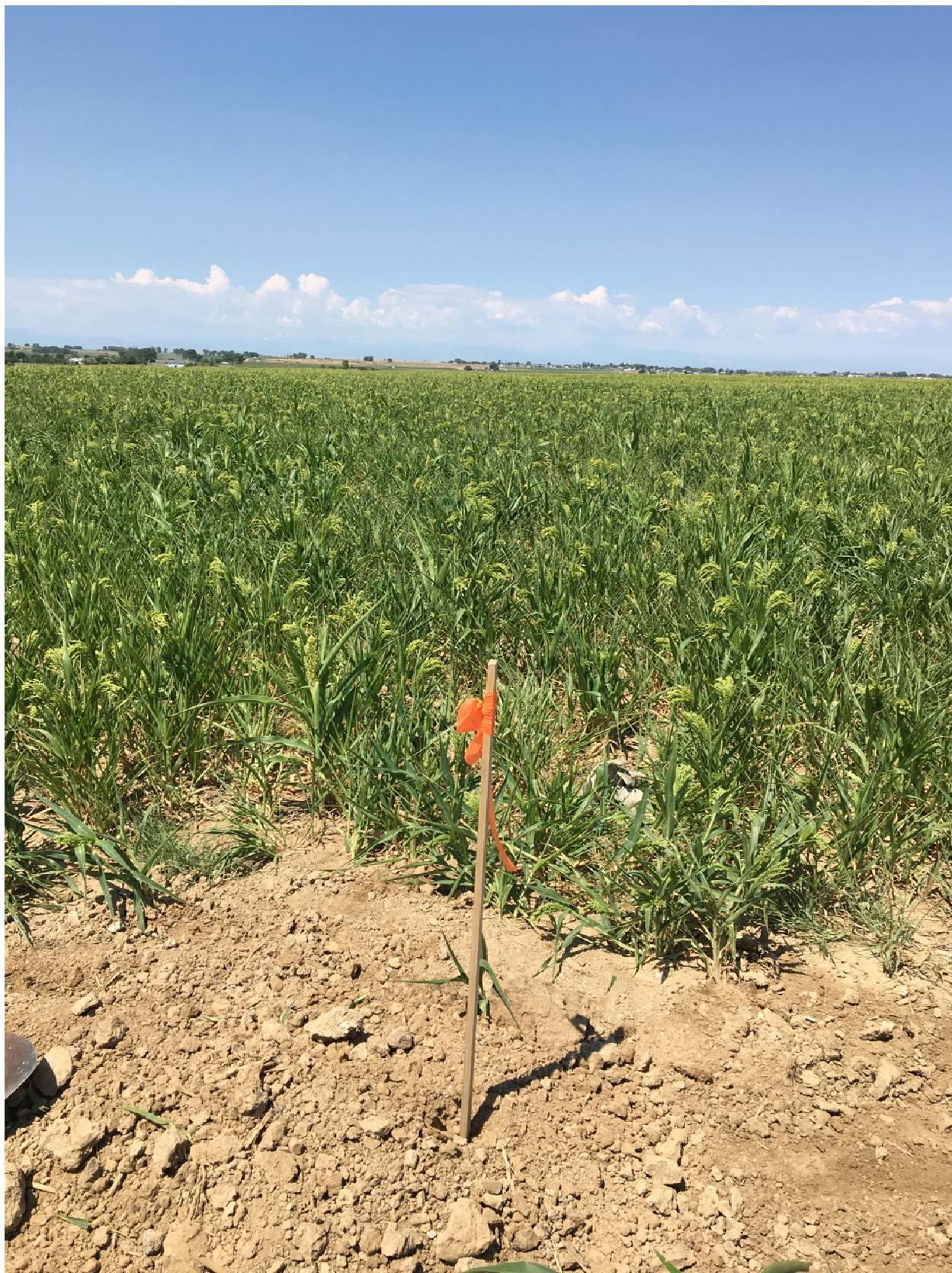
Photo: View of As-Drilled Location