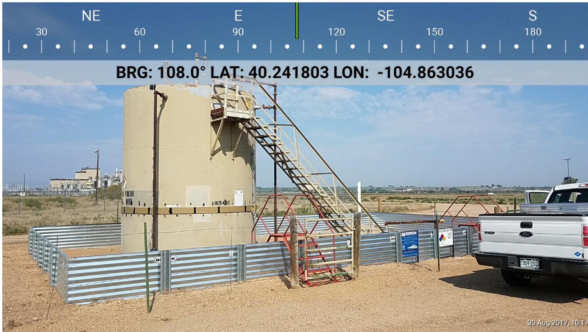
Tank Battery Location #: 329832