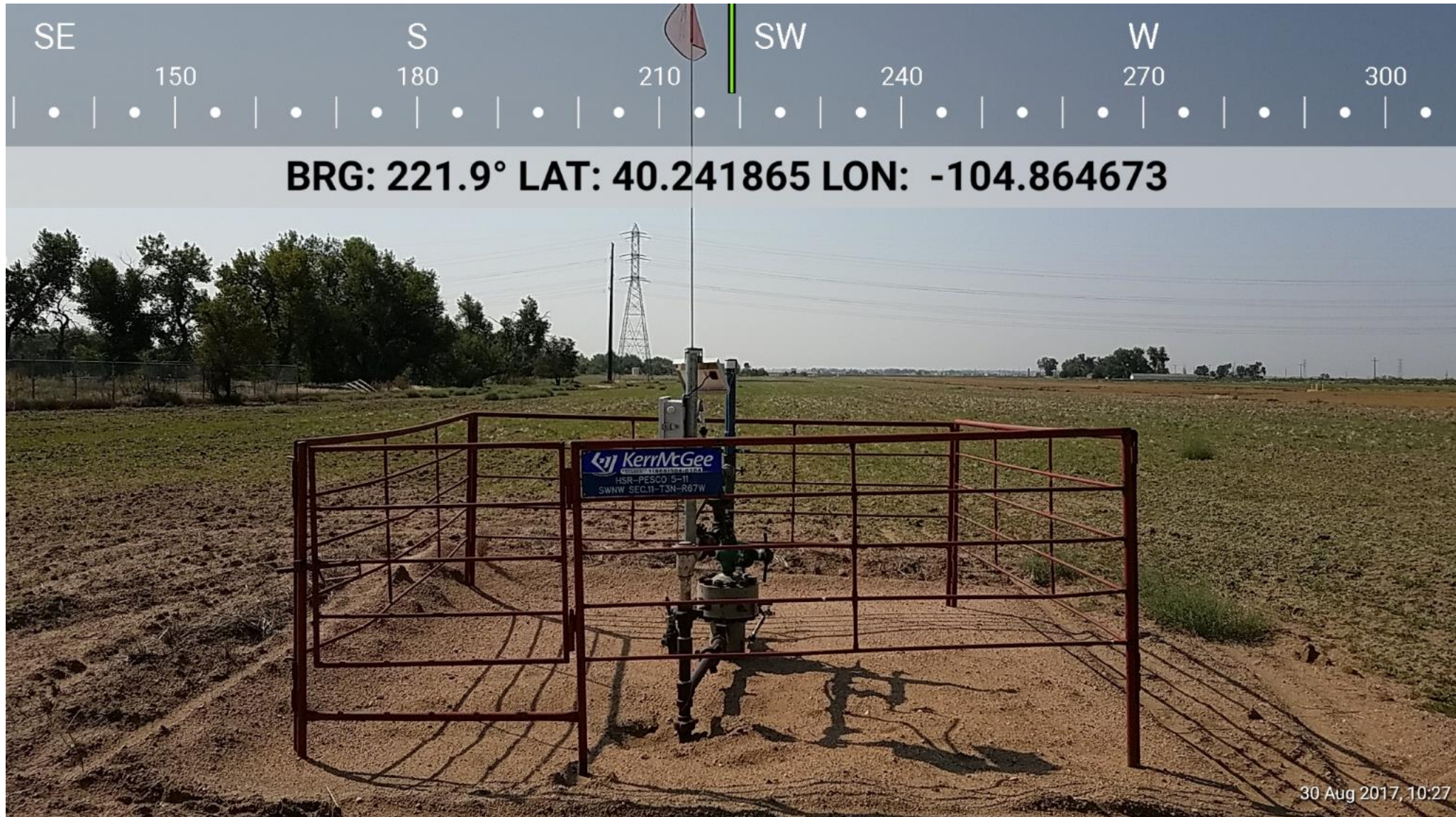
Wellhead Location #: 329832