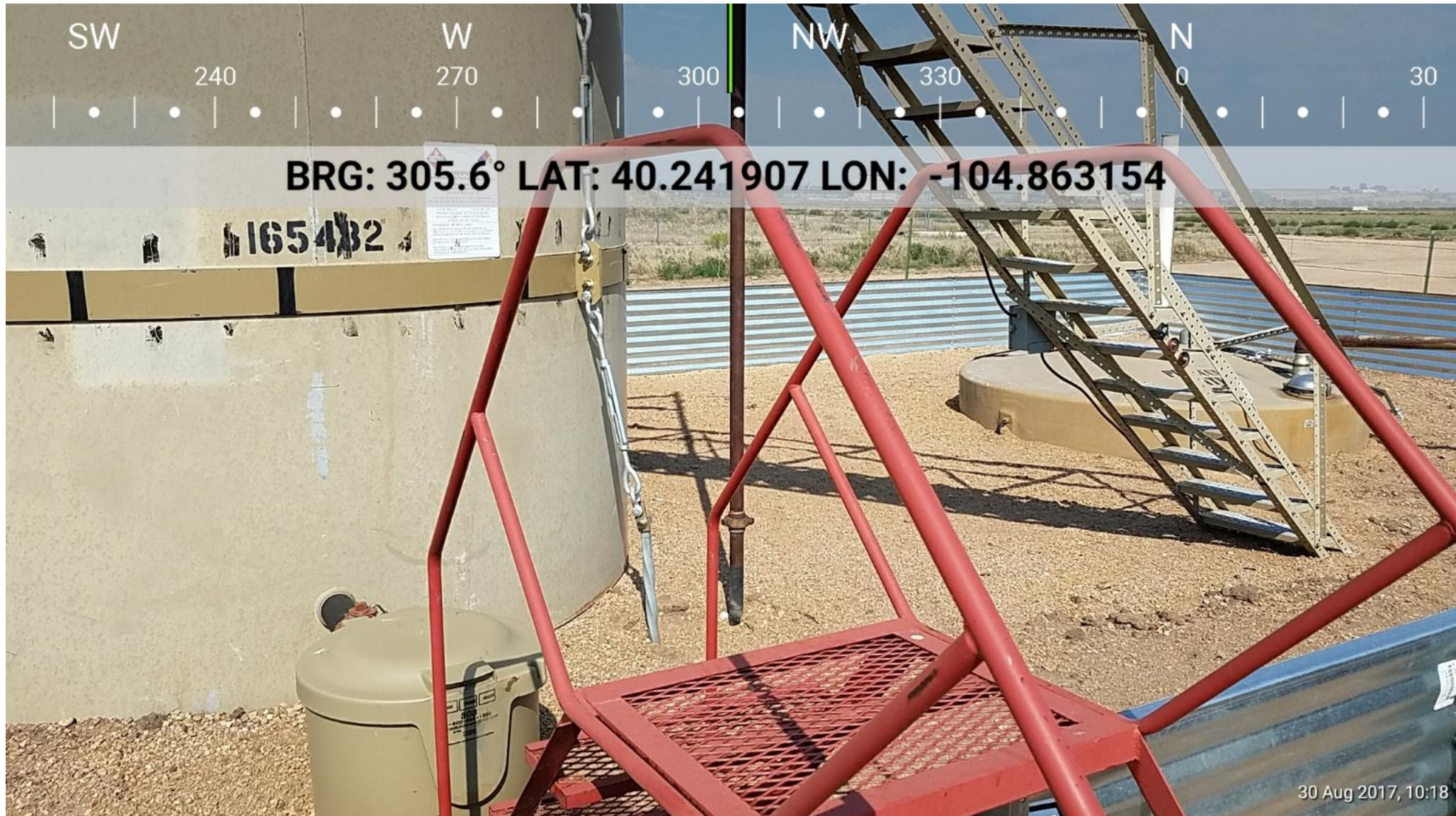
Closeup of Flood Anchoring on Crude Oil Tank