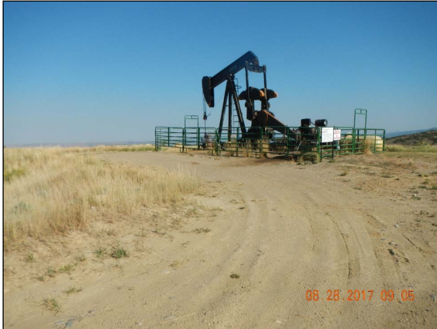
Photo 1. Overview of location taken at the entrance facing northwest. Stained soil from exhaust visible.