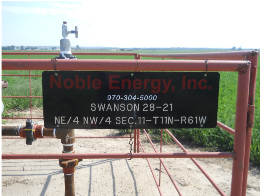
Wellhead sign looking south