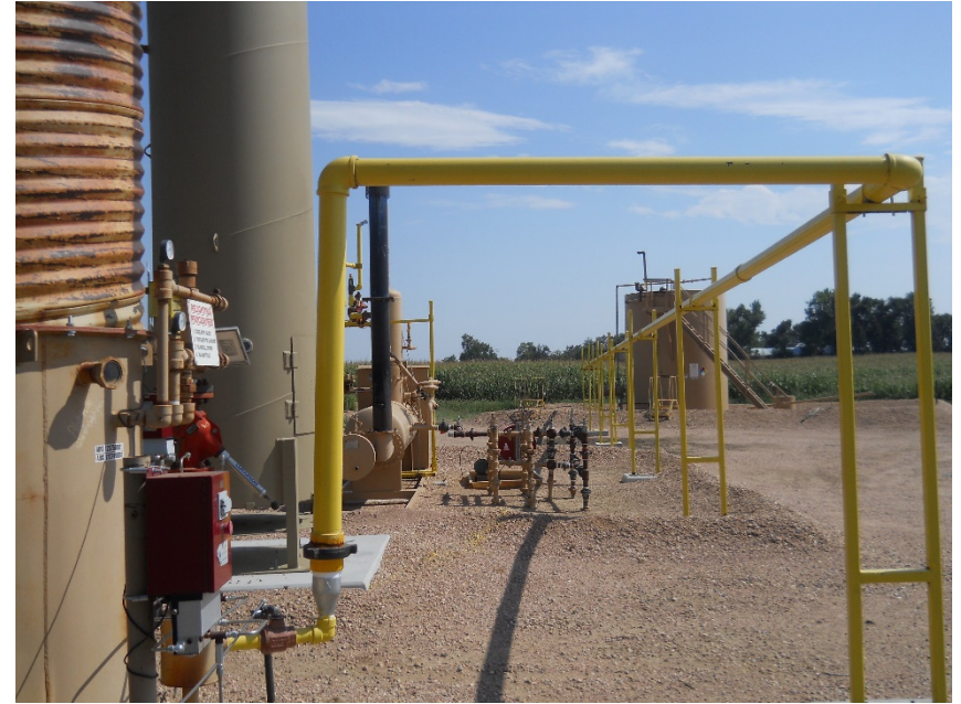
Battery looking south from ECDs