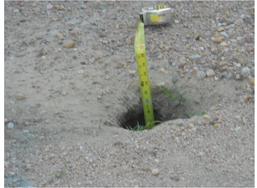
Hole inside of tank berm northeast of crude tank. Measuring approx. 10" long, 7" wide, 10" deep.