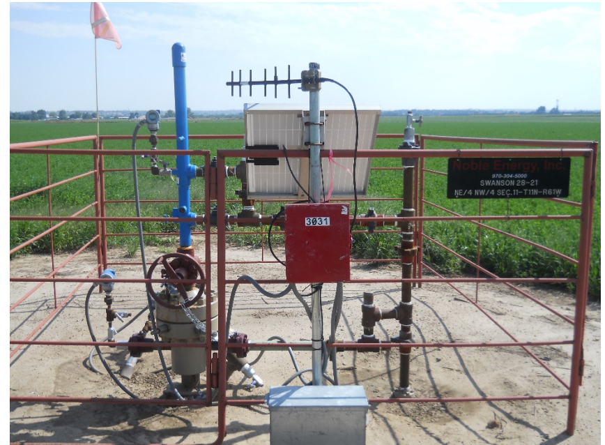
Wellhead looking south