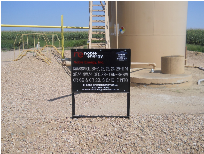
Tank battery sign looking east