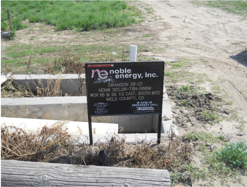
Well sign from county road headed south into well