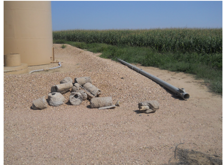
Unused equipment/trash southwest corner of tank berm