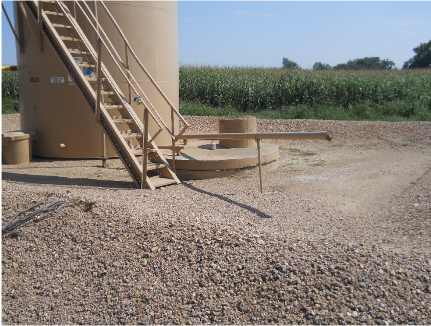
Water vault looking southeast. No placard or capacity posted