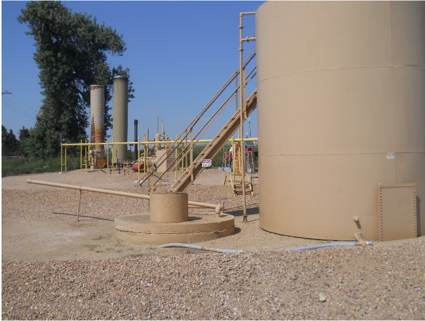
Battery looking northeast from southwest edge of location