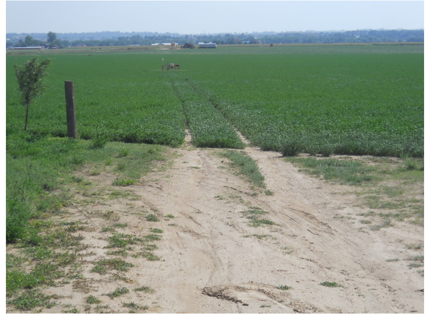
Access road looking south from county road. Well is in active crops, 2 track to wellhead