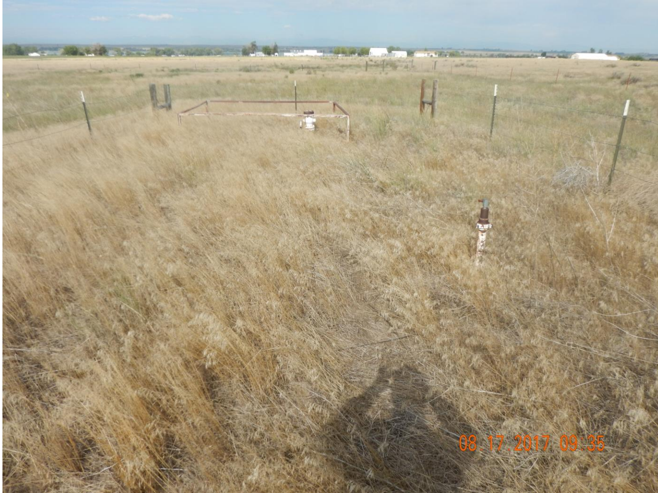
Photo 1: Photo taken from the east end of the location, facing west. Inspection Doc. # 682502155 required operator to remove risers from the location. Photo shows pipe risers still remain.