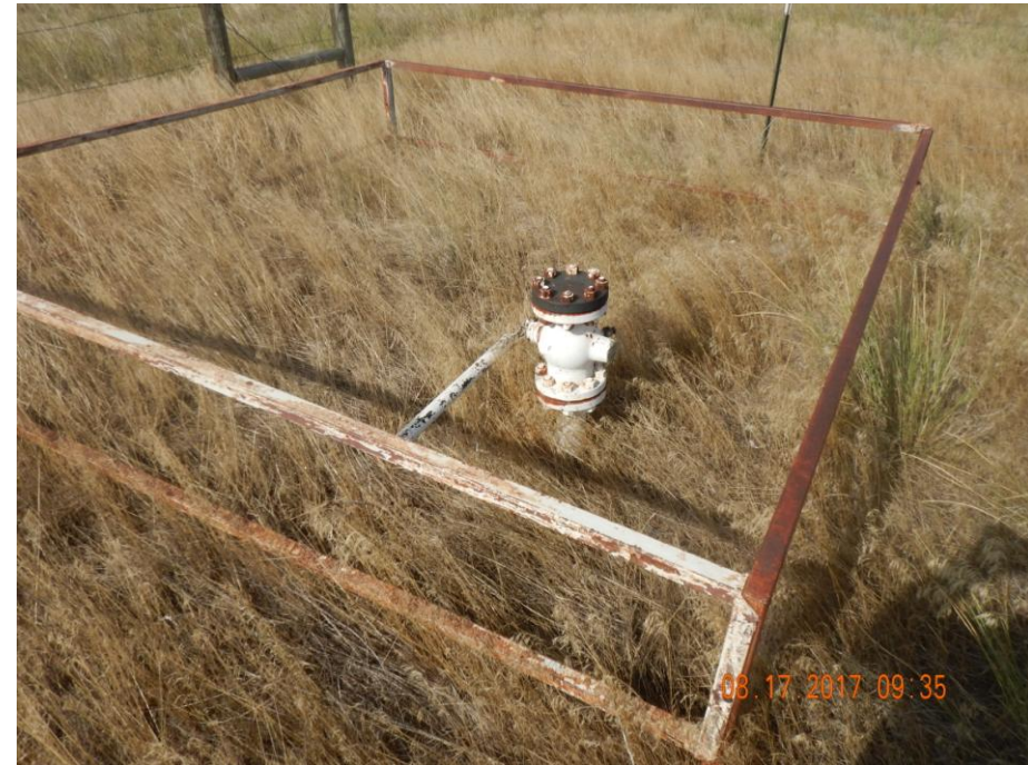
Photo 3: Photo taken from the location. Photo shows one of the two risers still remaining on the location.