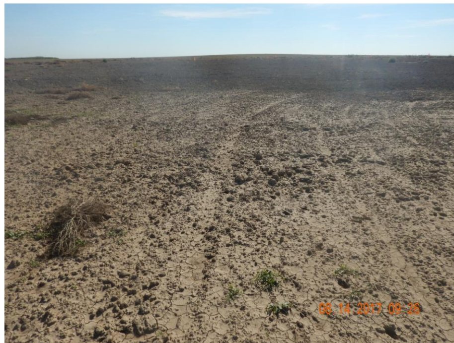
Photo 2: Photo taken from the west end of the location, facing east. Photo shows no additional BMPs have been implemented and used in conjunction with surface roughening per CA's from inspection doc. #682502162