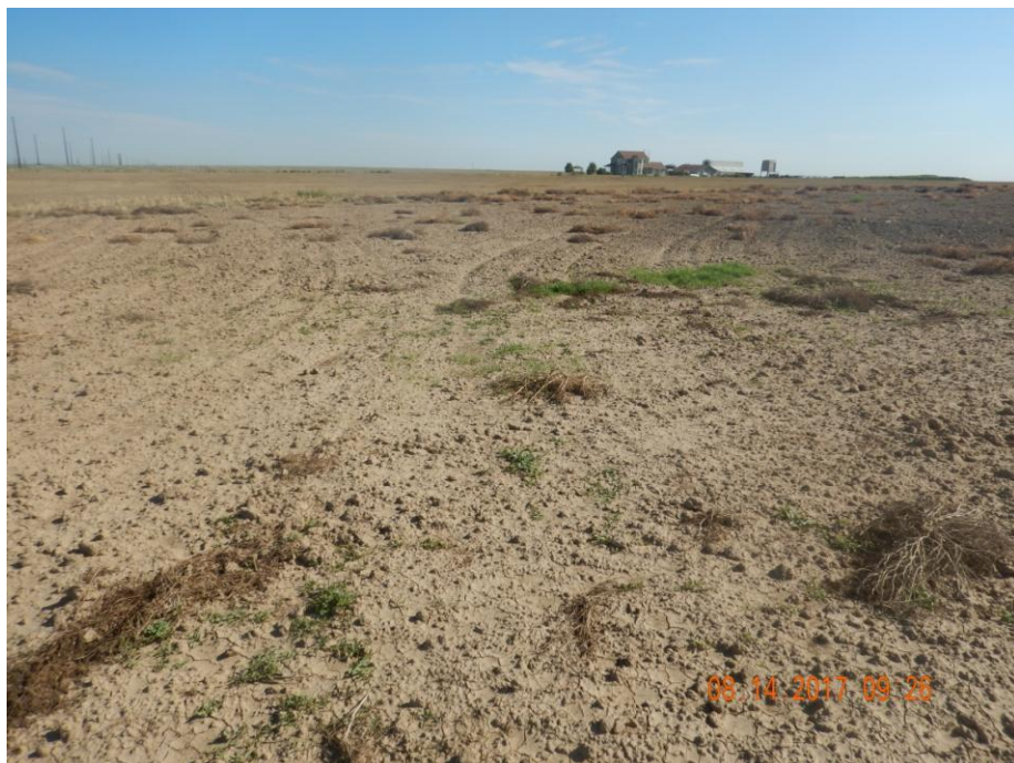
Photo 3: Photo taken from the west end of the location, facing north. Photo shows no additional BMPs have been implemented and used in conjunction with surface roughening per CA's from inspection doc. #682502162