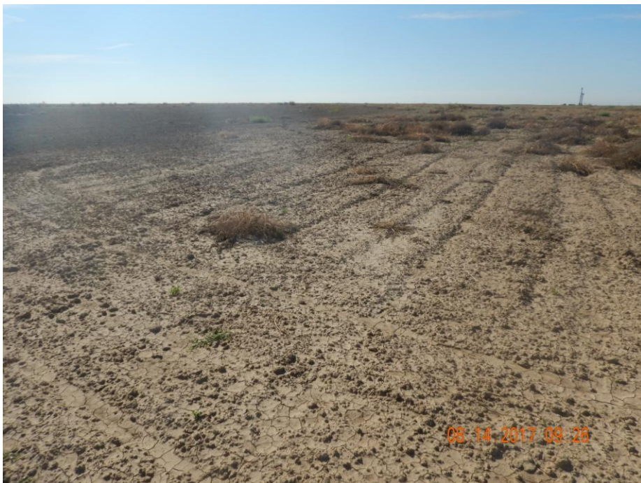
Photo 1: Photo taken from the west end of the location, facing south. Photo shows no additional BMPs have been implemented and used in conjunction with surface roughening per CA's from inspection doc. #682502162