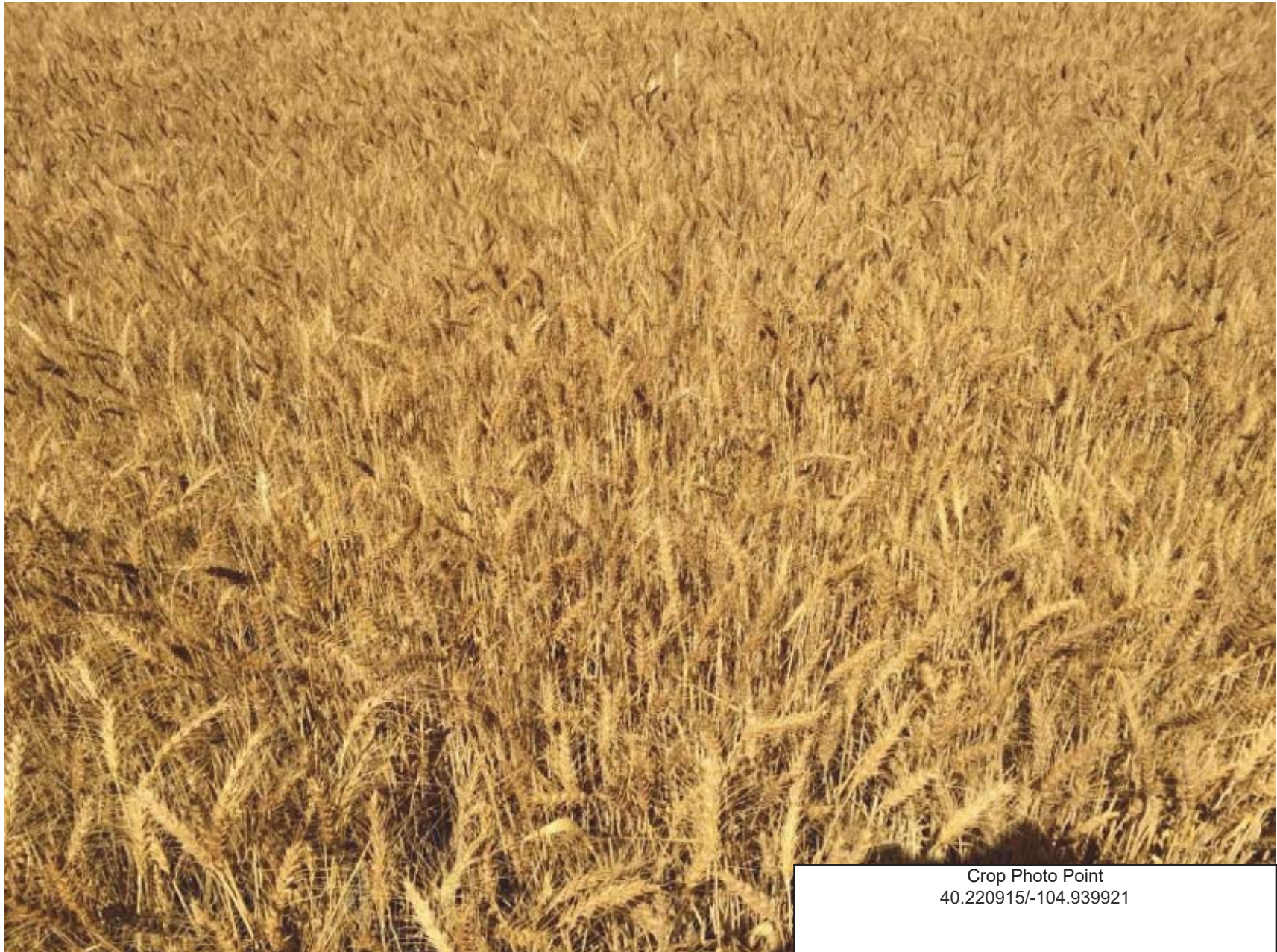
Crop Photo Point 40.220915/-104.939921