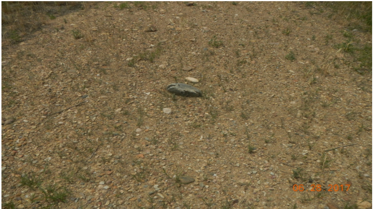
photo 3: There is gravel that remains where crop growth has not re-established.