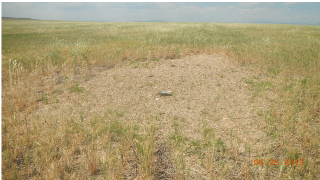
photo 1: Facing west toward the site. There is inadequate crop growth within this area approximately 25'x10' in size.