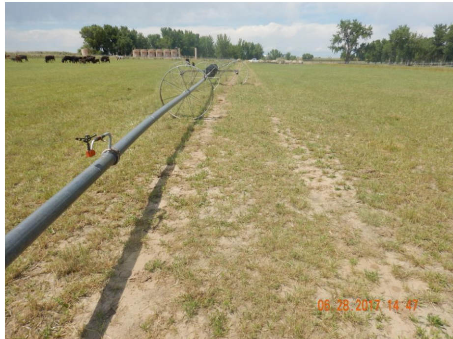
Photo 2: Photo taken the well site, facing north. Photo shows access road has not been reclaimed. Gravel and ruts remain, road has not been revegetated. Access road ends at well location.