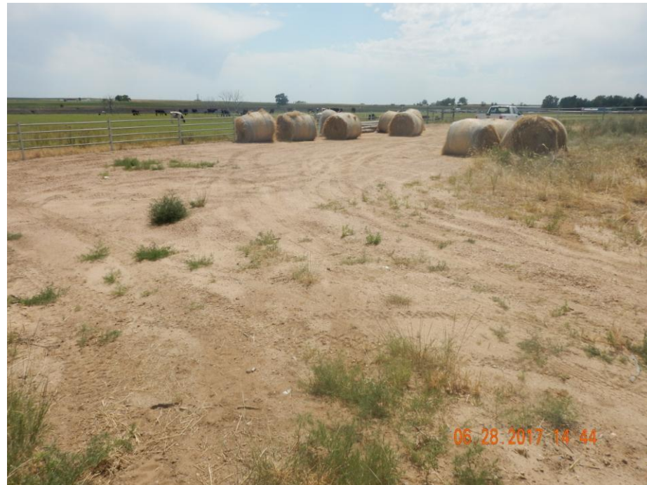
Photo 4: Photo taken from the northeast end of the battery location, facing southwest. Photo shows tank battery location has not been reclaimed. Adjacent reference area is irrigated hay fields.