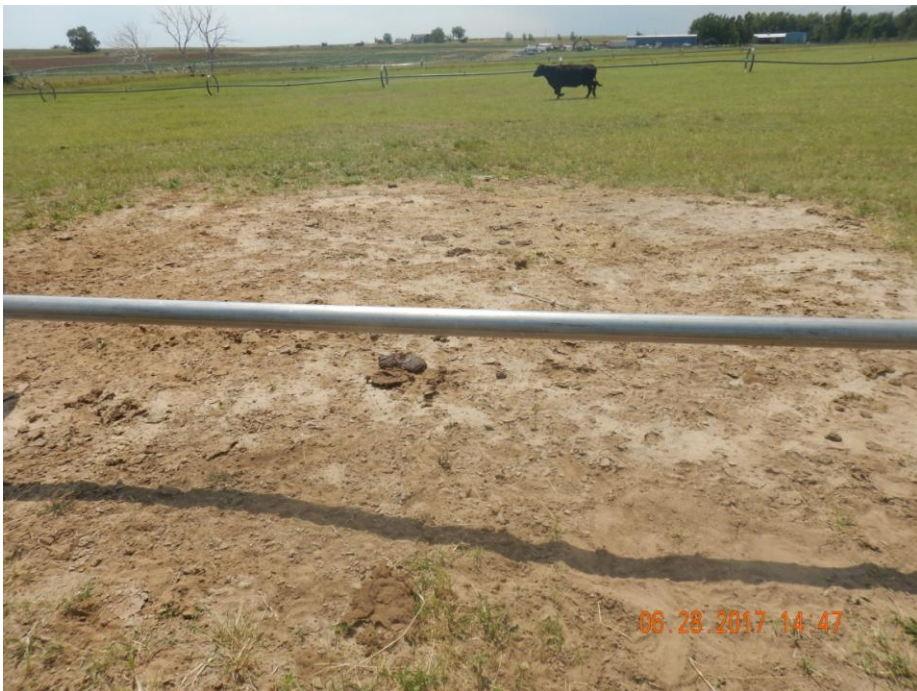
Photo 1: Photo taken from well location, facing west. Photo shows well site remains bare and exposed soil.