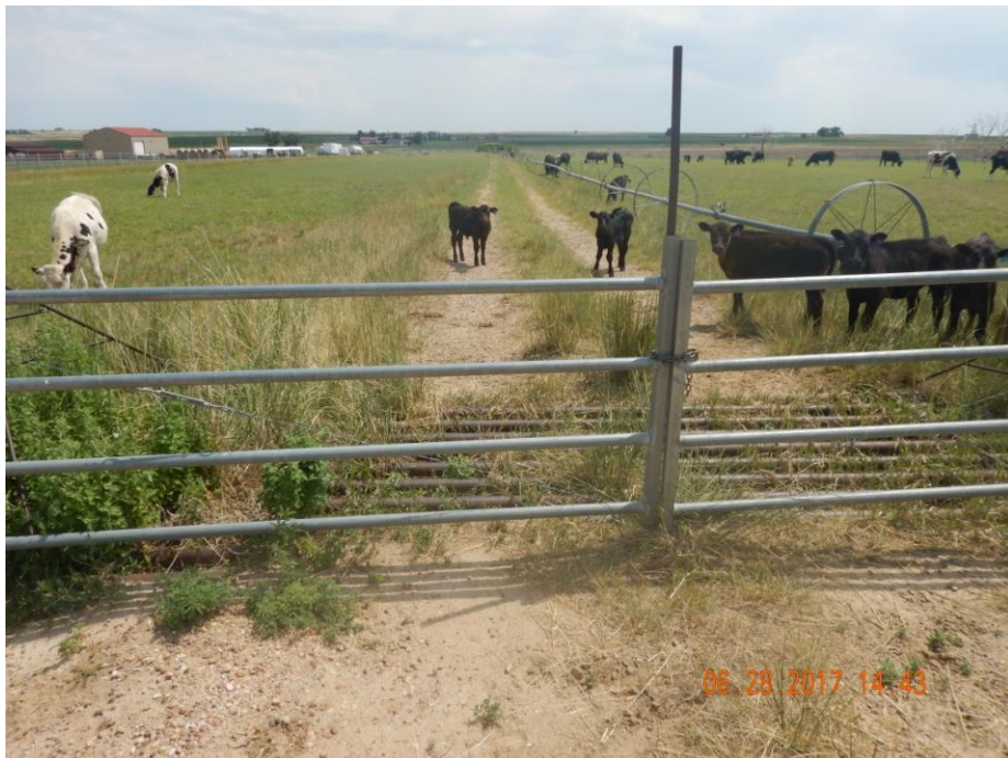
Photo 3: Photo taken from the battery location, north of well, facing south. Photo shows cattle guard and access road have not been reclaimed.