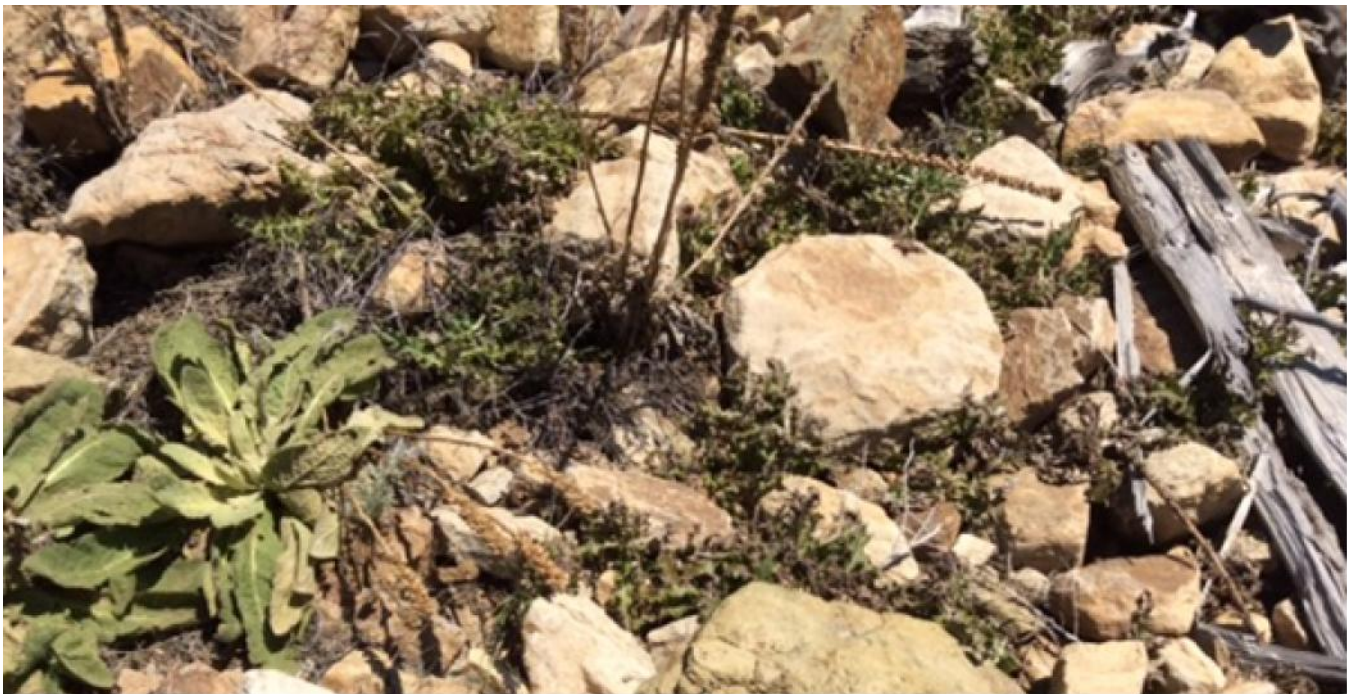
Photo 10: The Canada thistle and Common mullein that were growing in the rock rip rap on the south side of location were treated on 05/18/17.