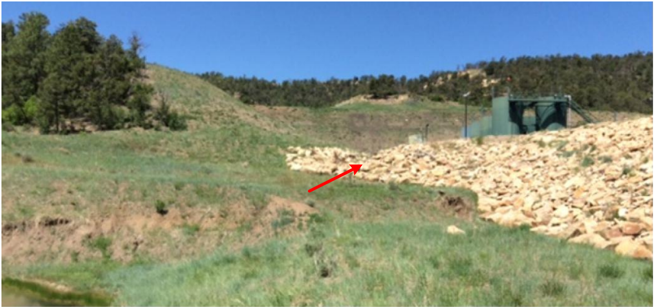
Photo 9: Southeast side of the location facing west. The red arrow points to where noxious weeds were treated on 05/18/17.

COGCC FIR Document # 673504275 (2) Corrective Actions are complete.