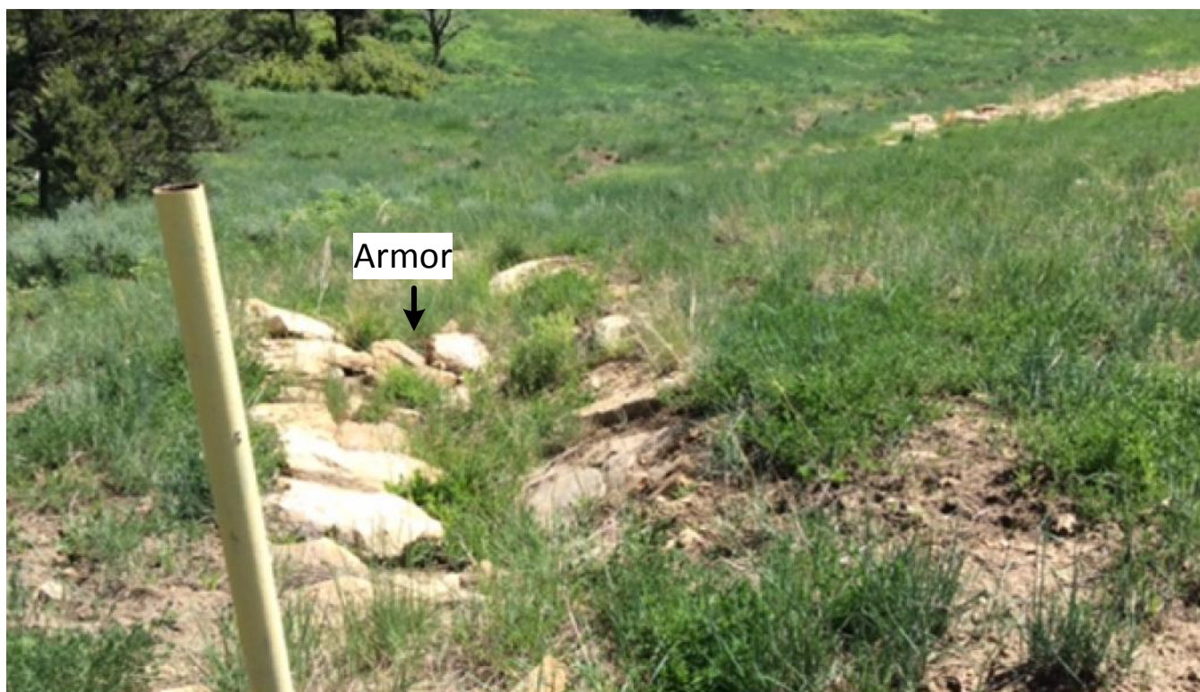
Photo 8: Culvert outlet is armored to prevent erosion from run off.