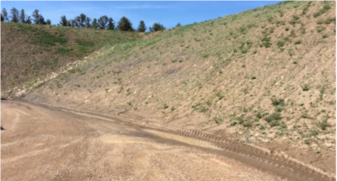
Photo 3: Facing southwest corner of the well pad cut slope. The sediment was removed from the pad.