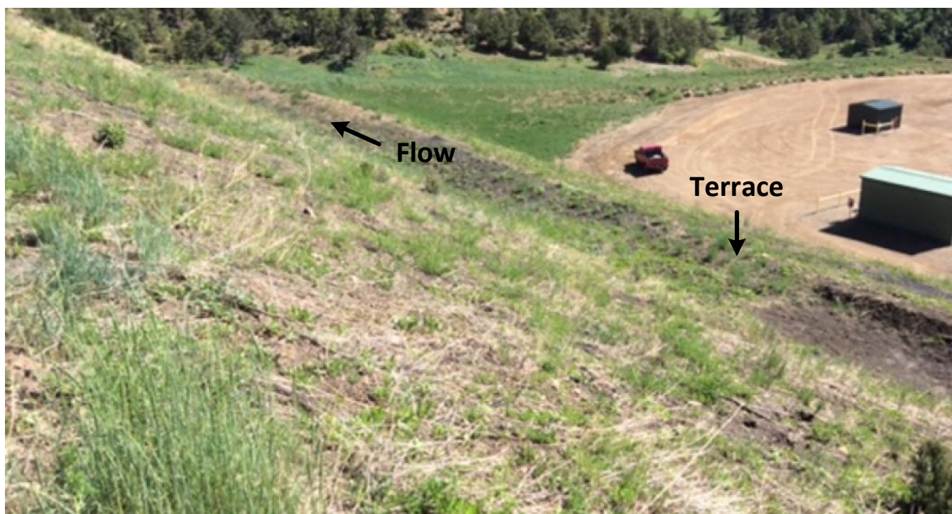
Photo 6: Run off was re-directed to flow down the terrace toward a culvert with an armored outlet.