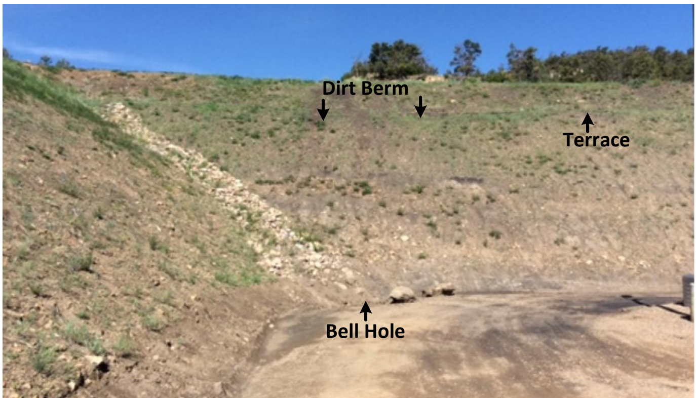
Photo 4: Established a bell hole at the toe of the rock run down to retain sediment. Installed a dirt berm on the terraced cut slope to direct run off away from the cut slope.