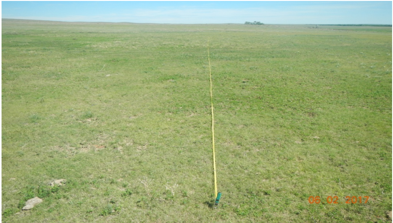
photo 1: Beginning of transect facing north at the location (disturbed).