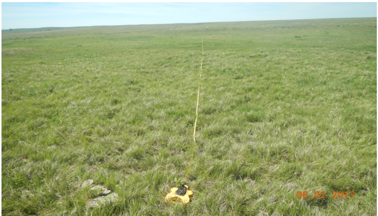
photo 2: End of transect facing south at the location (disturbed).