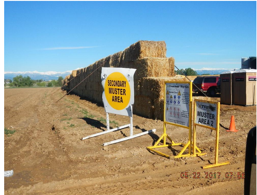
Bales ditches and signage at location entrance.