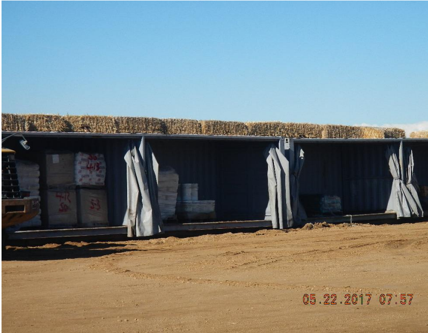
Conex chemical storage. Curtains being repaired, damaged during move.