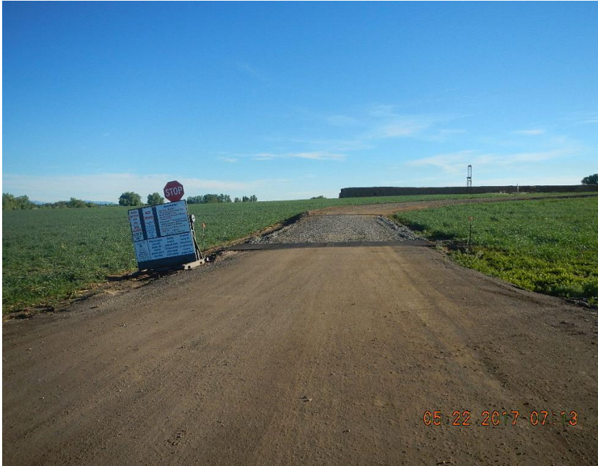
Location entrance signage