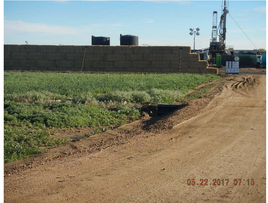
Culvert at location entrance