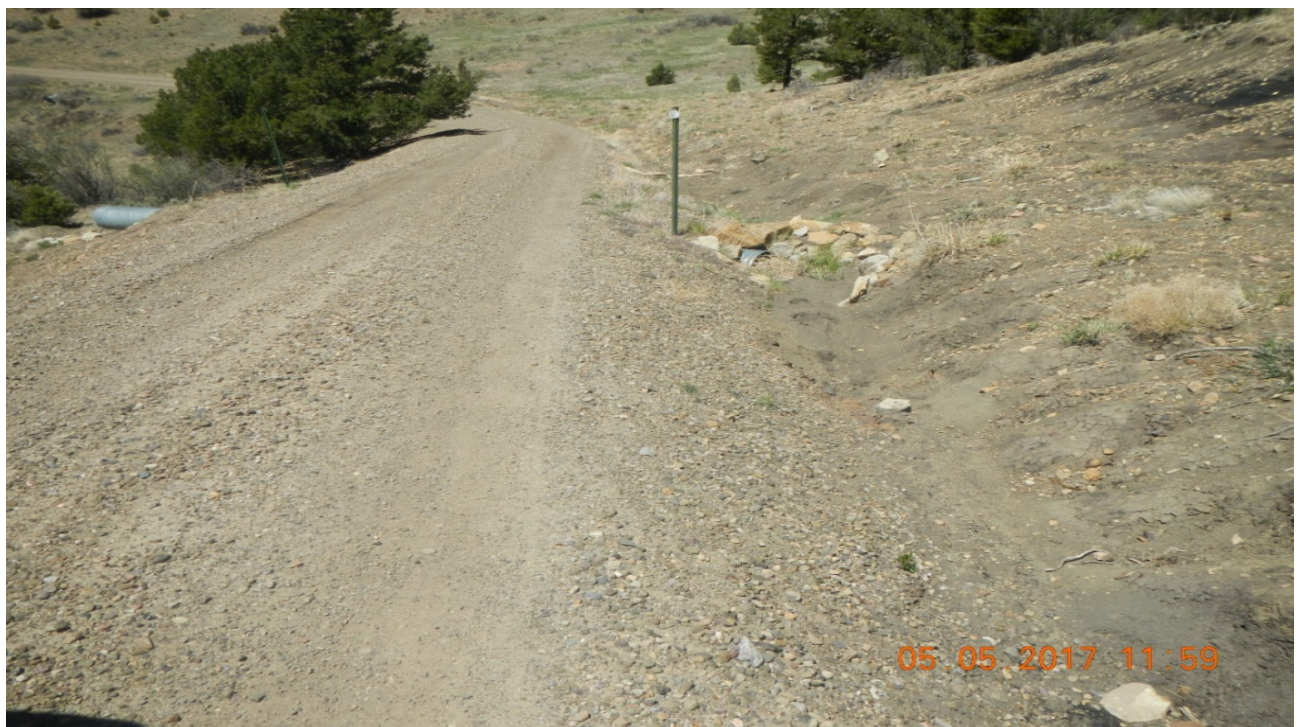
photo 2: Facing back toward the west. The culvert along the access road is filling in with sediment.