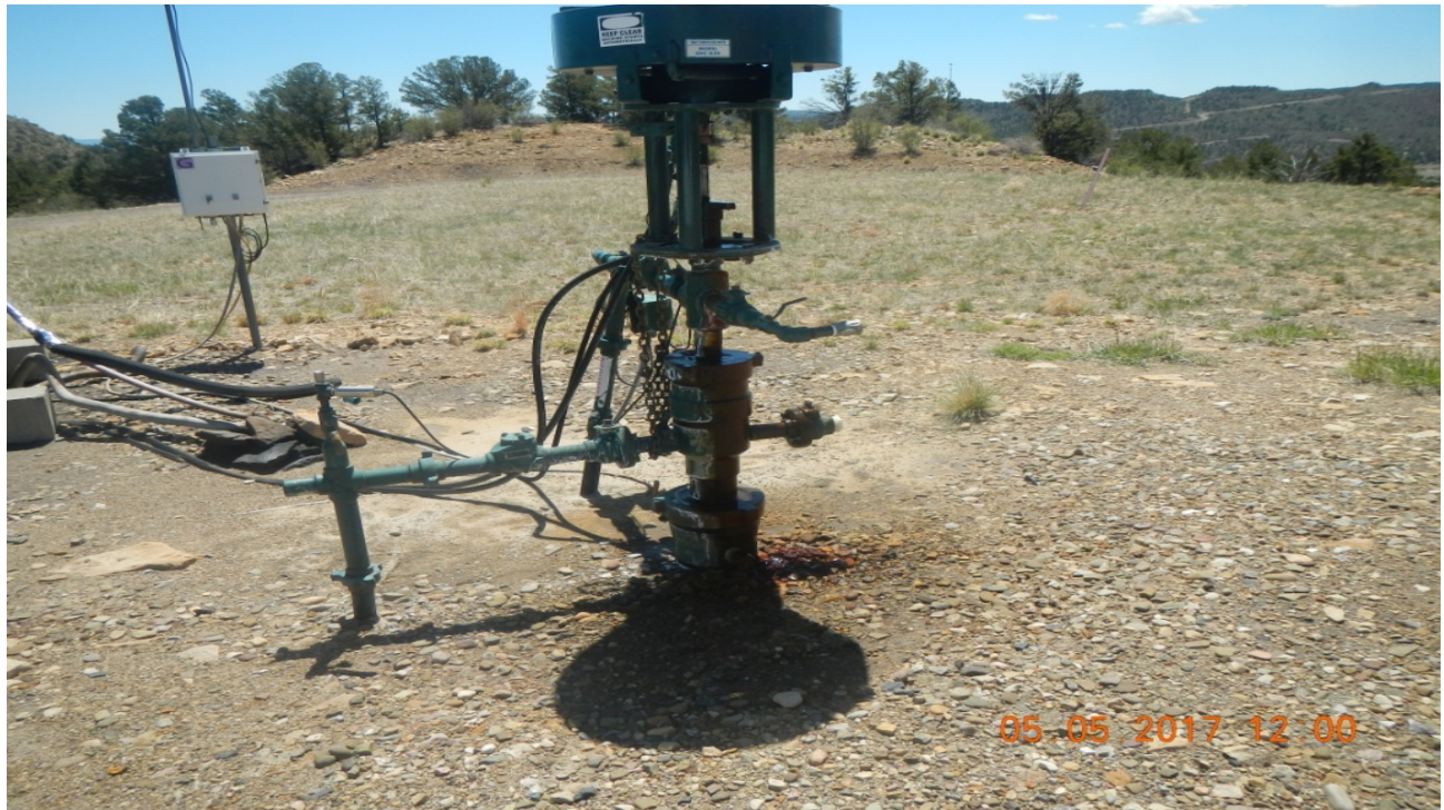
photo 3: The dripping water leak at the east wellhead has been reduced.