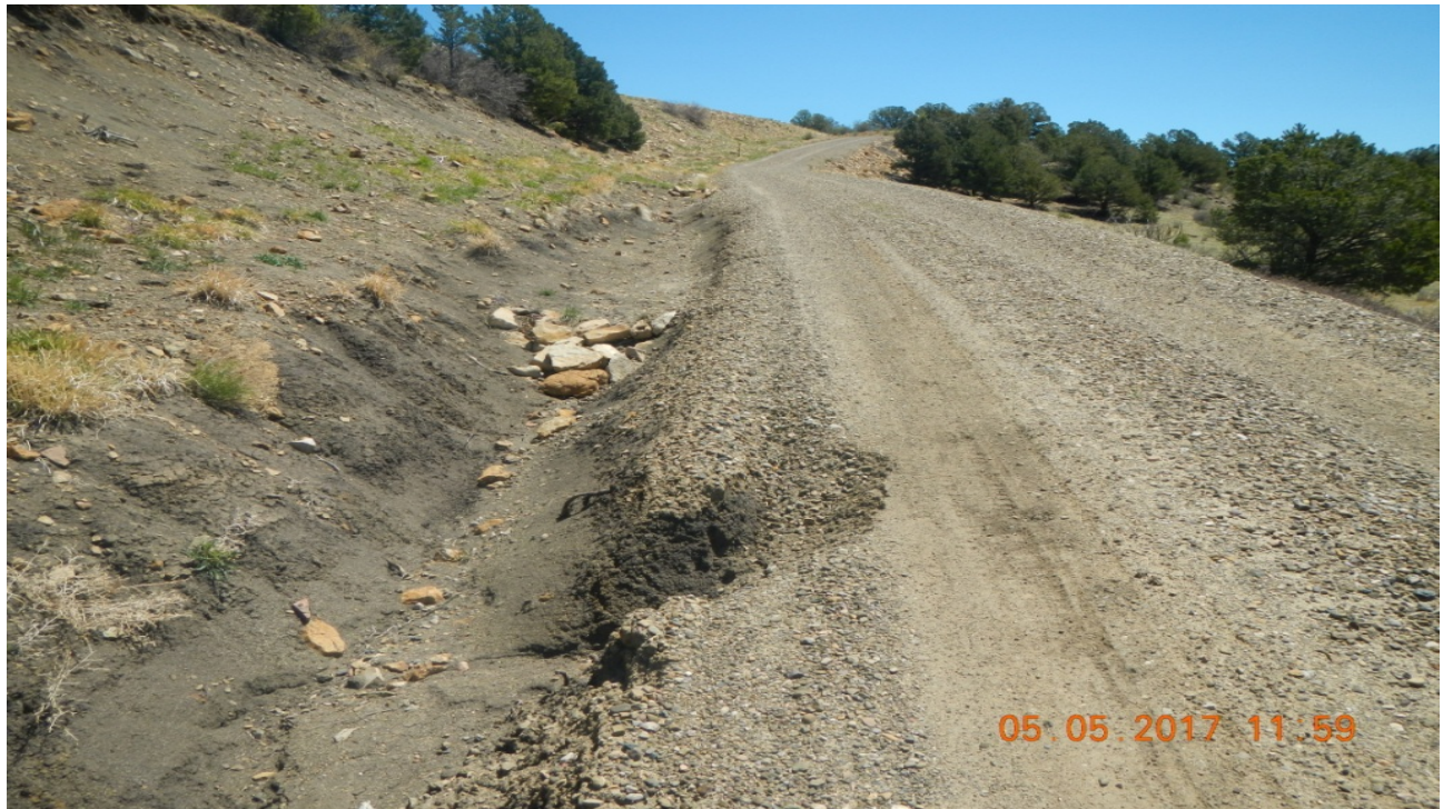
photo 1: There is erosion occurring along the access road and rock check dams have filled in with sediment.