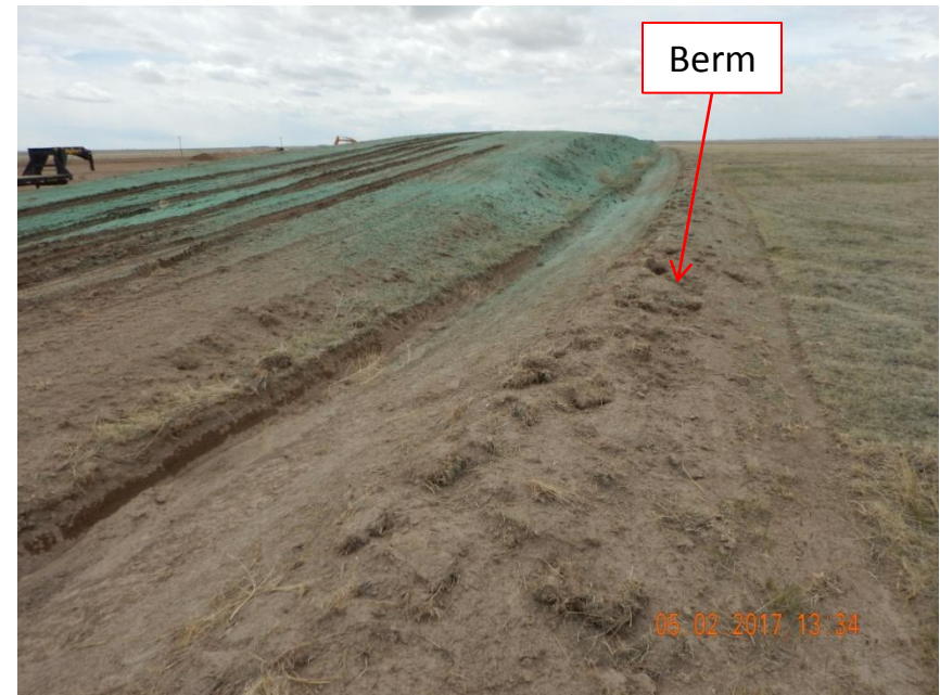
Photo 2. Photo taken from the northeastern location, facing West. Ditch and berm BMP has been installed around the entire perimeter of the location. Berm material does not appear to be sufficiently stabilized to prevent unconsolidated soil material from leaving location. Topsoil stockpile stored along the northern perimeter of the location.