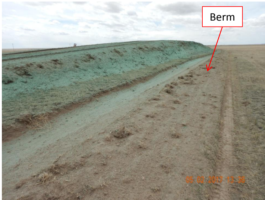
Photo 3. Photo taken from the northwestern location, facing West. Ditch and berm BMP has been installed around the entire perimeter of the location. Berm material does not appear to be sufficiently stabilized to prevent unconsolidated soil material from leaving location. Topsoil stockpile stored along the northern perimeter of the location.