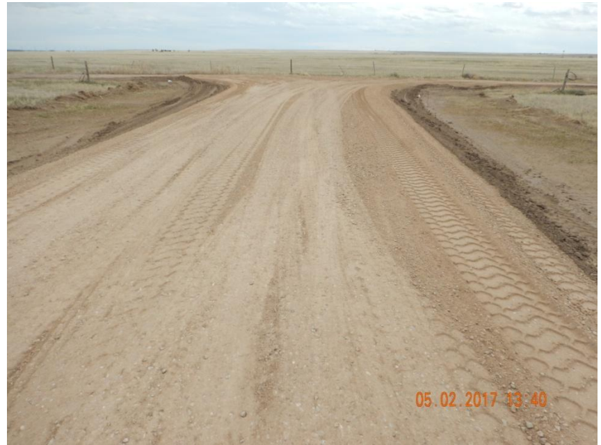
Photo 10. Photo taken from the entrance of the location, facing South. Gravel has been installed at the entrance of location.