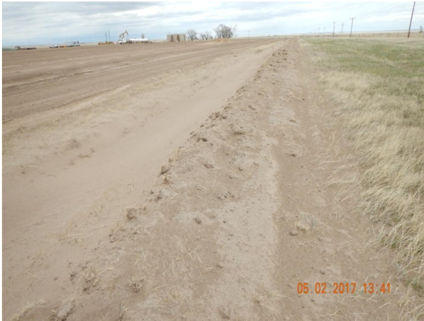
Photo 7. Photo taken from the southeastern location, facing East. Ditch and berm BMP has been installed around the entire perimeter of the location. Berm material does not appear to be sufficiently stabilized to prevent unconsolidated soil material from leaving location. BMP maintenance may be required along portions of the ditch BMP as sediment appears to be accumulating in the ditch BMP.