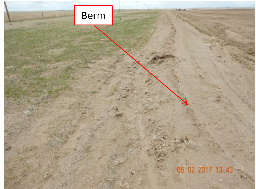
Photo 8. Photo taken from the southeast location, facing West. Ditch and berm BMP has been installed around the entire perimeter of the location. Berm material does not appear to be sufficiently stabilized to prevent unconsolidated soil material from leaving location. This photo illustrates how some of that material is starting to spread out.