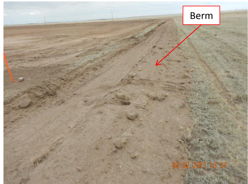
Photo 4. Photo taken from the western location, facing South. Ditch and berm BMP has been installed around the entire perimeter of the location. Berm material does not appear to be sufficiently stabilized to prevent unconsolidated soil material from leaving location.