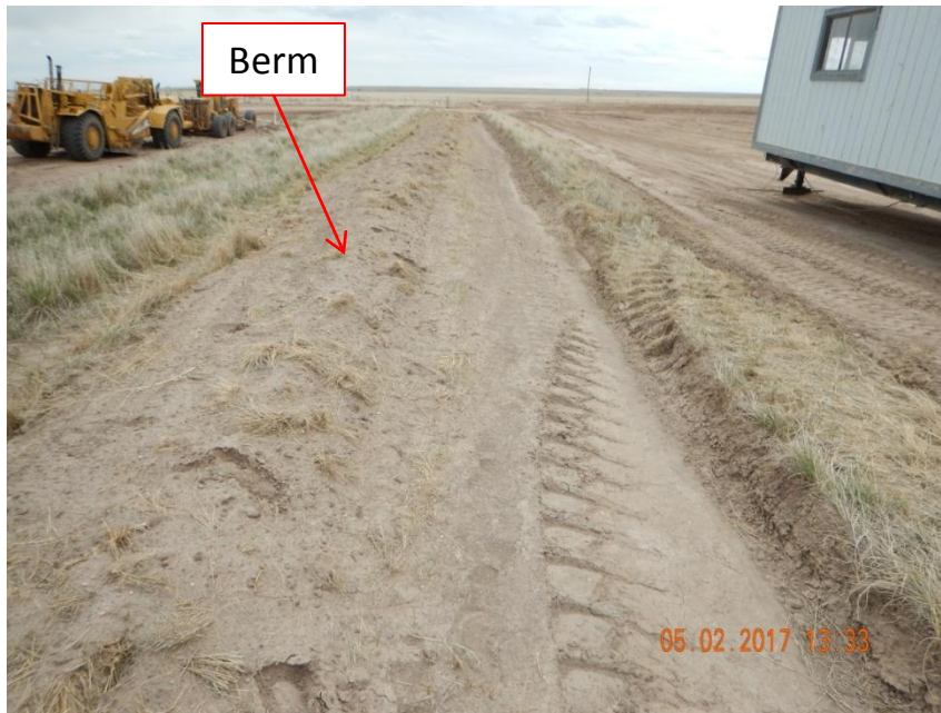
Photo 1. Photo taken from the northeastern location, facing South. Ditch and berm BMP has been installed around the entire perimeter of the location. Berm material does not appear to be sufficiently stabilized to prevent unconsolidated soil material from leaving location.