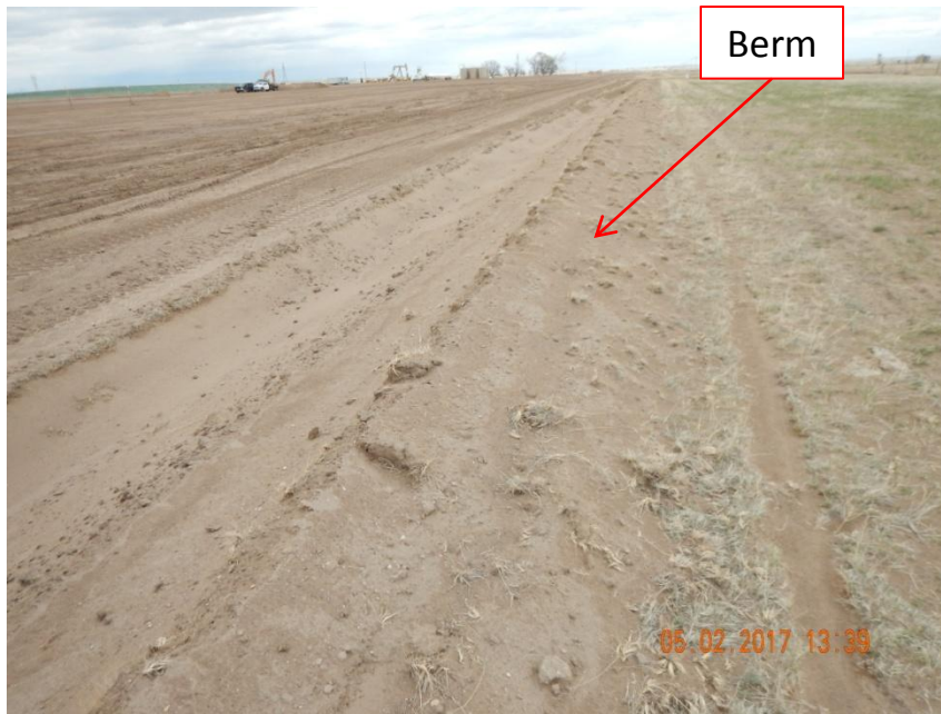
Photo 5. Photo taken from the southwestern location, facing East. Ditch and berm BMP has been installed around the entire perimeter of the location. Berm material does not appear to be sufficiently stabilized to prevent unconsolidated soil material from leaving location. BMP maintenance may be required along portions of the ditch BMP as sediment appears to be accumulating in the ditch BMP.