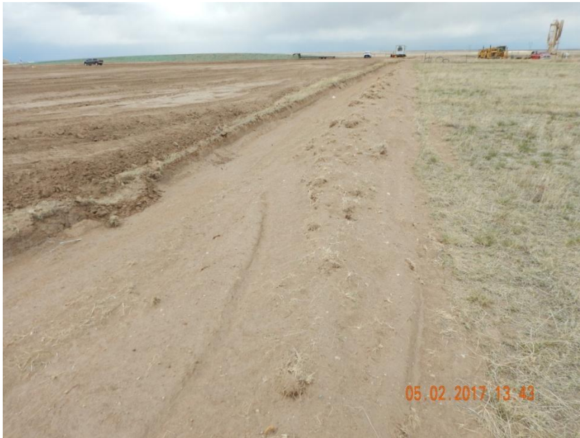
Photo 9. Photo taken from the southeast location, facing North. Ditch and berm BMP has been installed around the entire perimeter of the location. Berm material does not appear to be sufficiently stabilized to prevent unconsolidated soil material from leaving location.