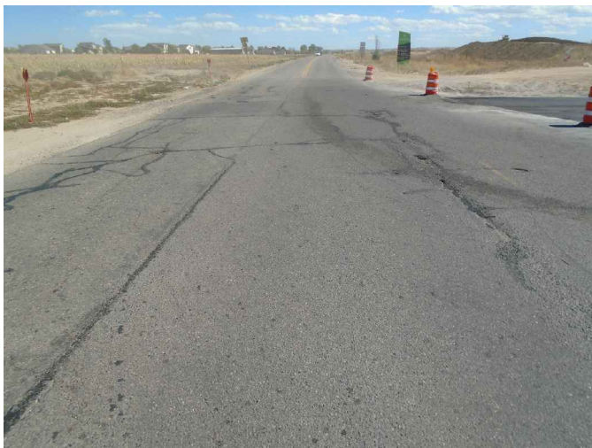
VIEW EAST (E 168TH AVE.)

SECTION: 34 TOWNSHIP: 1N RANGE: 66W 6TH. P.M. WELD COUNTY, CO DATE: 10/4/2016