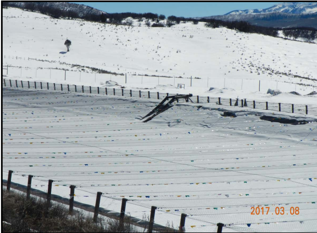
Lower Pit. Looking south. Manifold at the center of the photo.