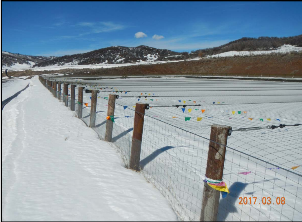
Upper Pit (looking Northwest). Netting in good general conditions. Color flags.