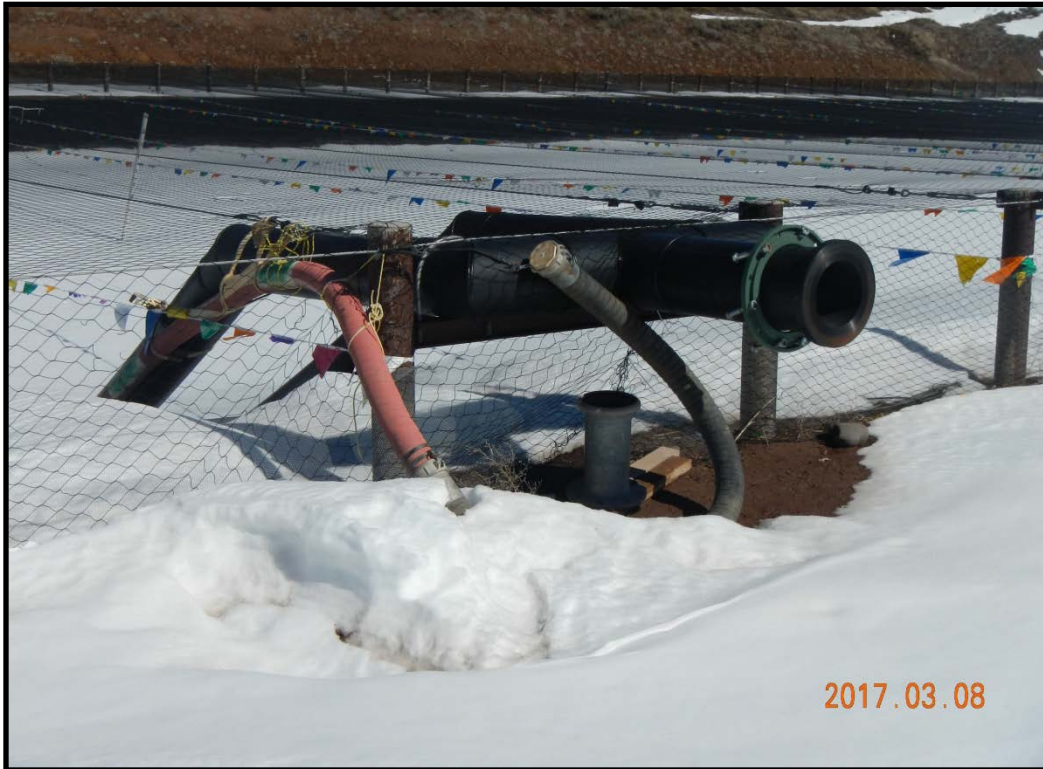
Lower Pit. Permanently Installed Produced Water discharge Manifold