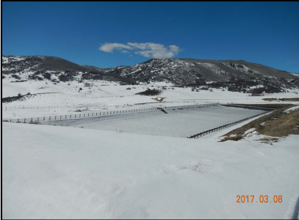
Lower Pit (Looking West)