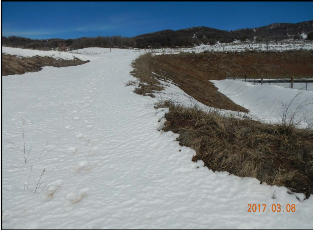
Access/Emergency road around the upper pit (looking Northeast)