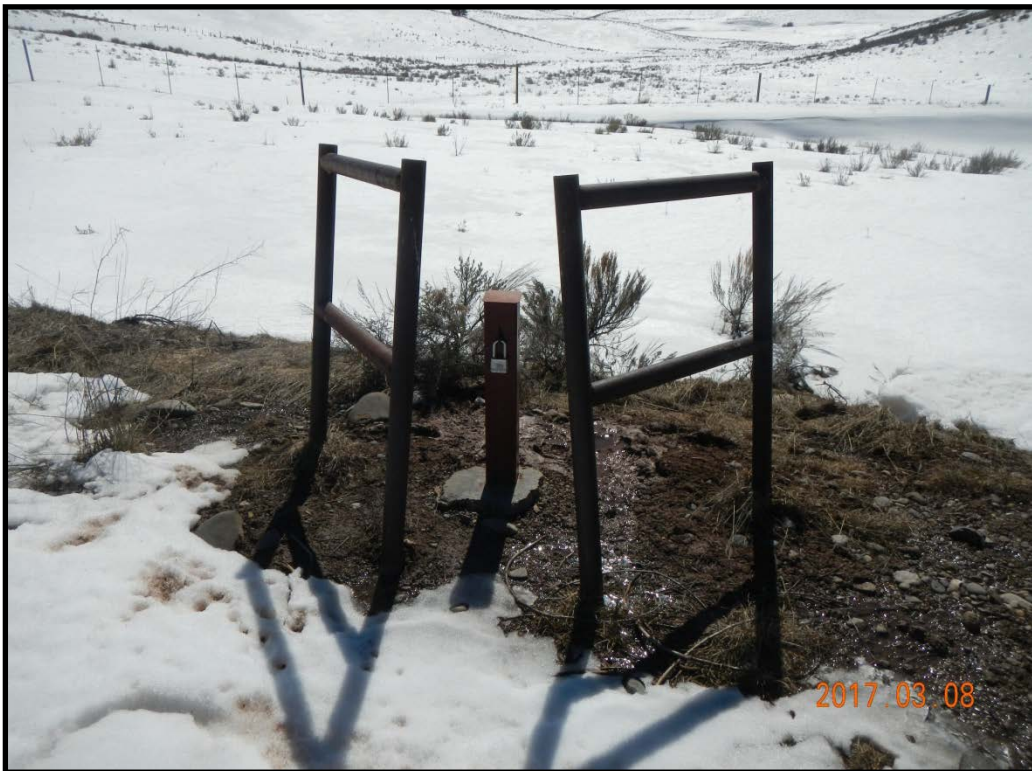
One of the three monitoring wells. All three on the south/down-gradient side of lower pit. Note: There is a MW up-gradient (north) of the upper pit.

All four are regularly gauged and sampled