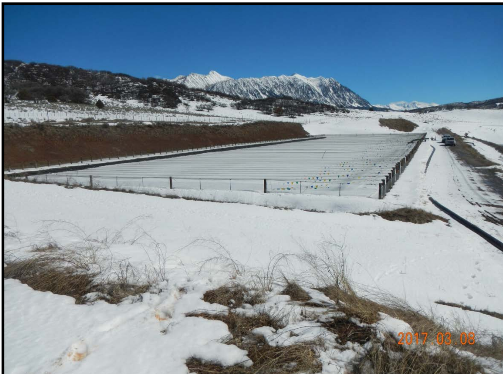
Upper Pit (looking Southeast)