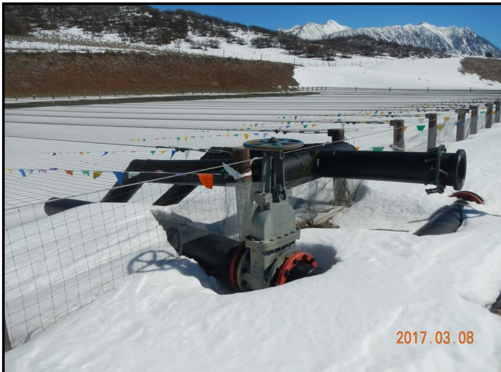
Upper Pit (looking East). Produced Water Discharge Manifold