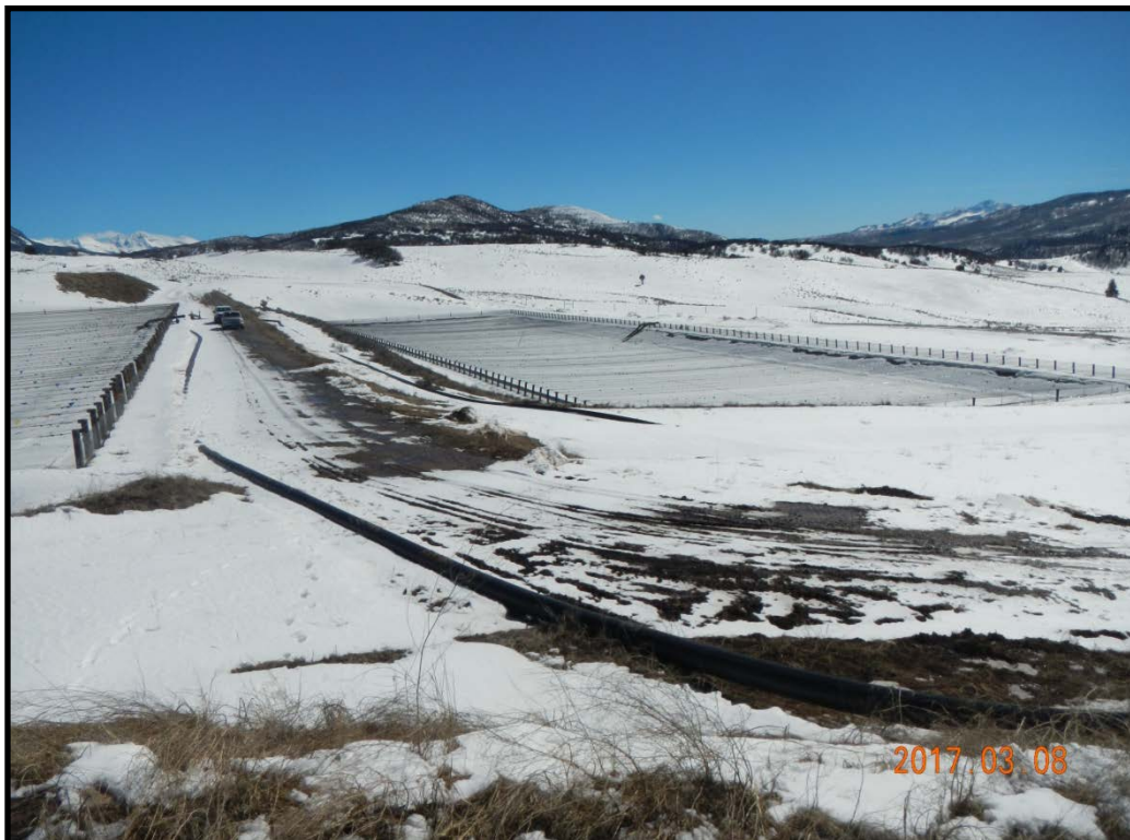
Lower Pit. Looking southeast. Access/service road continues around lower pit (and around upper pit as well).