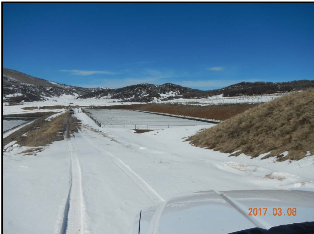
Upper Pit (Looking Norwest)