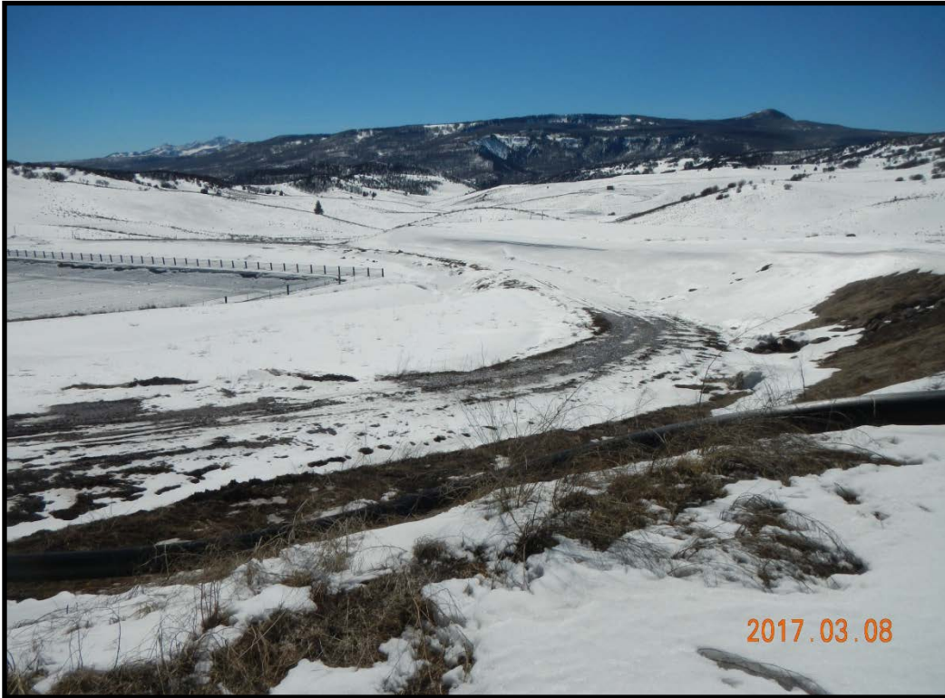
Lower Pit. Looking south. Access/service road and storm water management (drainage and retention pond on the down gradient side (far south on the photo).