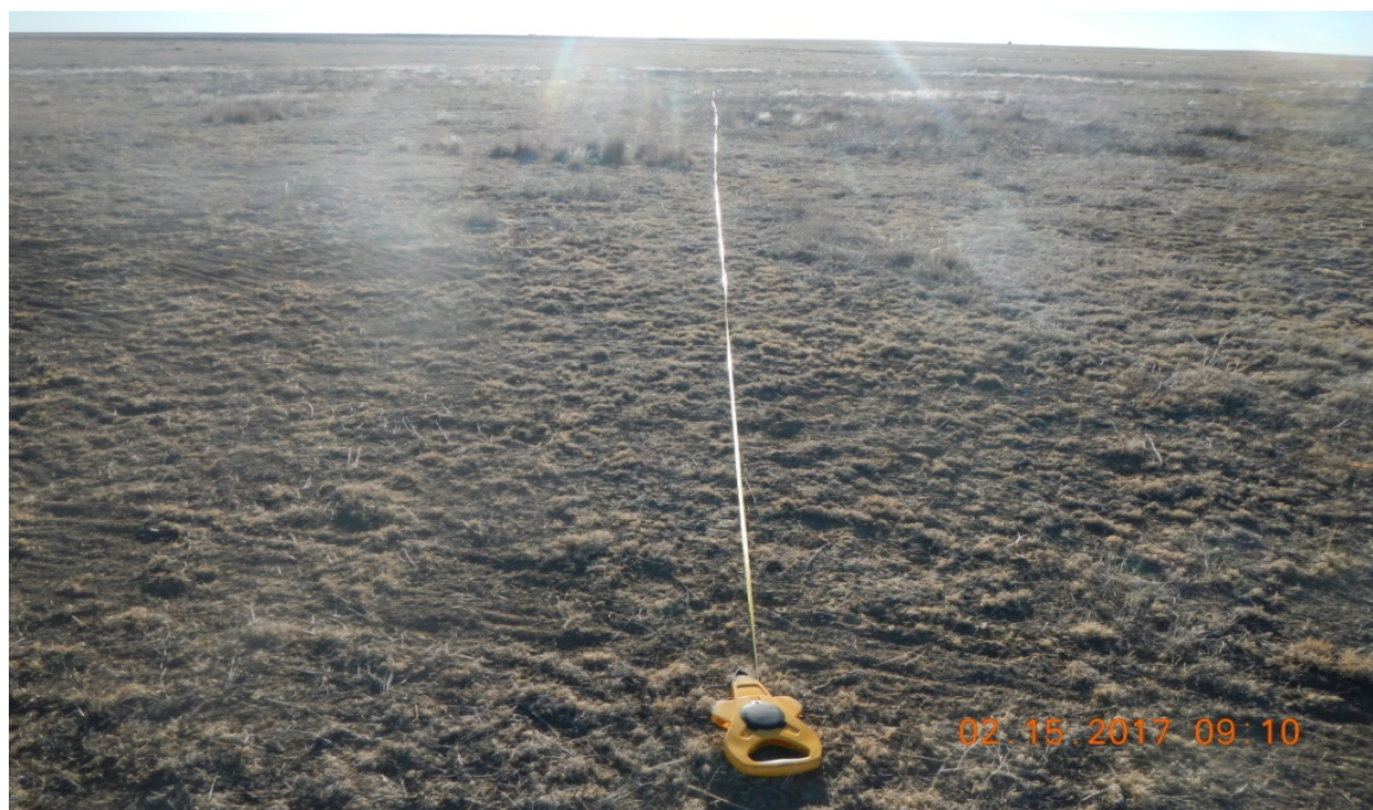
photo 2: Facing southeast at the end of the disturbed area transect.