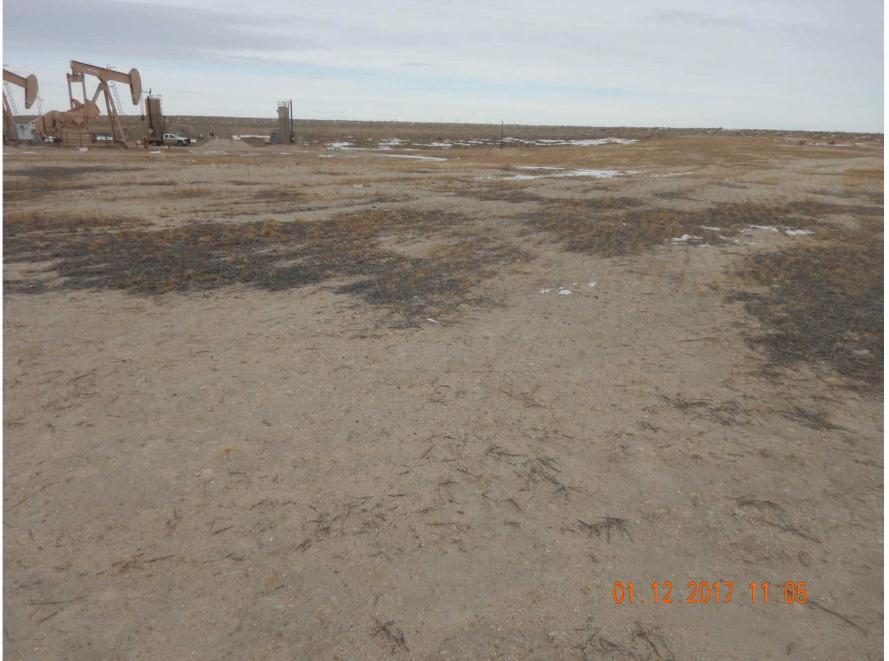
Figure 3: Photo taken from the south end of the location, facing north. Photo shows interim and production areas.