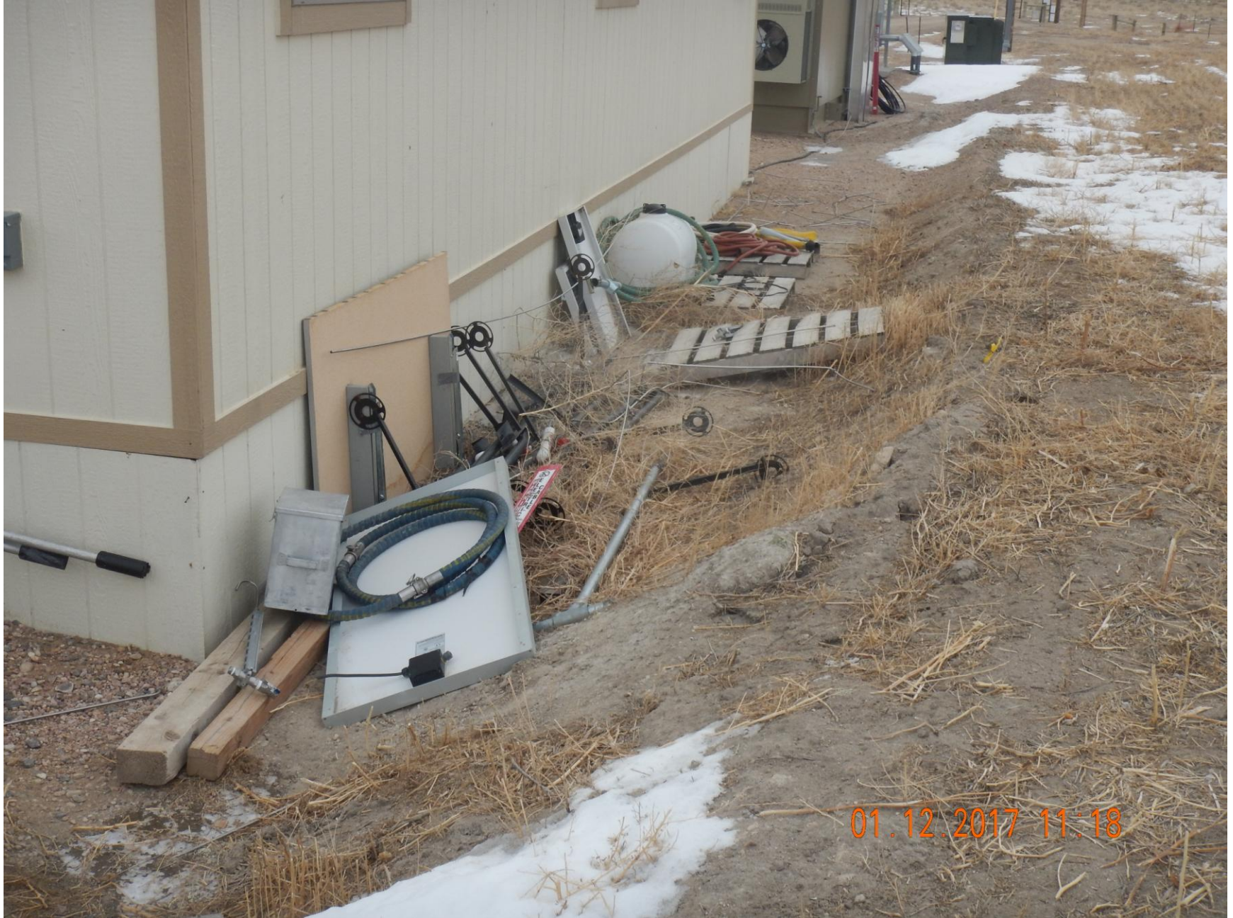
Figure 14: Photo taken from the west end of the location. Photo shows trash, debris and equipment being stored behind buildings on the west end of the location and need to be removed.