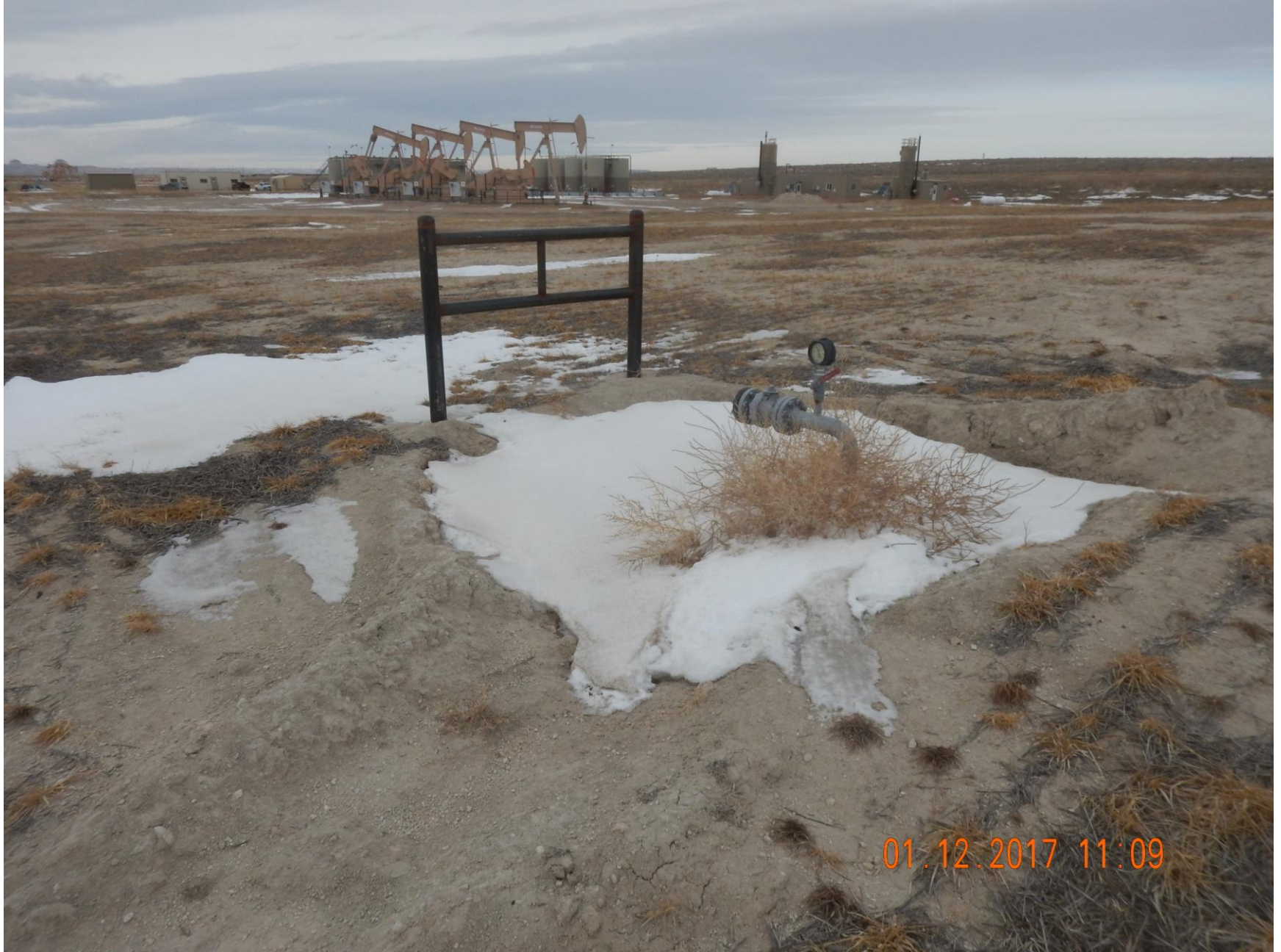
Figure 7: Photo taken from the southeast end of the interim area. Photo shows pipe riser remaining on the interim area. Equipment needs to be removed.