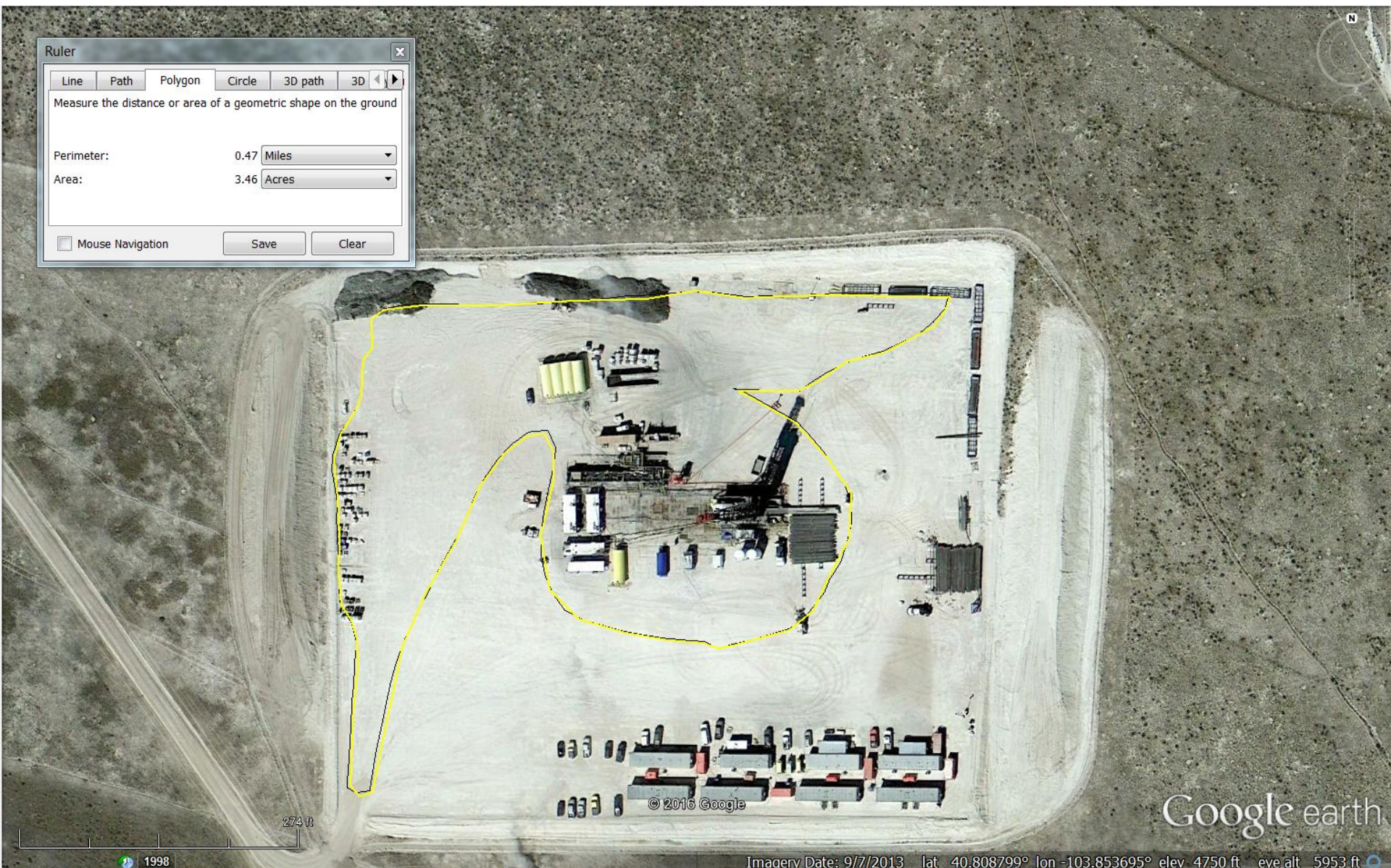
Figure 17: 2013 Google Earth imagery. Yellow polygon represents the current perimeter of the production area (confirmed by GPS on the ground). Current size of production area is 3.46 acres.