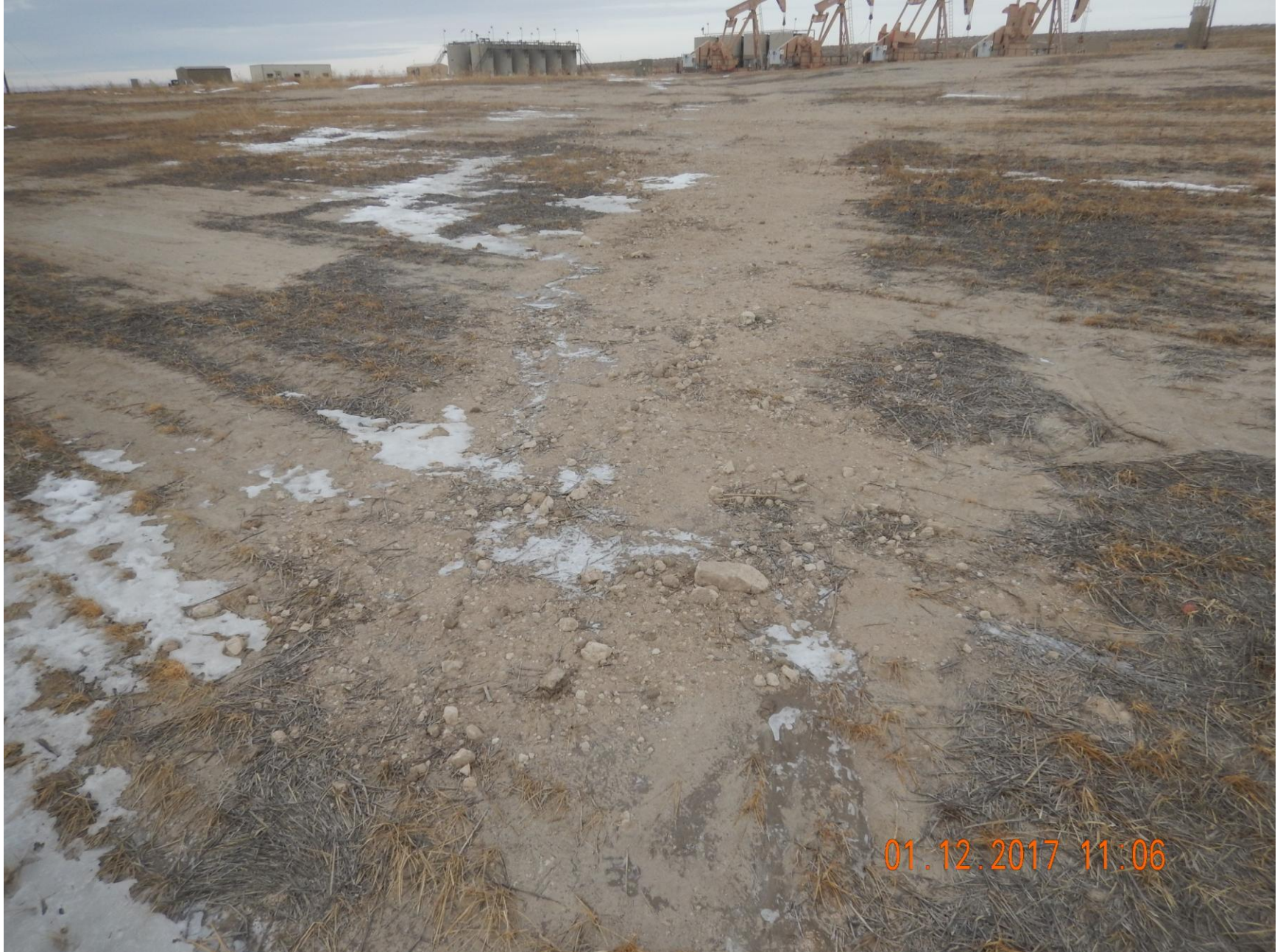
Figure 4: Photo taken from the south end of the location, facing north. Photo shows low point on the south end designed to allow stormwater to travel off location to ditch. Note sediment deposits from stormwater erosion.