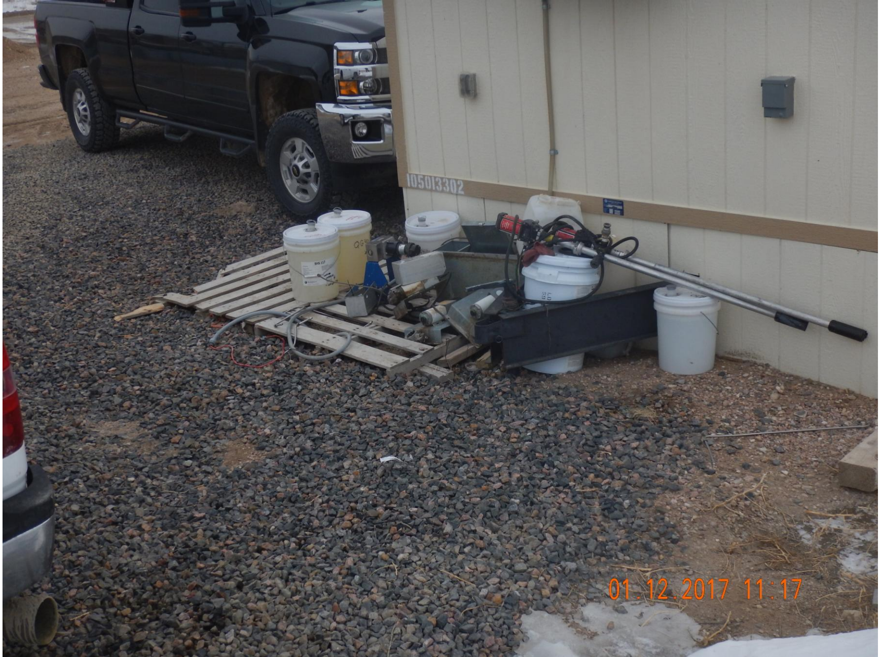
Figure 13: Photo taken from the west end of the location. Photo shows trash, debris and equipment being stored behind buildings on the west end of the location and need to be removed.