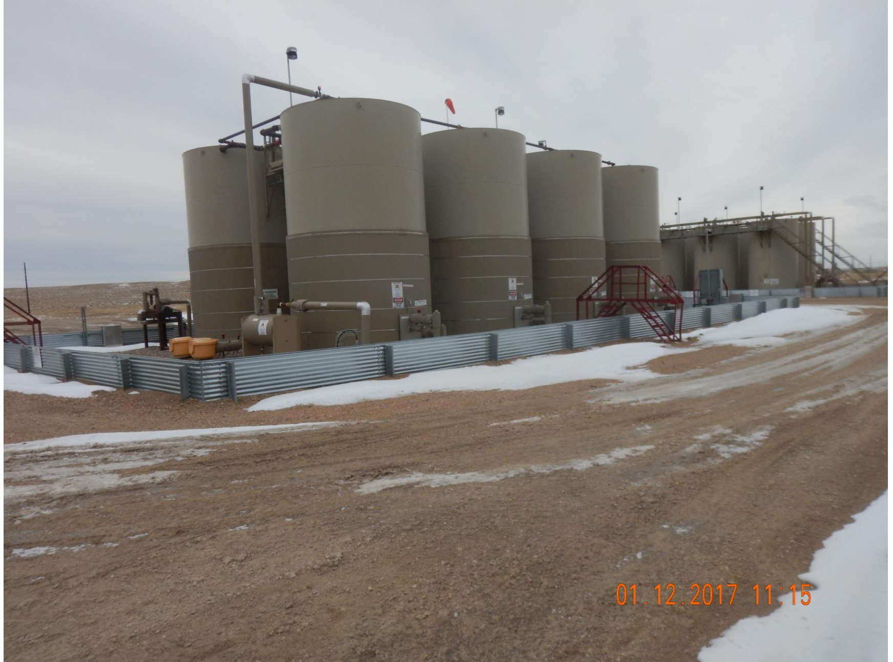
Figure 11: Photo taken from the north end of the location, facing southwest. Photo shows 8, 400 bbl produced water tanks.