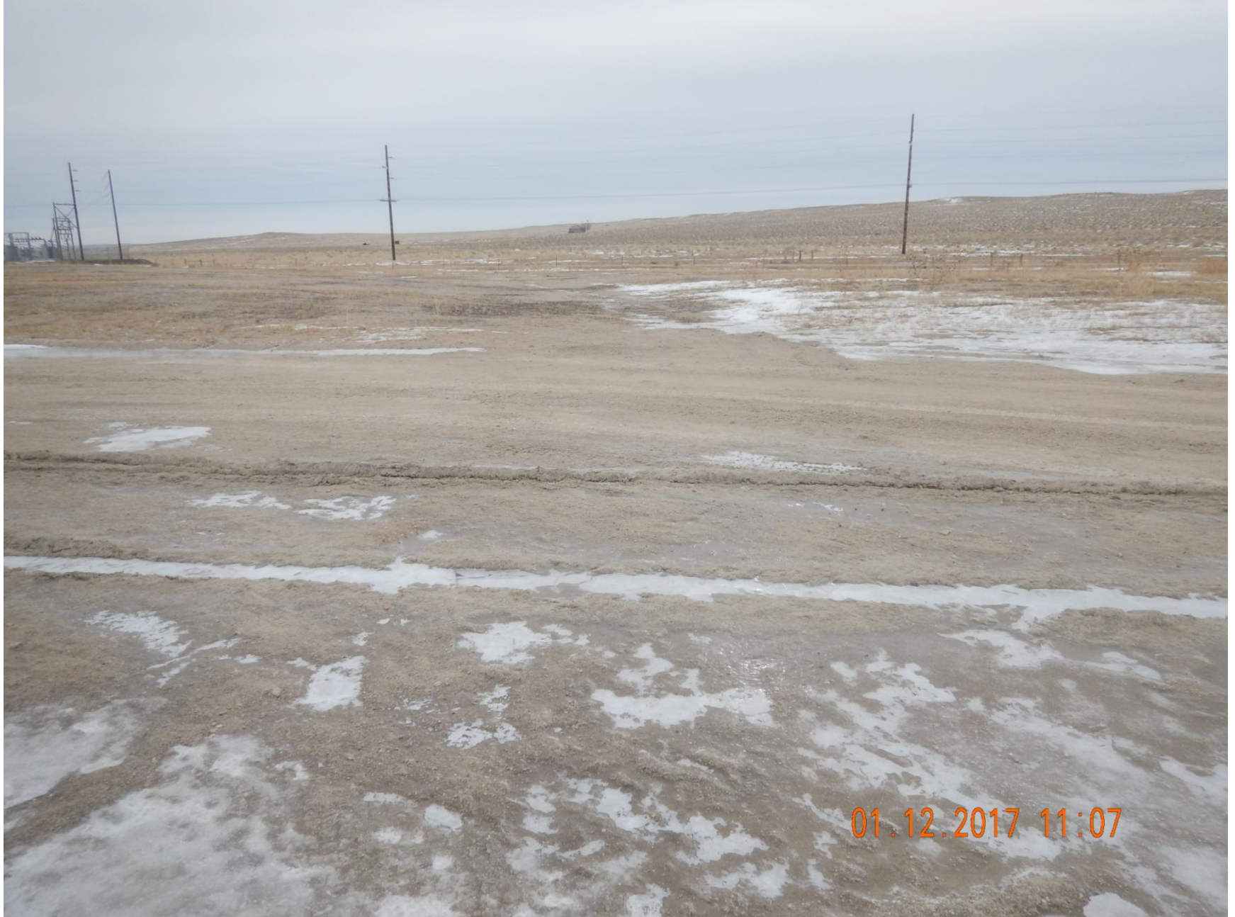
Figure 5: Photo taken from the south end of the location, facing south. Photo shows low point in interim left as a stormwater outlet from the production area.