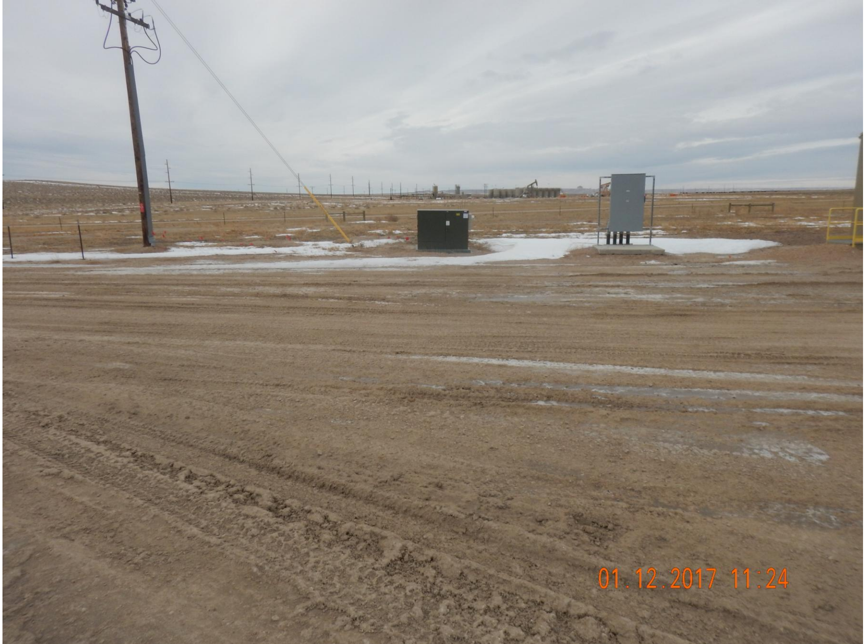
Figure 16: Photo taken from the southwest end of the location, facing west. Photo shows electrical equipment on the location