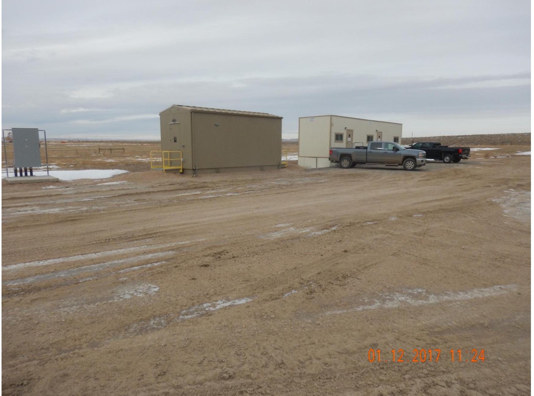
Figure 15: Photo taken from the west end of the location, west northwest. Photo shows building and facilities on location.