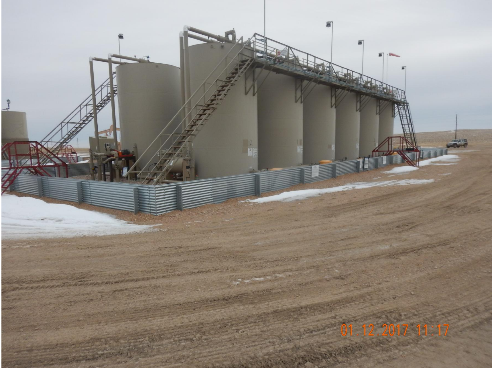
Figure 12: Photo taken from the north end of the location, facing south. Photo shows 12, 400 bbl crude oil tanks.