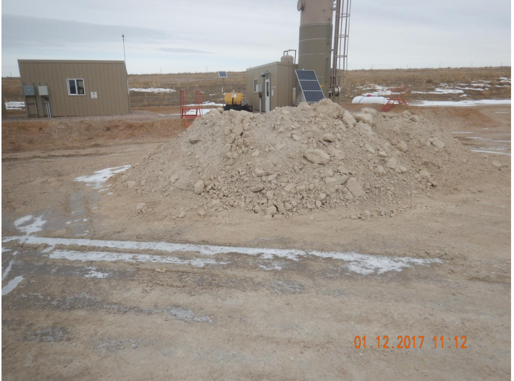
Figure 9: Photo taken from the northend of the location, facing north. Photo shows unlabeled soil stockpile on location. No stormwater BMPs in place.