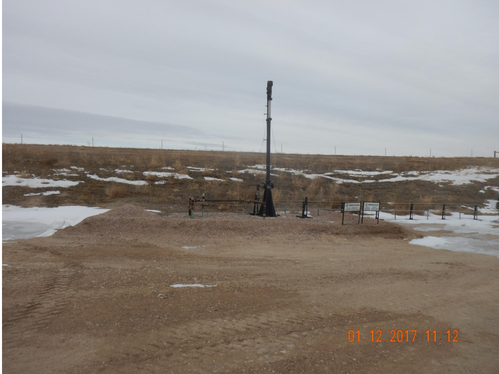
Figure 10: Photo taken from the northeast end of the production area, facing north. Photo shows field flare.