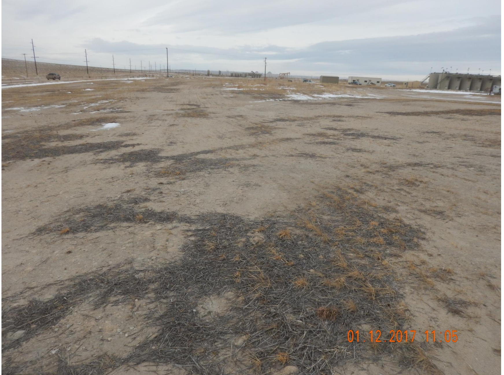
Figure 1: Photo taken from the south end of the location, facing west. Photo shows interim and production areas.