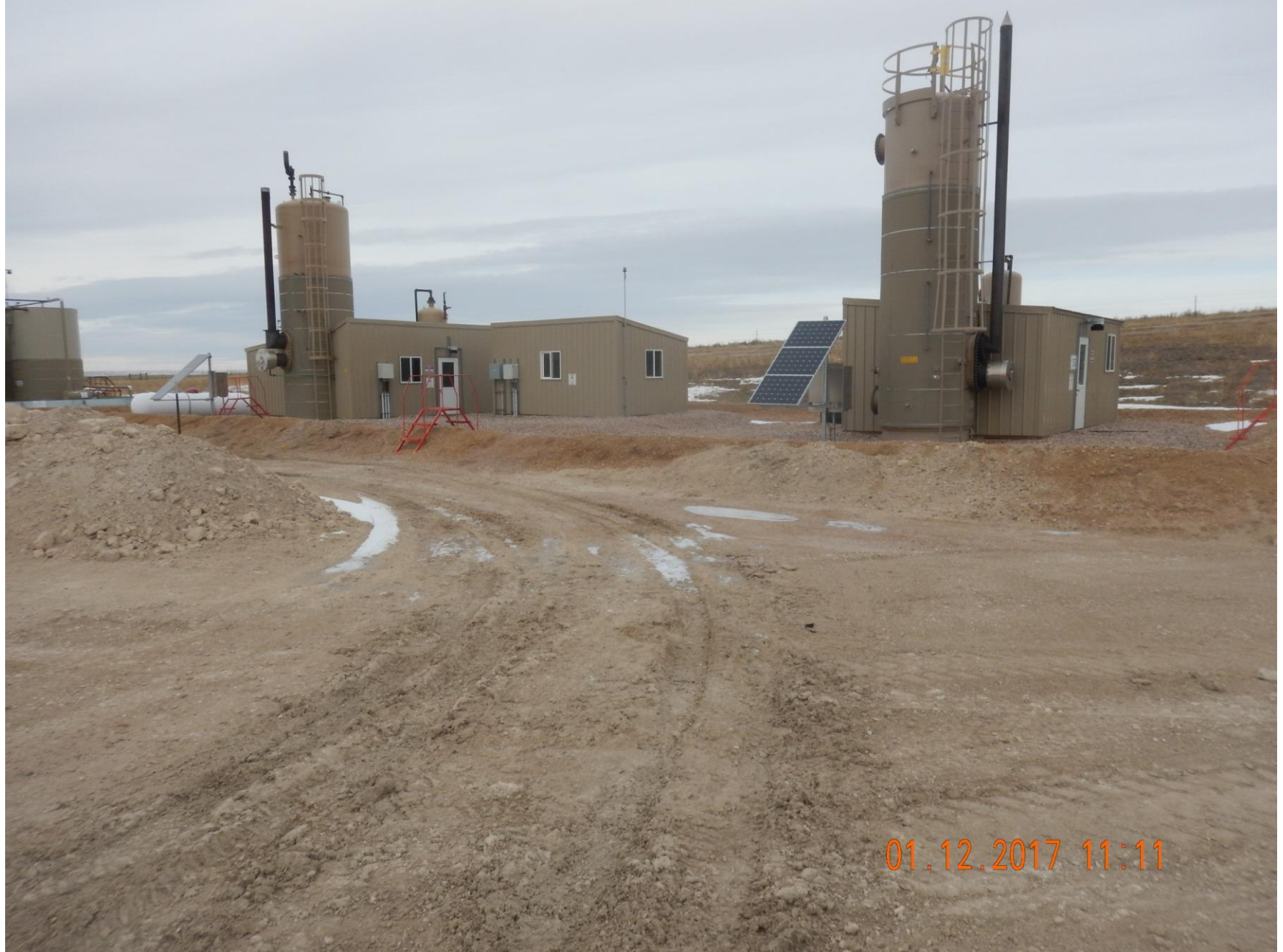
Figure 8: Photo taken from the north end of the location, facing north. Photo shows two vertical heater treaters and vertical gas separators.