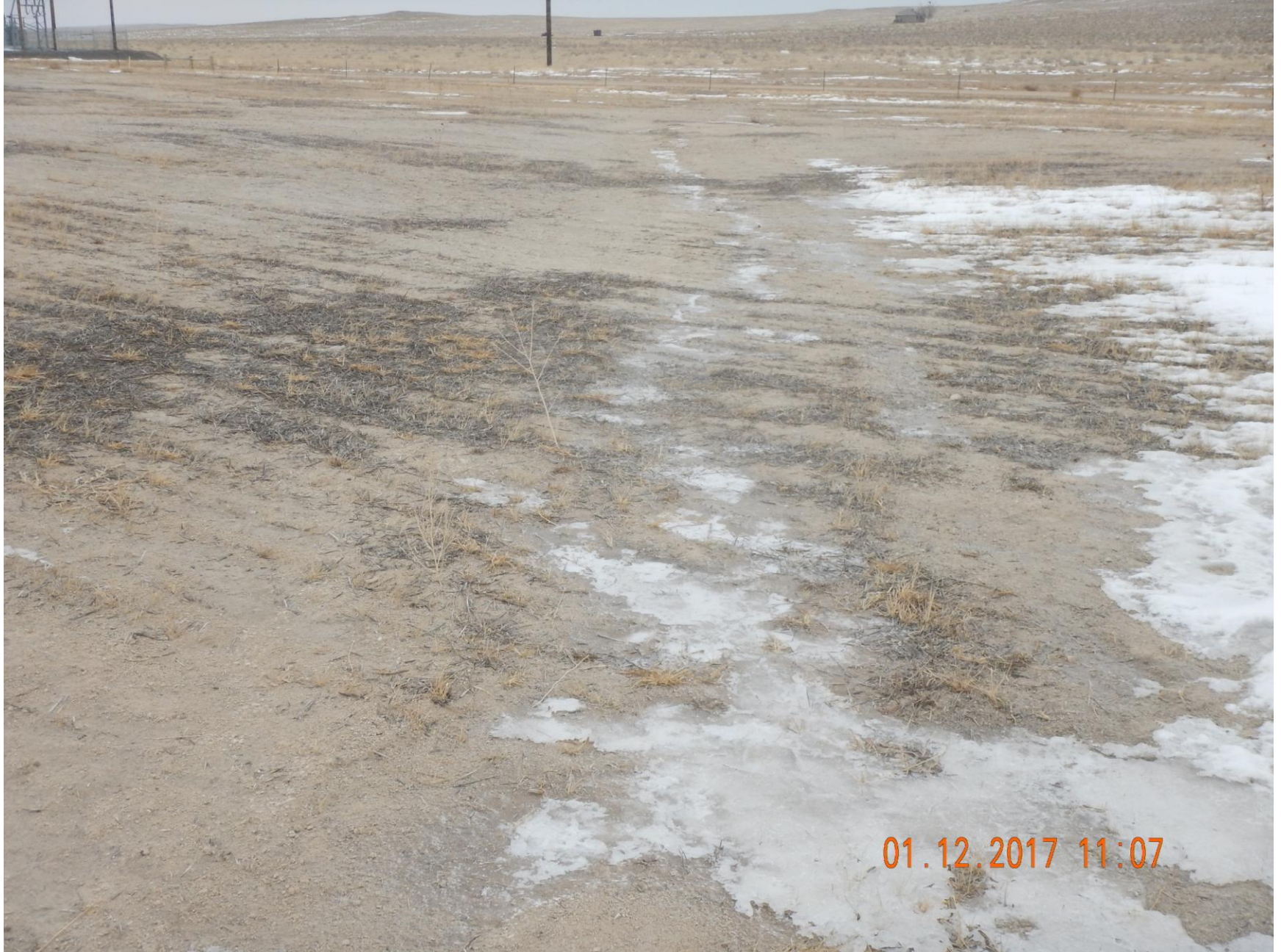
Figure 6: Photo taken from the south end of the interim area. Facing south. Photo shows stormwater erosion concerns forming on the interim area.