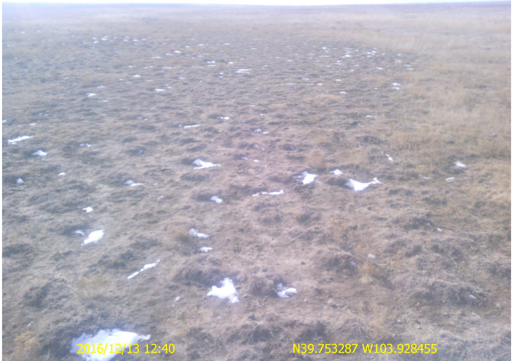
Figure 2: Photo taken from the north end of the location, facing southwest. Photo shows location has not achieved uniform vegetative cover.