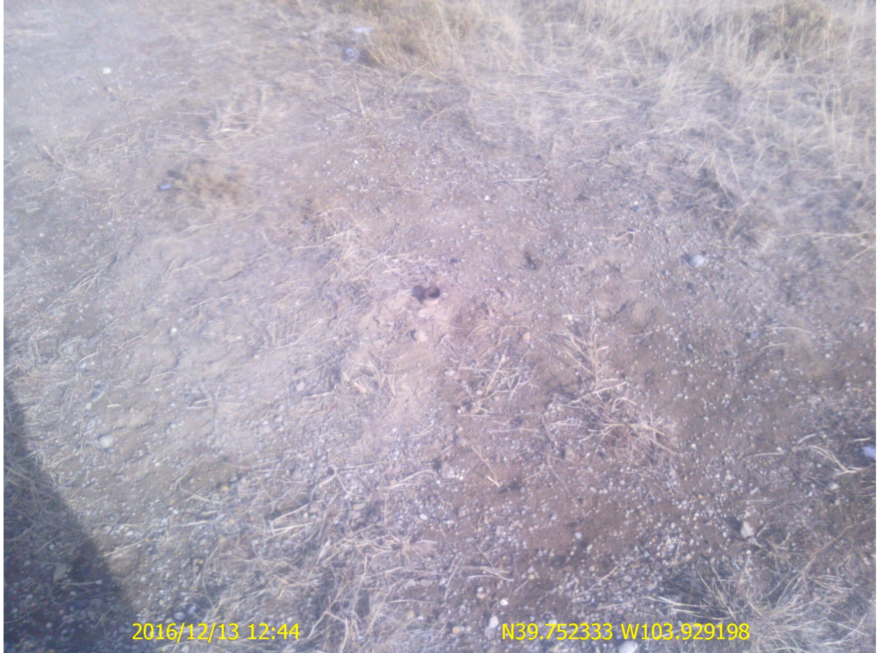
Figure 7: Photo taken from the west end of the location. Photo shows exposed pipe remaining in the ground