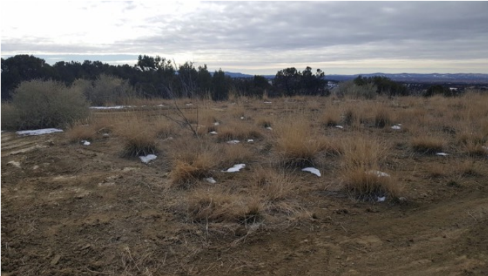
Completed work description