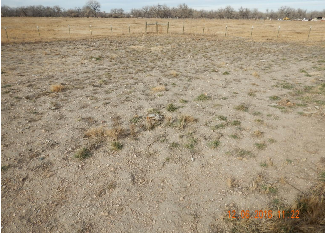
Photo 6. Photo taken from the tank battery location (i.e., fenced in location), facing Northwest. Location IN-PROCESS. A seeding attempt is evident but location lacks uniform vegetative growth that is not reflective of reference areas.