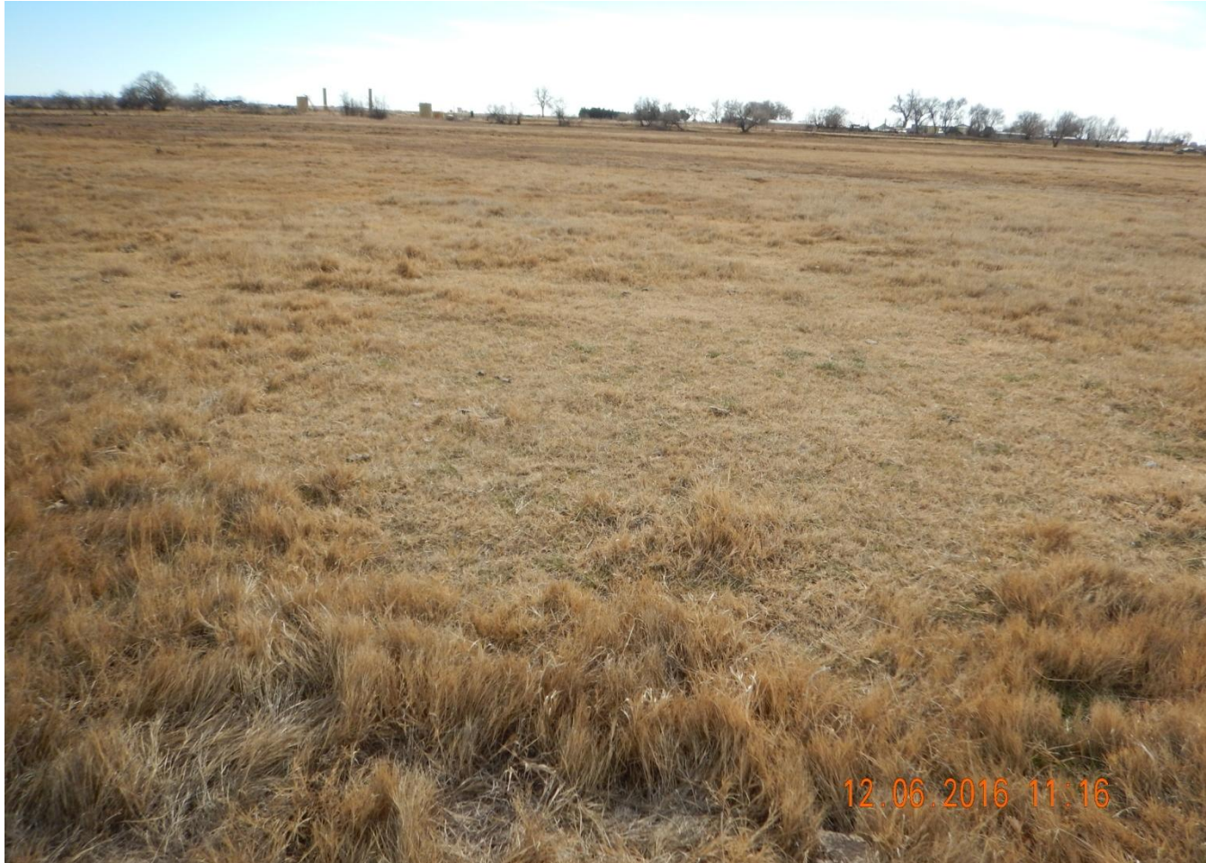
Photo 5. Reference photo taken east of location, facing East. Location appears to be reflective of the reference areas.