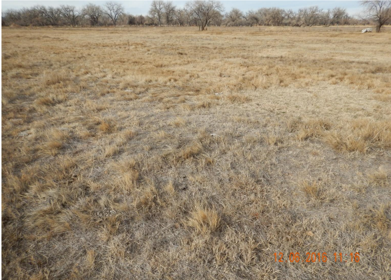
Photo 1. Photo taken from center of location, facing West. No evidence of disturbance. Uniform vegetative growth throughout location.