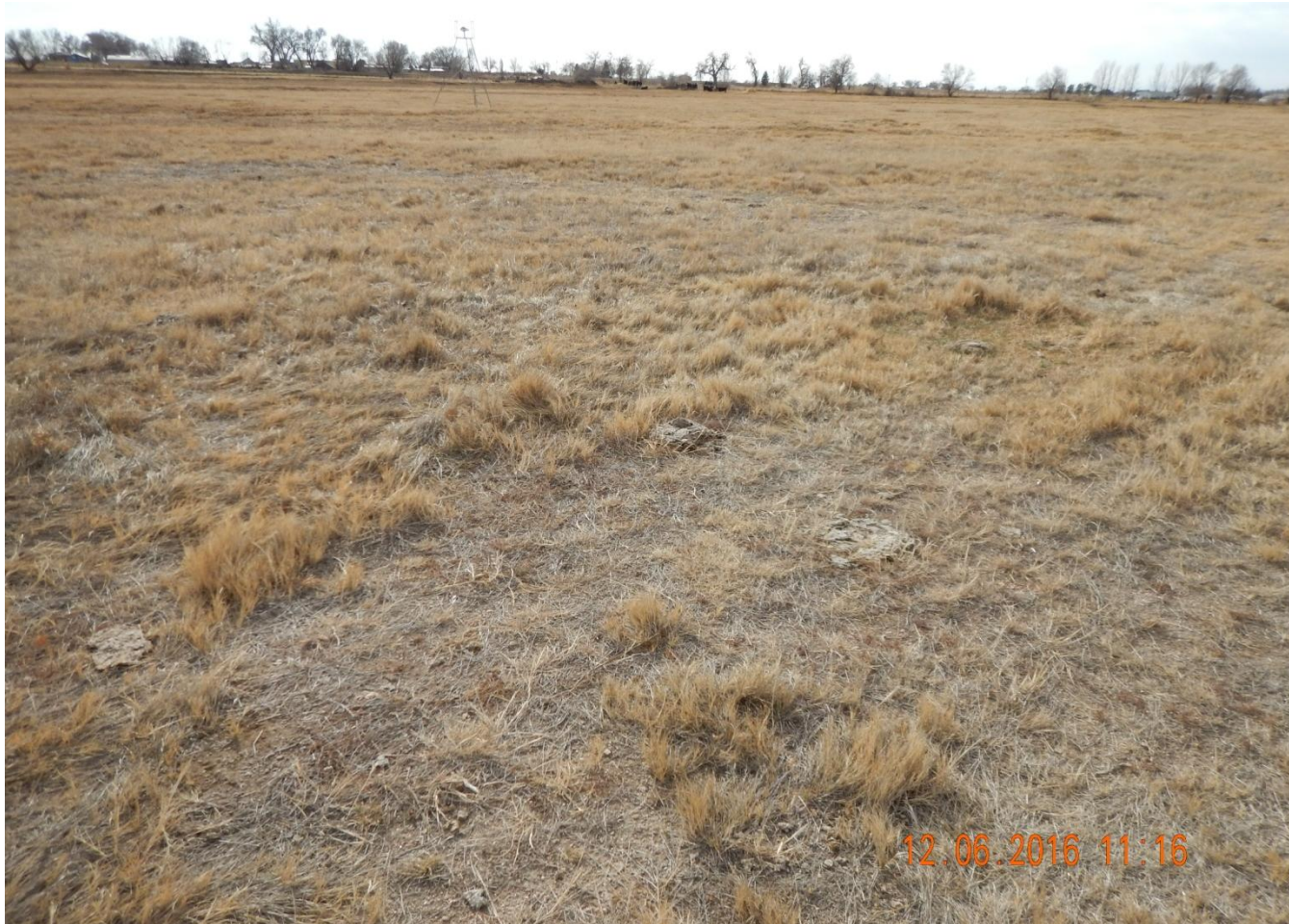
Photo 4. Photo taken from center of location, facing South. No evidence of disturbance. Uniform vegetative growth throughout location.