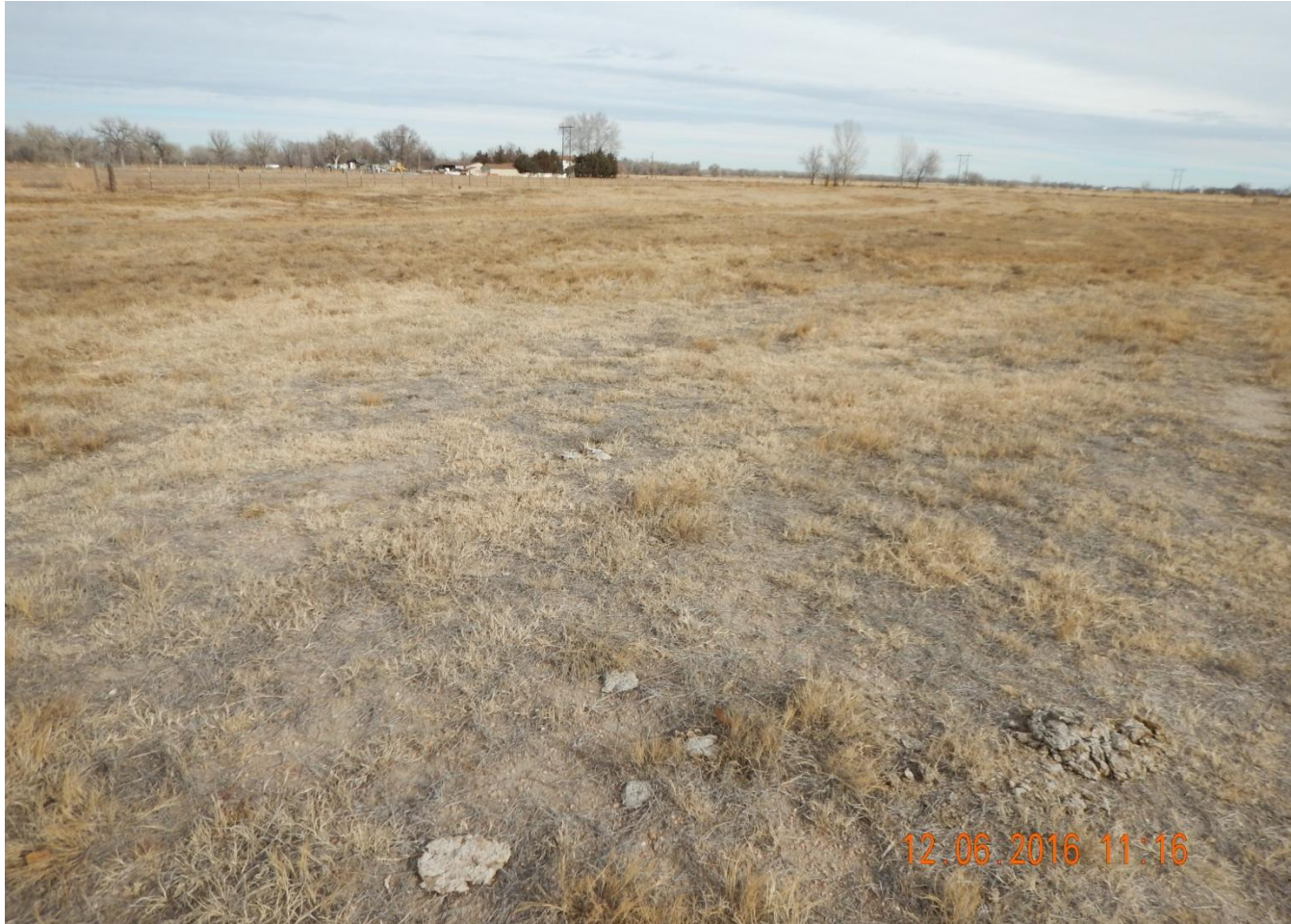
Photo 2. Photo taken from center of location, facing North. No evidence of disturbance. Uniform vegetative growth throughout location.