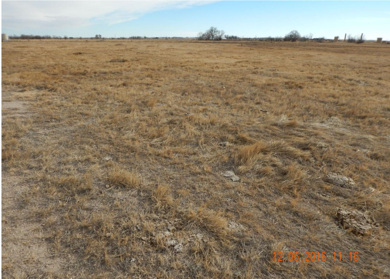
Photo 3. Photo taken from center of location, facing East. No evidence of disturbance. Uniform vegetative growth throughout location.