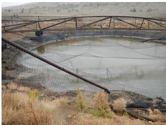
Pit 1, Facility 112265.