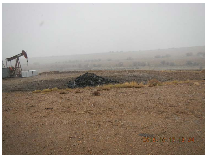
Former treater pit liner stockpiled.