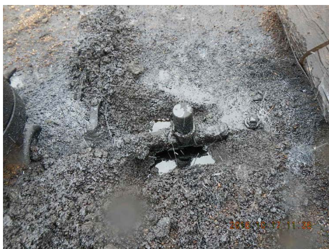
057-06062 possible bull plug leak.