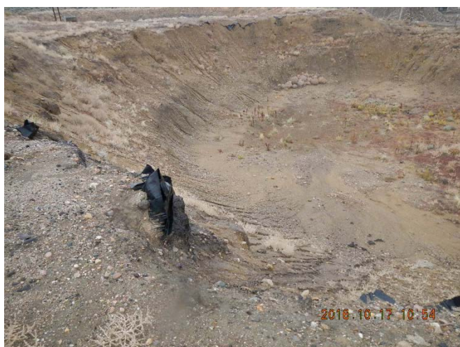
Overflow Treater Pit, Facility 115241.