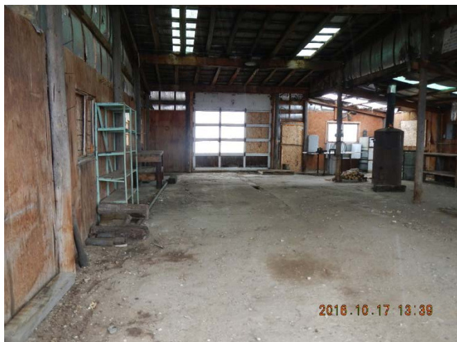
Interior of barn/garage.

October 17, 2016 COGCC Environmental Field Inspection of CM Productions LLC Margaret Spaulding 2 (Location ID: 324599, API 057-06273, 057-06062, 057-06080)