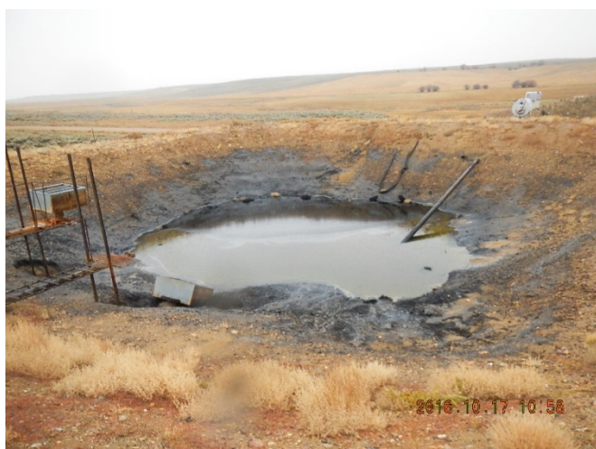
Pit 2, Facility 112267.