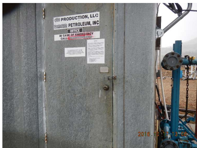
Office with "CM" and "Proven" and emergency contact number removed from signs on the office door. Note: Lock removed by others.