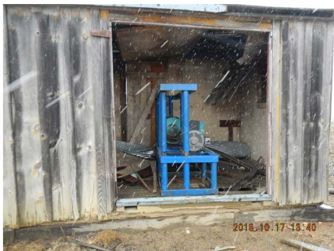
Equipment storage near barn/garage.