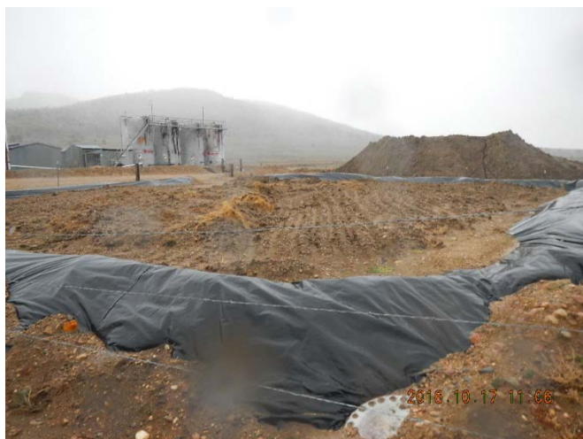
Land Treatment area looking east