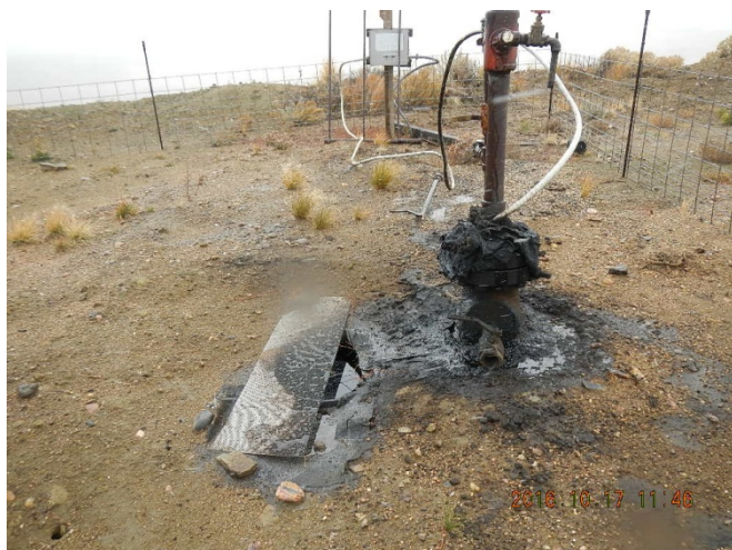
057-06080 Oil with sump and absorbent boom wrapped around well head.

October 17, 2016 COGCC Environmental Field Inspection of CM Productions LLC Margaret Spaulding 2 (Location ID: 324599, API 057-06273, 057-06062, 057-06080)