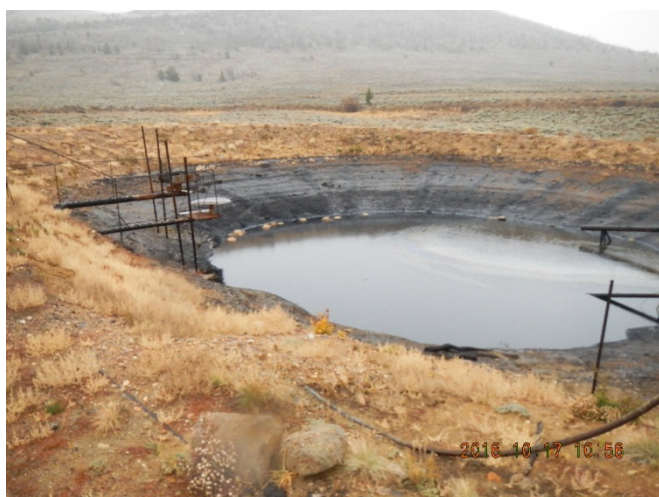
Pit 2, Facility 112266.