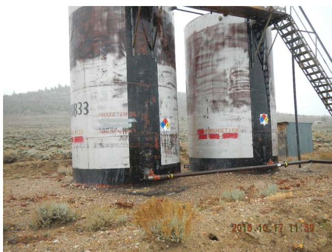
057-06021 Noffinger 1-C tank battery.

Tank # 4, #3, and #2. Tank #5 right side of photo.