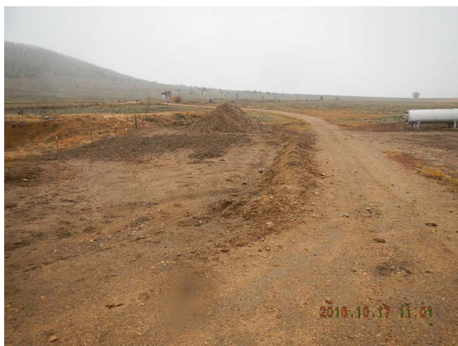
E&P waste stockpile.