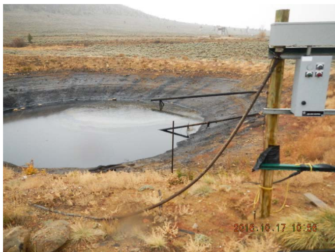
Pit 2, Facility 112266.