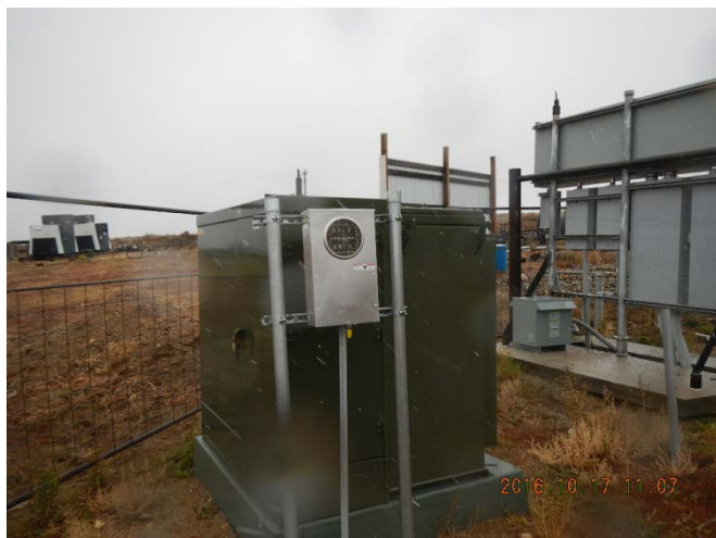
Electrical transformer. Note meter removed.

October 17, 2016 COGCC Environmental Field Inspection of CM Productions LLC Margaret Spaulding 2 (Location ID: 324599, API 057-06273, 057-06062, 057-06080)