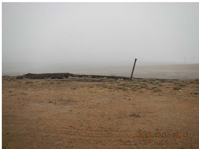
Equipment storage near barn/garage

October 17, 2016 COGCC Environmental Field Inspection of CM Productions LLC Margaret Spaulding 2 (Location ID: 324599, API 057-06273, 057-06062, 057-06080)