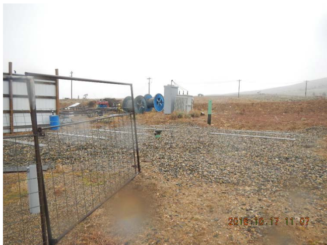
Platform for UIC pump. Note: pipe risers.

October 17, 2016 COGCC Environmental Field Inspection of CM Productions LLC Margaret Spaulding 2 (Location ID: 324599, API 057-06273, 057-06062, 057-06080)