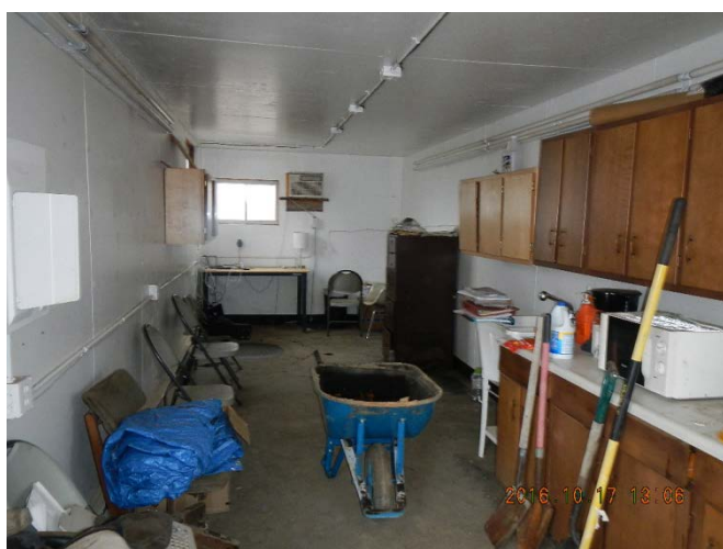
Interior of office.