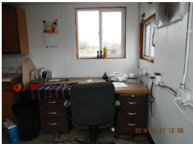
Interior of office.

October 17, 2016 COGCC Environmental Field Inspection of CM Productions LLC Margaret Spaulding 2 (Location ID: 324599, API 057-06273, 057-06062, 057-06080)