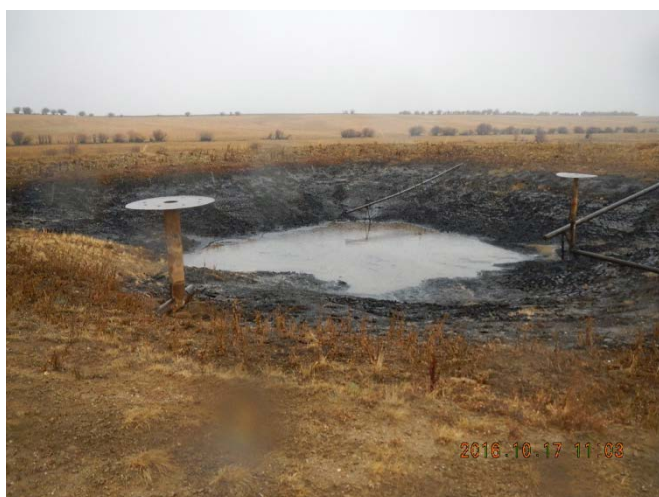
Pit 4, Facility 112268.