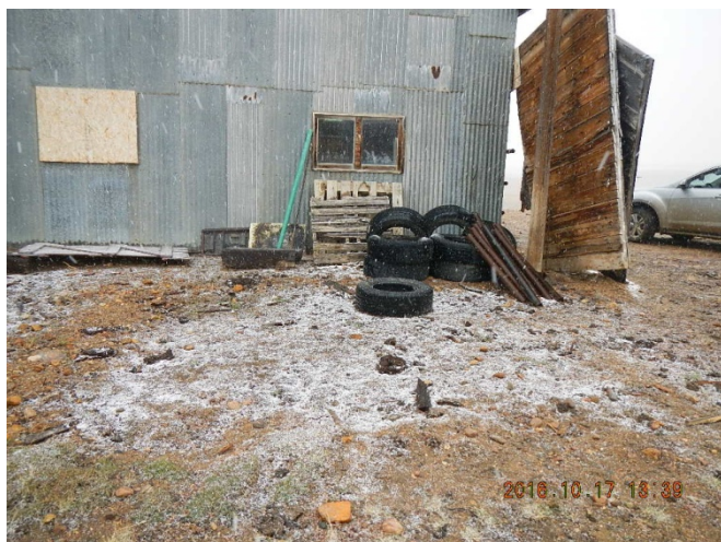
Equipment storage near barn/garage.