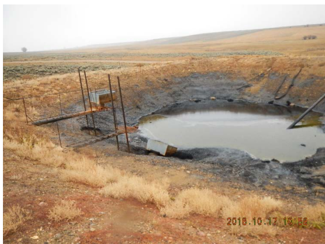
Pit 2, Facility 112267.

October 17, 2016 COGCC Environmental Field Inspection of CM Productions LLC Margaret Spaulding 2 (Location ID: 324599, API 057-06273, 057-06062, 057-06080)