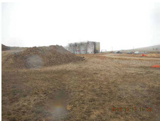
E&P waste stockpile.

October 17, 2016 COGCC Environmental Field Inspection of CM Productions LLC Margaret Spaulding 2 (Location ID: 324599, API 057-06273, 057-06062, 057-06080)