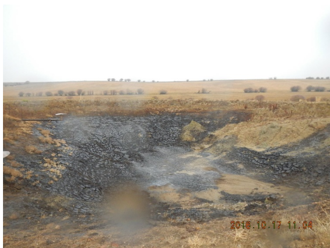
Pit 5, Facility 112269.

October 17, 2016 COGCC Environmental Field Inspection of CM Productions LLC Margaret Spaulding 2 (Location ID: 324599, API 057-06273, 057-06062, 057-06080)