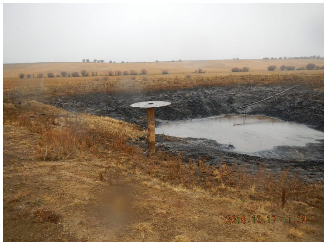
Pit 4, Facility 112268.

October 17, 2016 COGCC Environmental Field Inspection of CM Productions LLC Margaret Spaulding 2 (Location ID: 324599, API 057-06273, 057-06062, 057-06080)