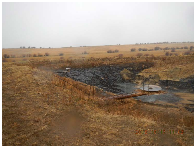
Pit 5, Facility 112269.