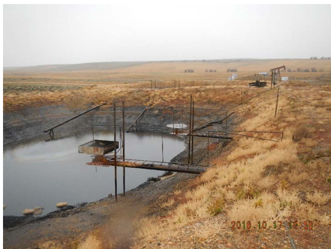
Pit 4, Facility 112267.