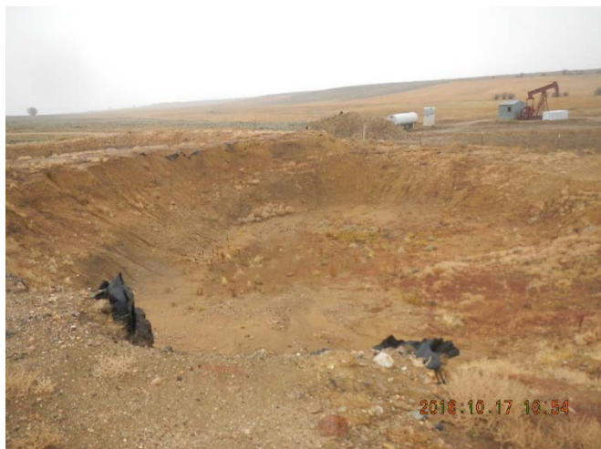
Overflow Treater Pit, Facility 115241.

October 17, 2016 COGCC Environmental Field Inspection of CM Productions LLC Margaret Spaulding 2 (Location ID: 324599, API 057-06273, 057-06062, 057-06080)