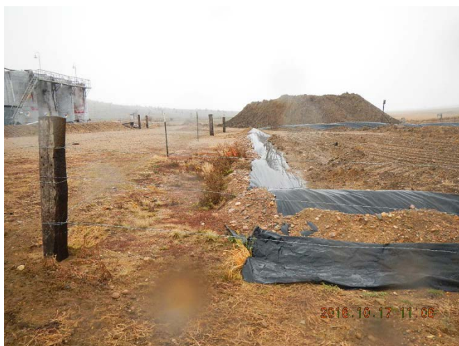
Land Treatment Area.

October 17, 2016 COGCC Environmental Field Inspection of CM Productions LLC Margaret Spaulding 2 (Location ID: 324599, API 057-06273, 057-06062, 057-06080)