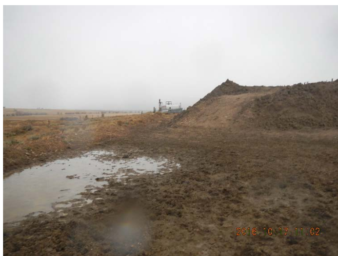
Looking North along west berm and E&P waste stockpile.