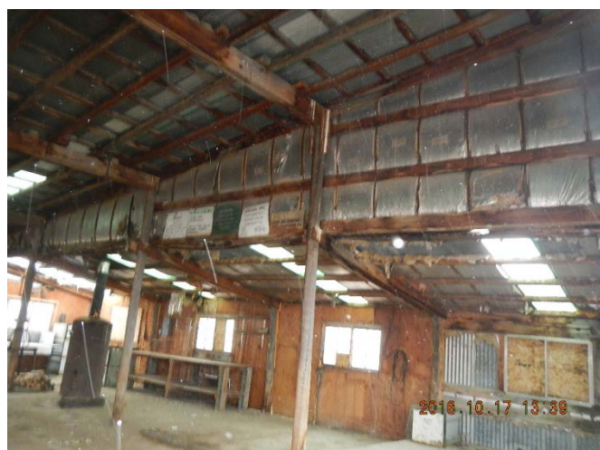
Interior of barn/garage.