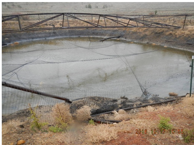
Pit 1, Facility 112265.

October 17, 2016 COGCC Environmental Field Inspection of CM Productions LLC Margaret Spaulding 2 (Location ID: 324599, API 057-06273, 057-06062, 057-06080)