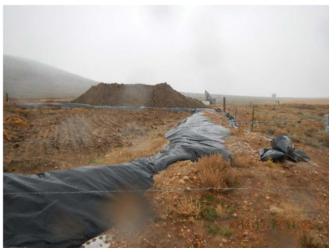
NW Corner of Land Treatment area.