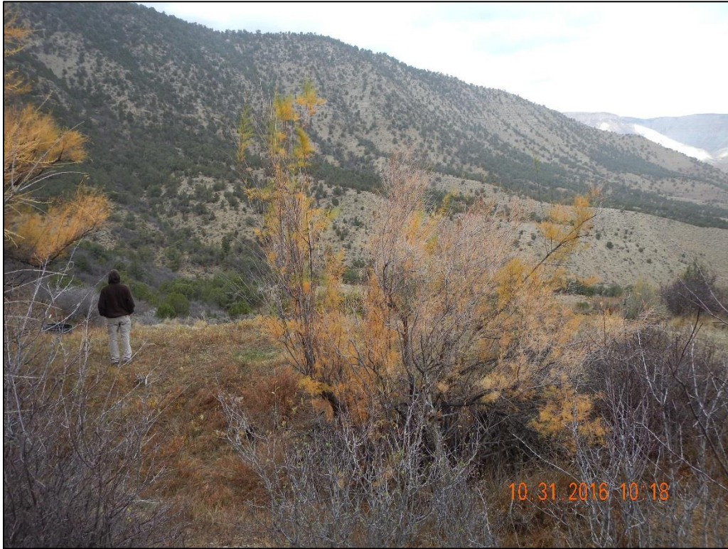
Photo 1. Dry conditions and tamarisk at Callahan Mountain Spring area