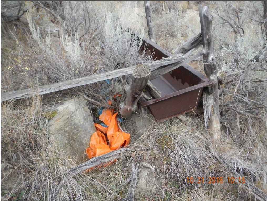
Photo 3. Evidence of stock watering at Callahan Mountain Spring