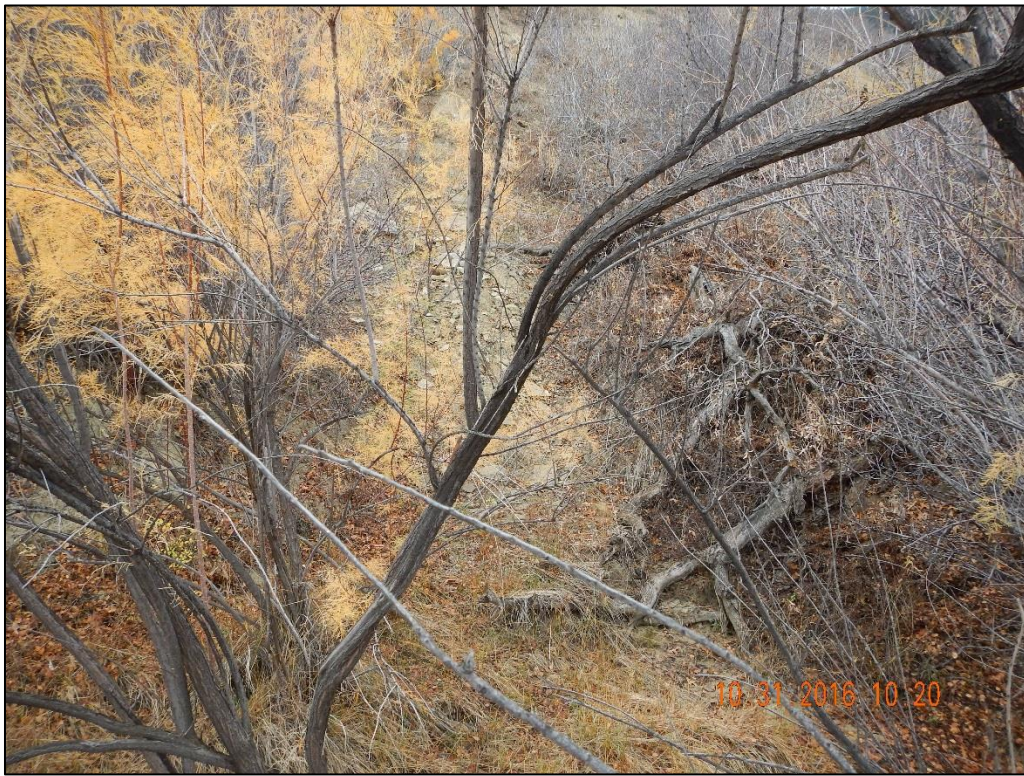
Photo 2. Dry conditions and tamarisk at Callahan Mountain Spring area