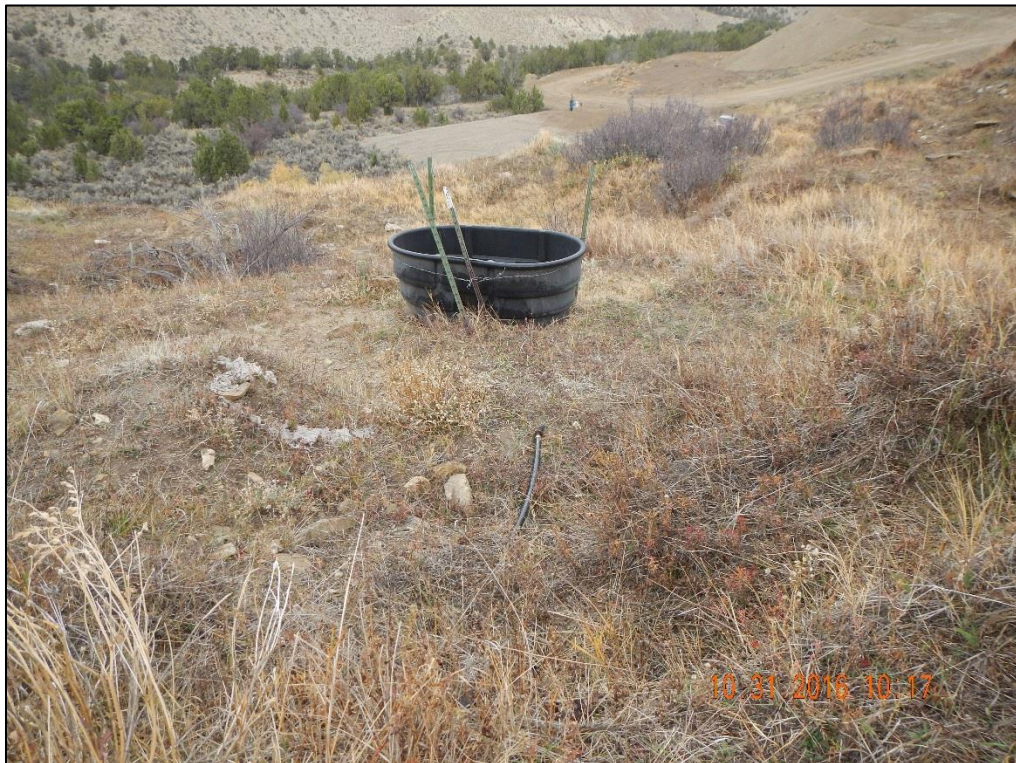
Photo 4. Evidence of stock watering at Callahan Mountain Spring