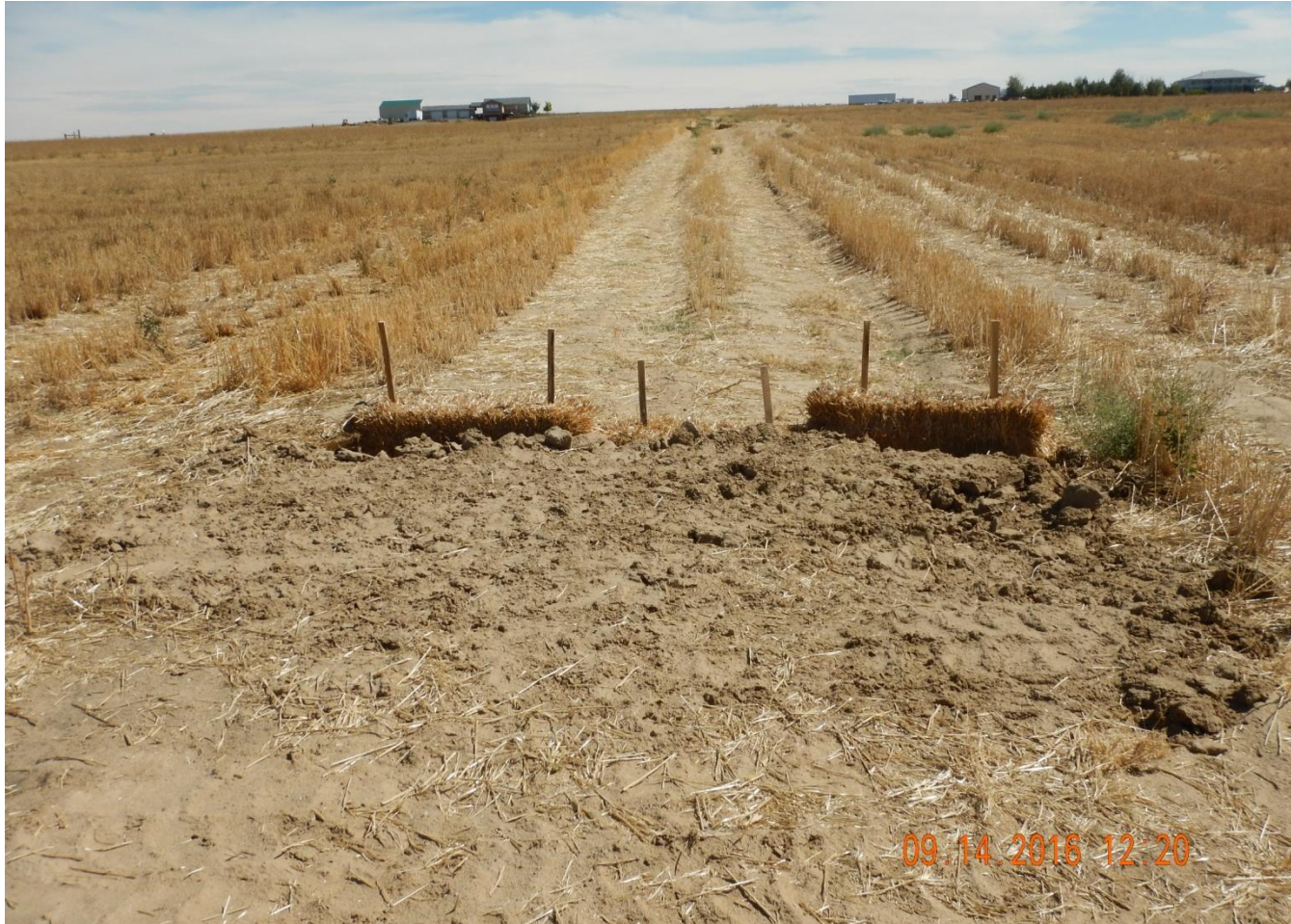
Photo 2. Photo taken east of wellhead along access, facing East, towards the first of two straw bale BMPs installed.