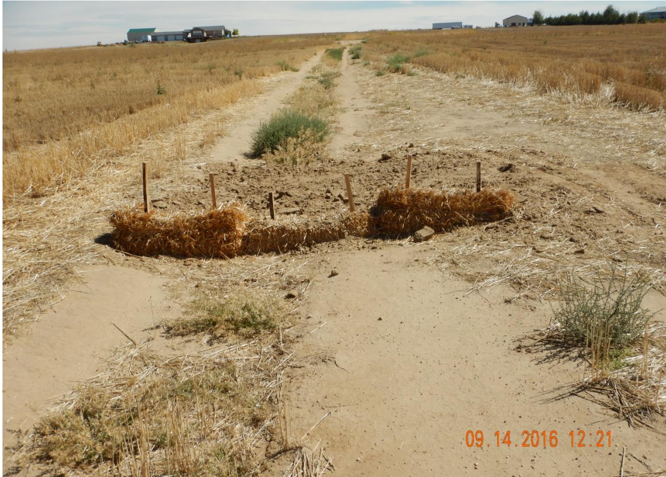
Photo 3. Photo taken east of the last BMP, facing East, towards the second straw bale BMP installed along the access road.