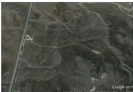
USA 21-6 Well site and Tanks Google Earth.jpg 166K