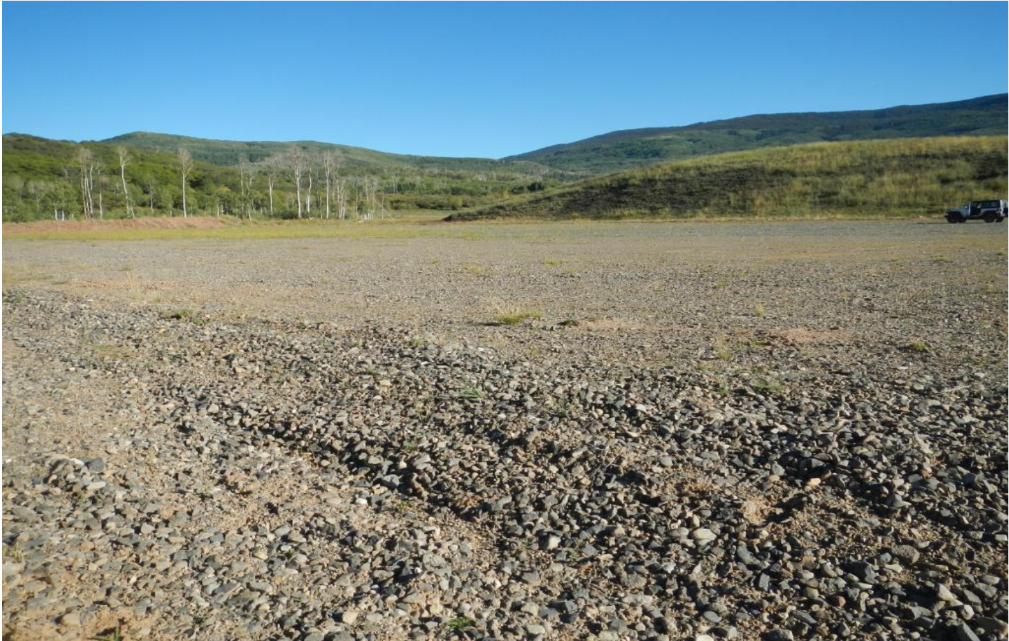
Photo#1: Overview of Location from Entry to SE; APDs were not Drilled.