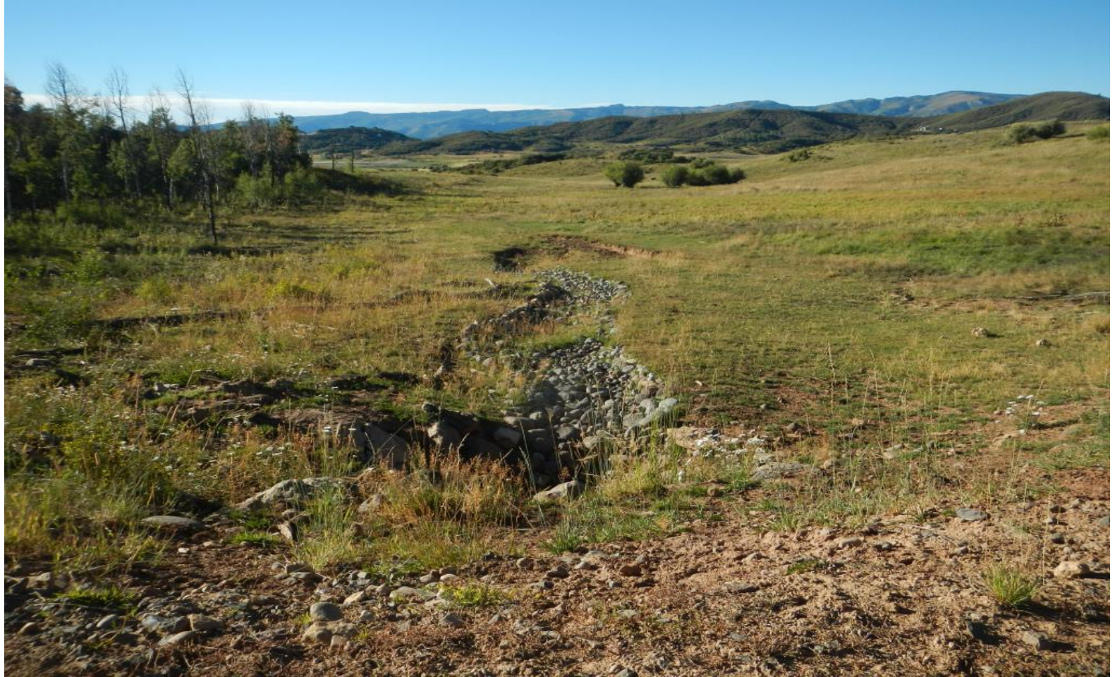
Photo#2: Rocked Drain leading from access Road; neighboring Vega Reservoir in background