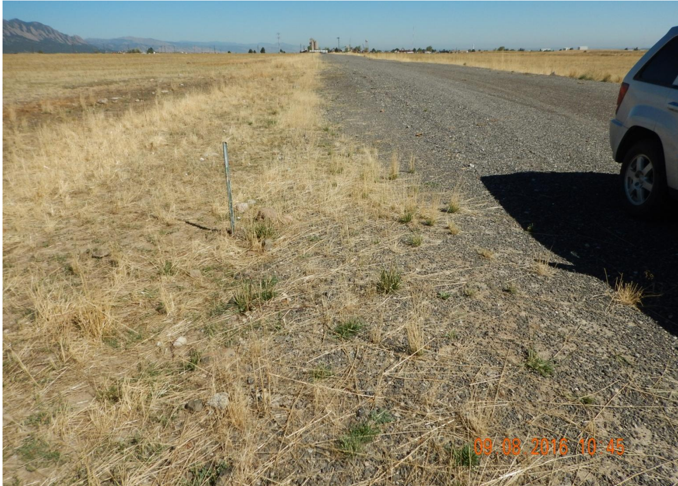
Photo 5. Photo taken from approximate center of location, facing North. Does not appear to have been built based off field observations. Access road is being used by private landowner. Access road has been graveled and stabilized. No erosion was observed along the access road.

COLORADO Oil & Gas Conservation Commission Department of Natural Resources