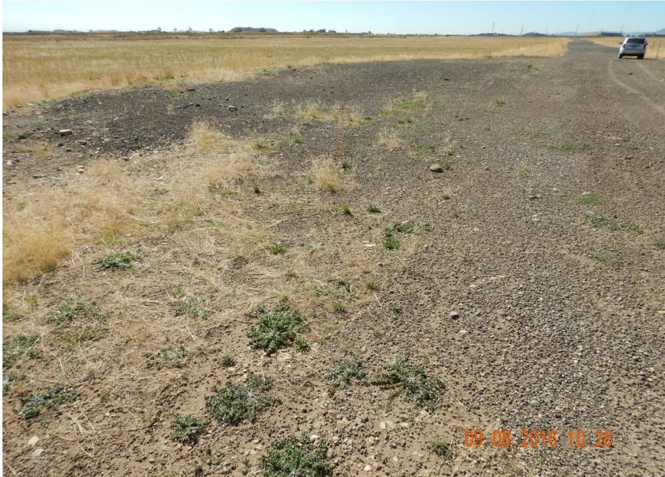
Photo 4. Photo taken from the eastern location, facing South. Evidence of location remains- location has not been re-contoured or reduced in size.