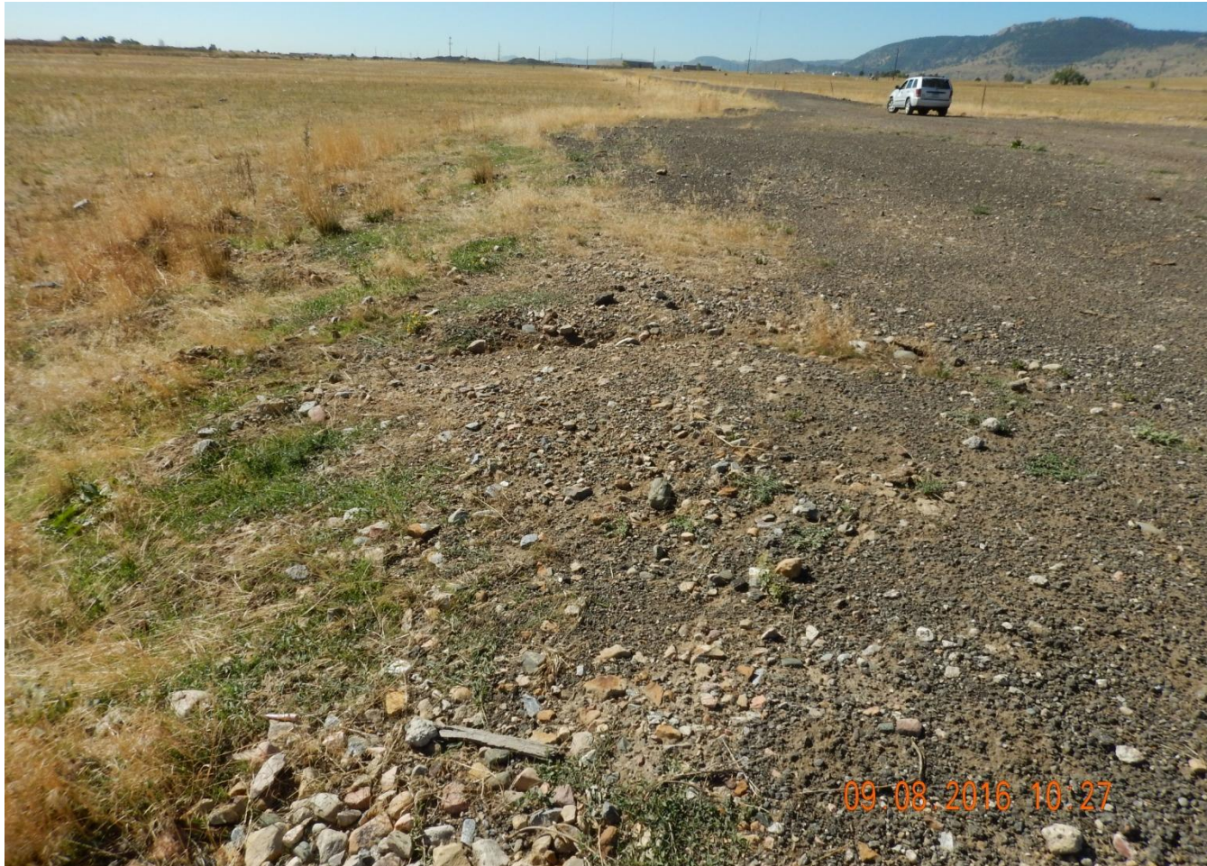
Photo 5. Photo taken from the eastern location, facing South. Evidence of location remains- location has not been re-contoured or reduced in size.

COLORADO Oil & Gas Conservation Commission Department of Natural Resources