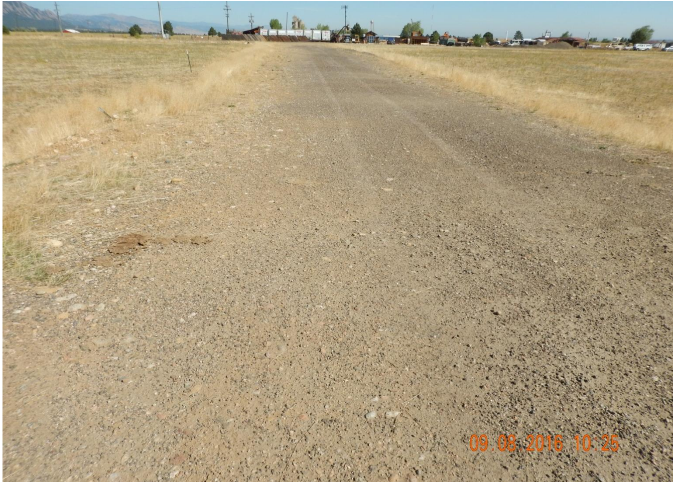
Photo 3. Photo taken from center of location, facing North. Access road, which extends north past the location, has been gravelled and stabilized. Access road is being used by private landowner. No erosion was observed along the access road.

COLORADO Oil & Gas Conservation Commission Department of Natural Resources