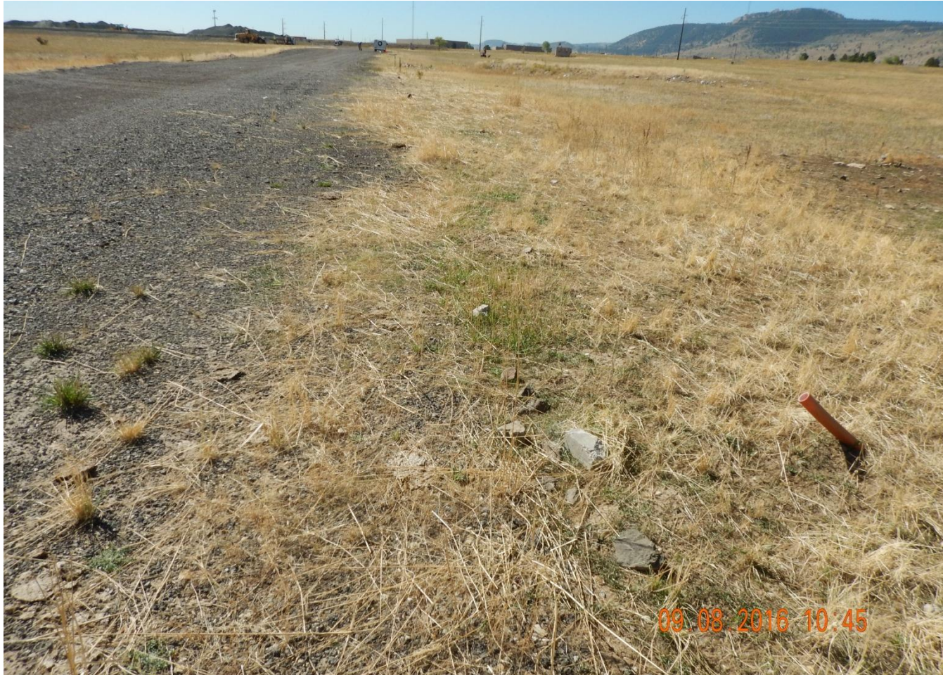
Photo 6. Photo taken from approximate center of location, facing South. Does not appear to have been built based off field observations. Access road is being used by private landowner. Access road has been graveled and stabilized. No erosion was observed along the access road.

COLORADO Oil & Gas Conservation Commission Department of Natural Resources