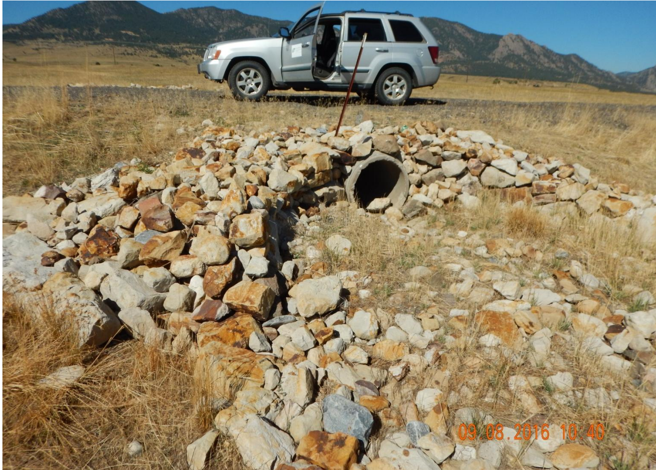
Photo 6. Photo taken along the eastern access road, facing West. Culvert was installed along a drainage point to control stormwater. Culvert is armored at both the inlet and outlet drainage areas.

COLORADO Oil & Gas Conservation Commission Department of Natural Resources