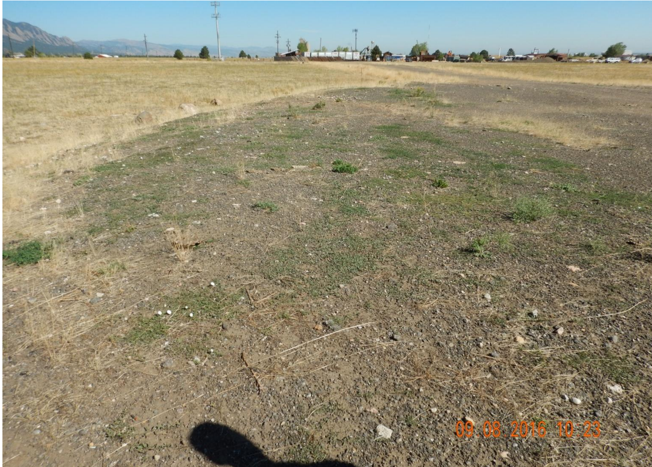
Photo 2. Photo taken from the western location, facing North. Evidence of location remains- location has not been re-contoured or reduced in size.