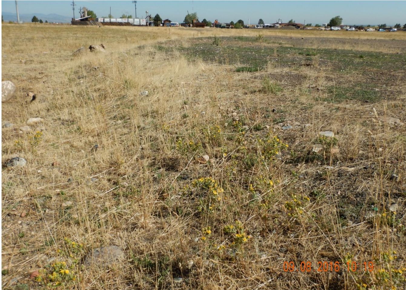
Photo 1. Photo taken from the western location, facing North. Evidence of location remains- location has not been re-contoured or reduced in size.

COLORADO Oil & Gas Conservation Commission Department of Natural Resources