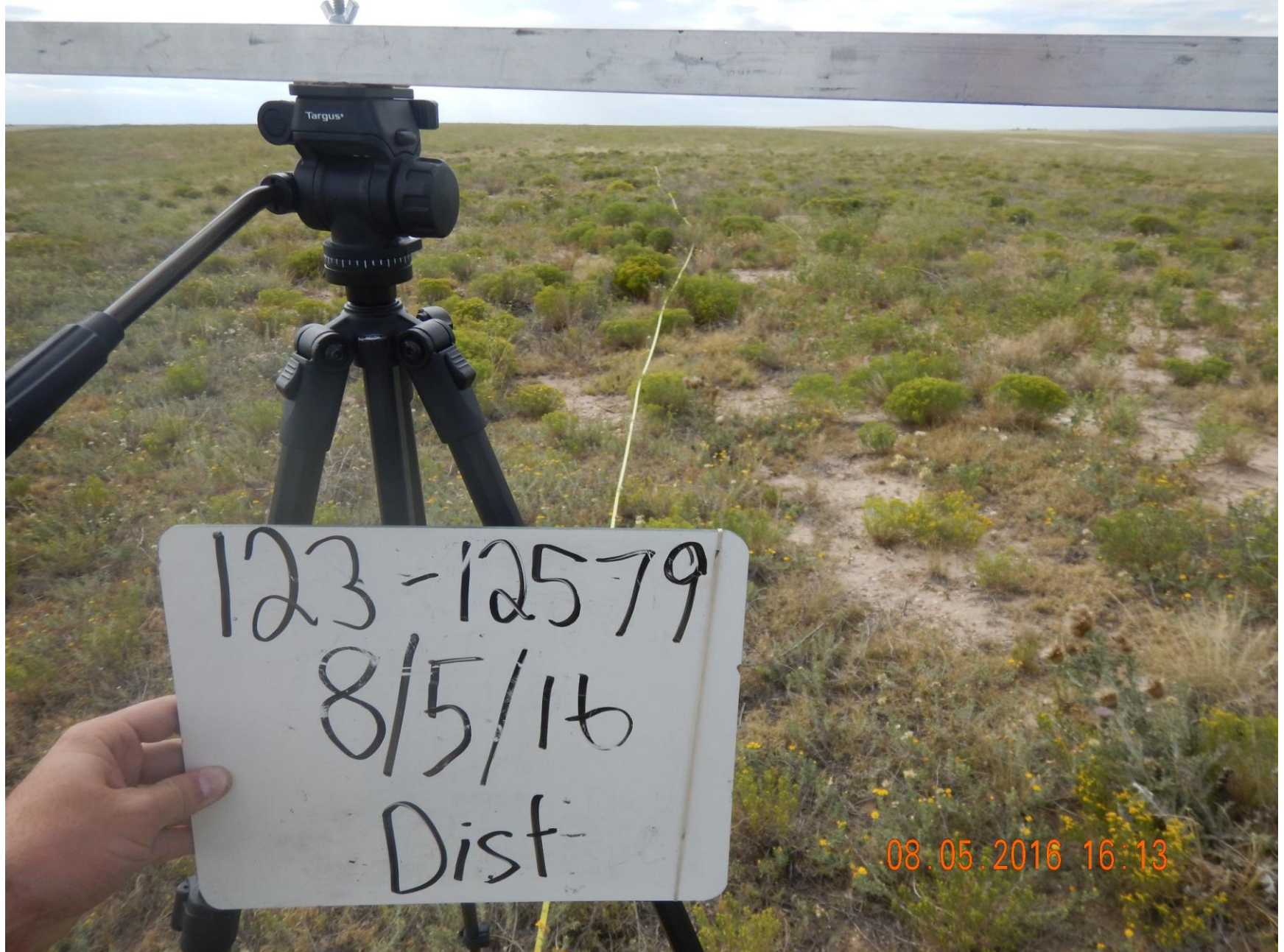
Figure 2: Photo of the starting point for the disturbance transect, facing west.