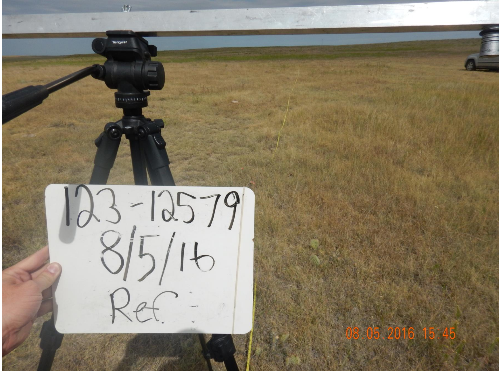
Figure 7: Photo of the starting point for the reference transect, facing east