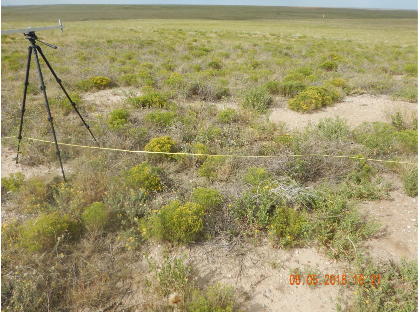
Figure 4: Photo of vegetation at the 50th point of the disturbance transect, facing north.