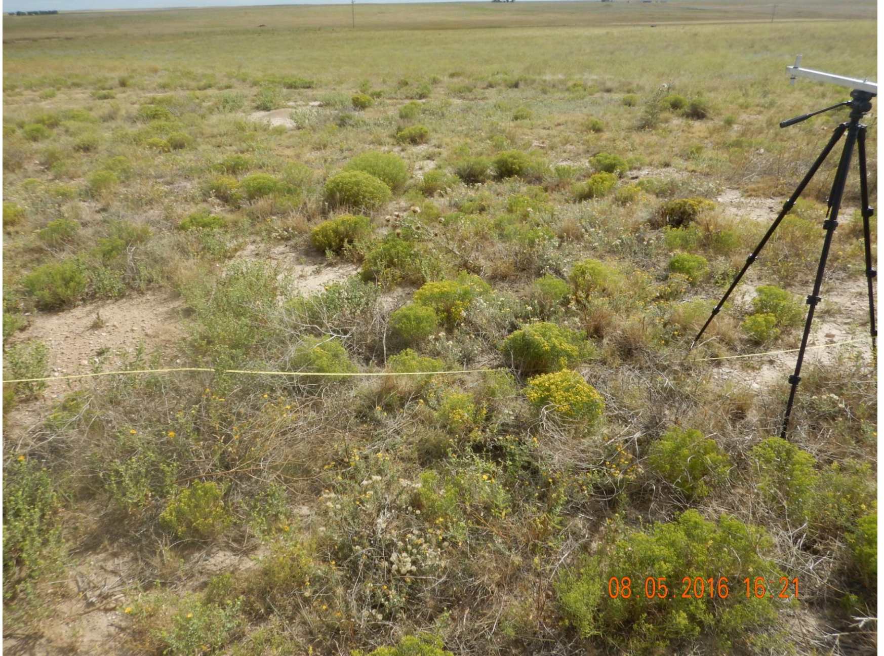
Figure 3: Photo of vegetation at the 50th point of the disturbance transect, facing south.