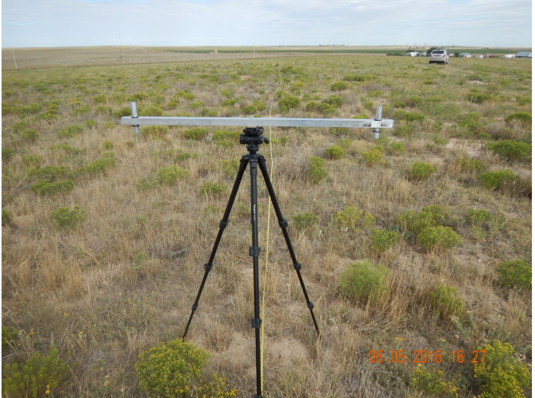
Figure 6: Photo of the end point for the disturbance transect, facing east.