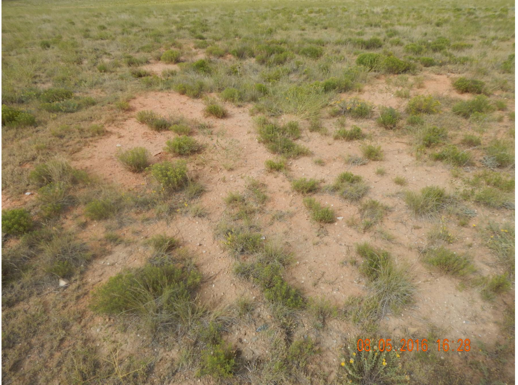
Figure 12: Red/Discolored soil found on location.