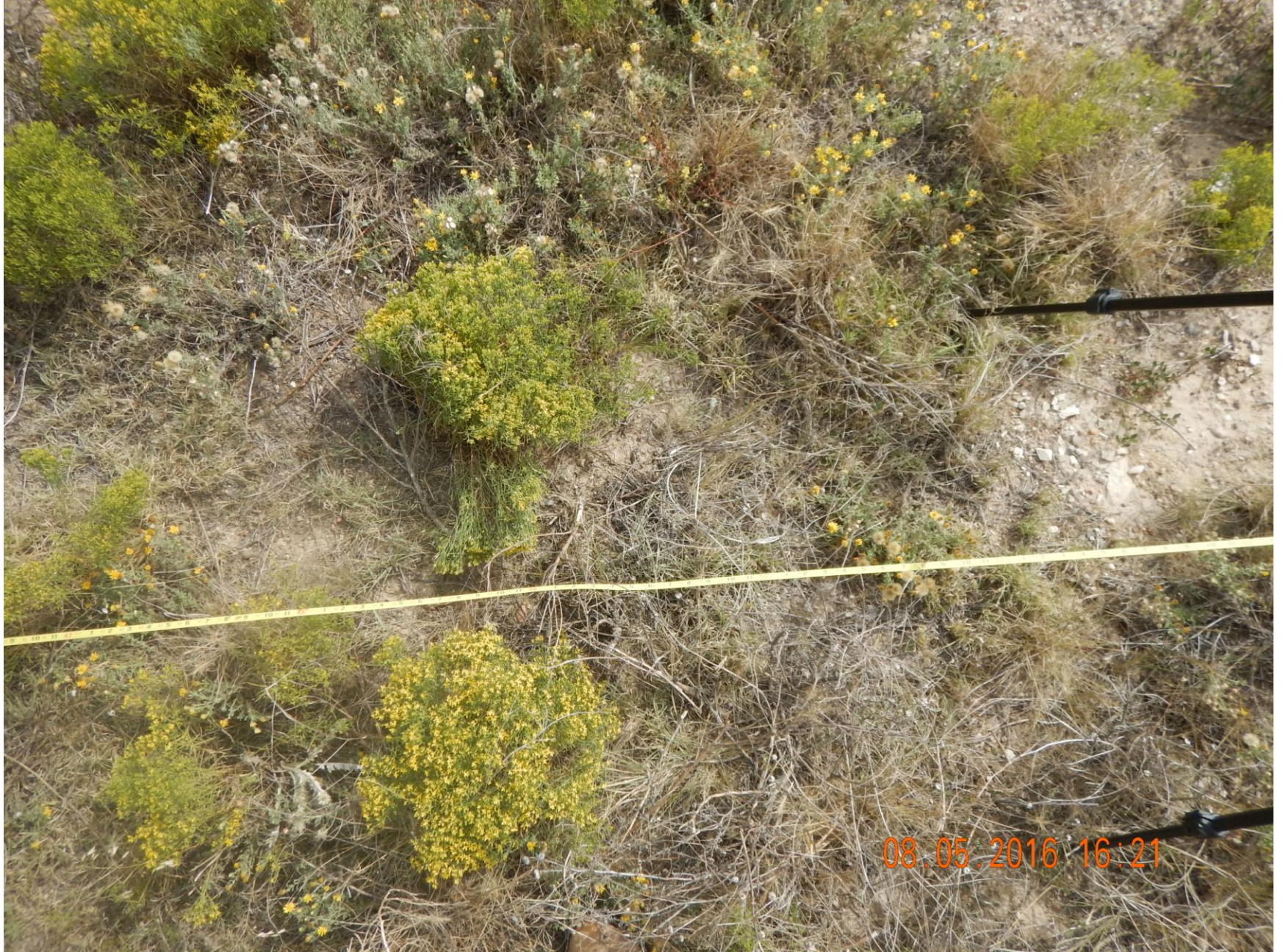
Figure 5: Photo of vegetation at the 50th point of the disturbance transect.