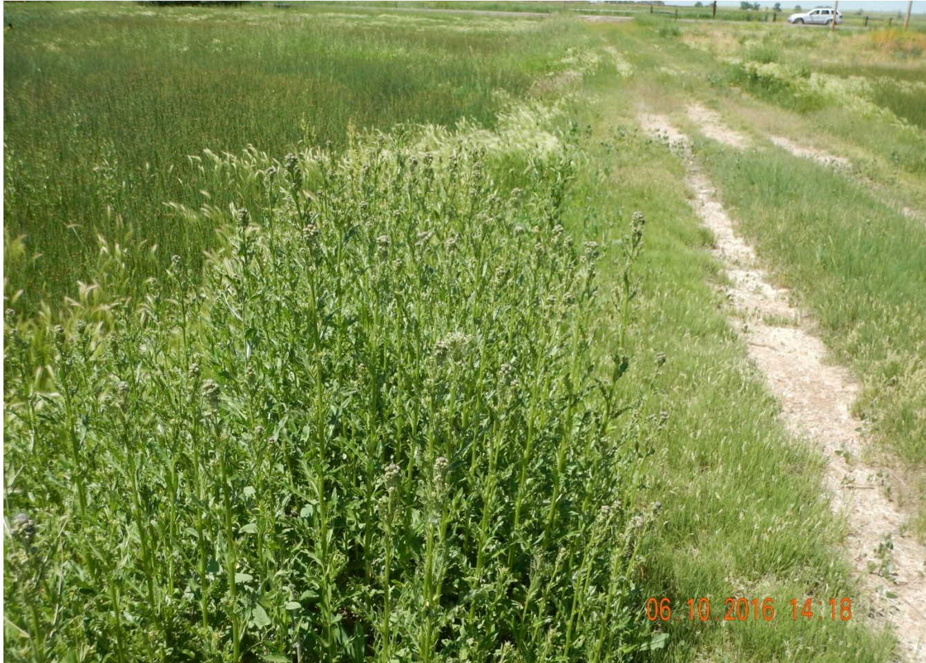
Photo 7. Photo taken along access road, facing North. List B Colorado Noxious weed species, Canada thistle ( Cirsium arvense ), exists along access road.