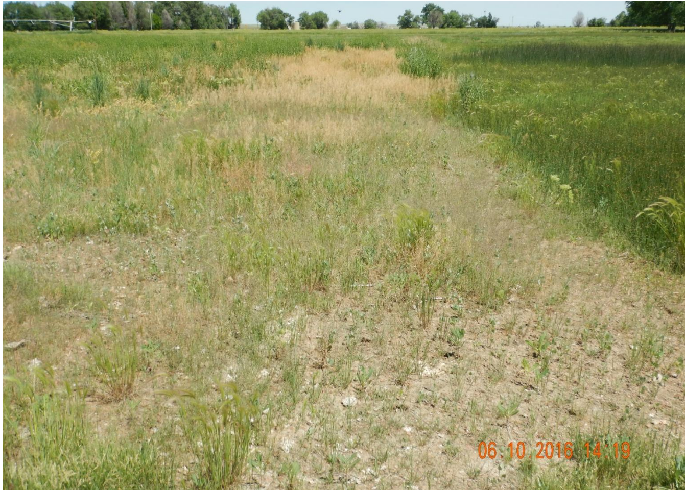
Photo 5. Photo taken from northern access road, facing East. Location does not reflect reference area conditions.