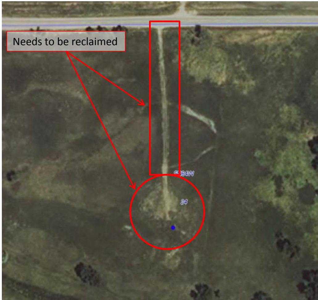
Photo 1. Aerial imagery taken 2013 using COGCC GISOnline illustrating total disturbance that needs to be reclaimed per Rule 1004. Refer to the following pictures.