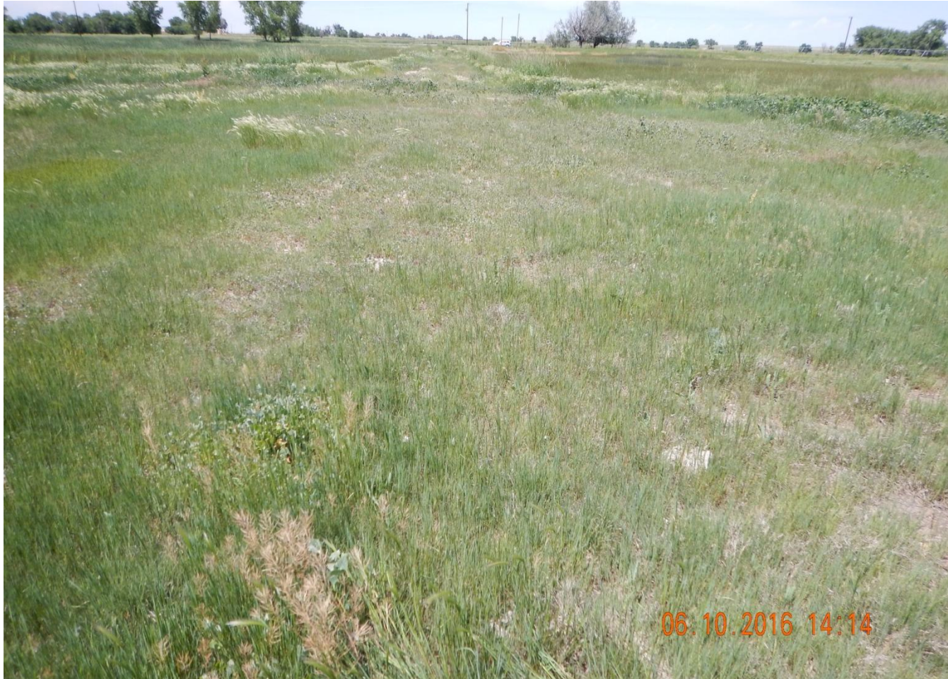
Photo 4. Photo taken from southern location, facing North. Location does not reflect reference area conditions and noxious weeds are present along access road.