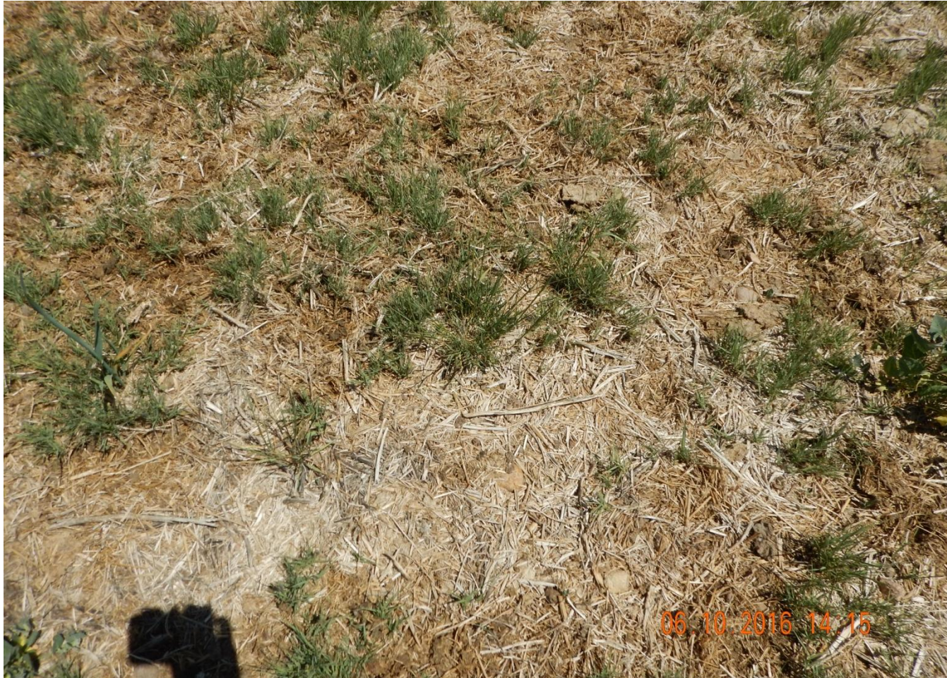
Photo 6. Photo taken from approximate center of location. It appears a seeding attempt was made.