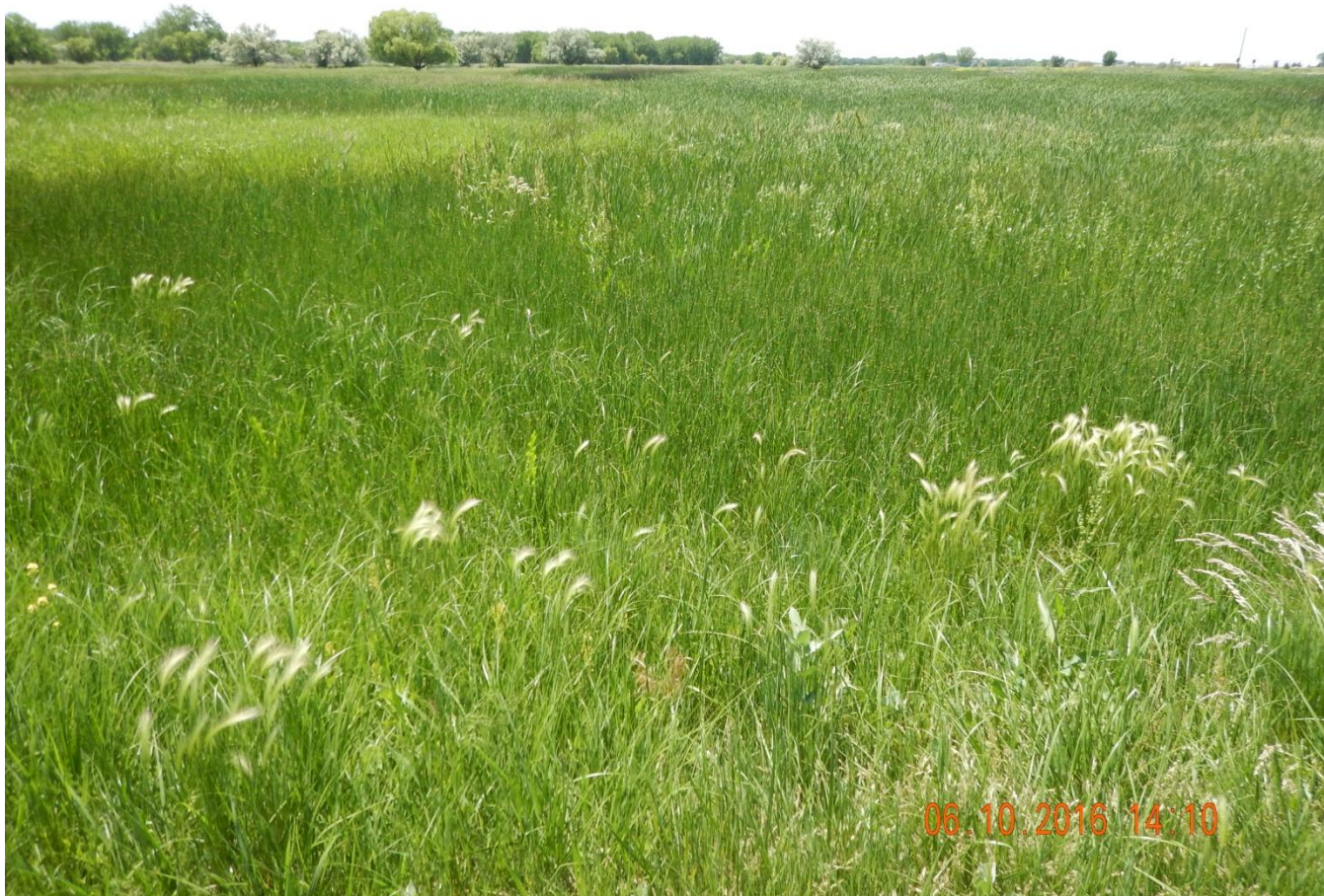
Photo 8. Reference photo illustrating vegetative composition that is not reflective throughout the location.