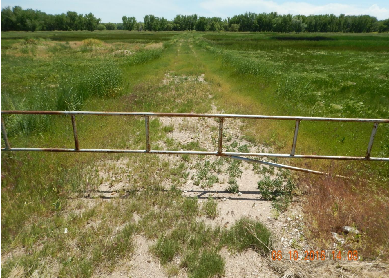
Photo 3. Photo taken from location entrance, facing South. Access road remains and has not been reclaimed per Rule 1004.