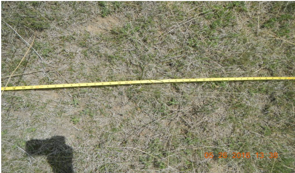
photo 7: View of groundcover at midpoint of transect at the reference area.