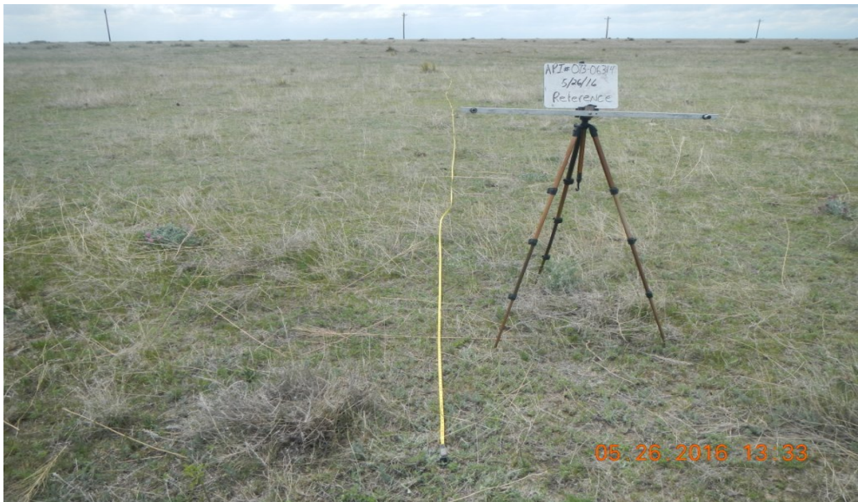
photo 6: Beginning of transect facing southwest at the reference area.