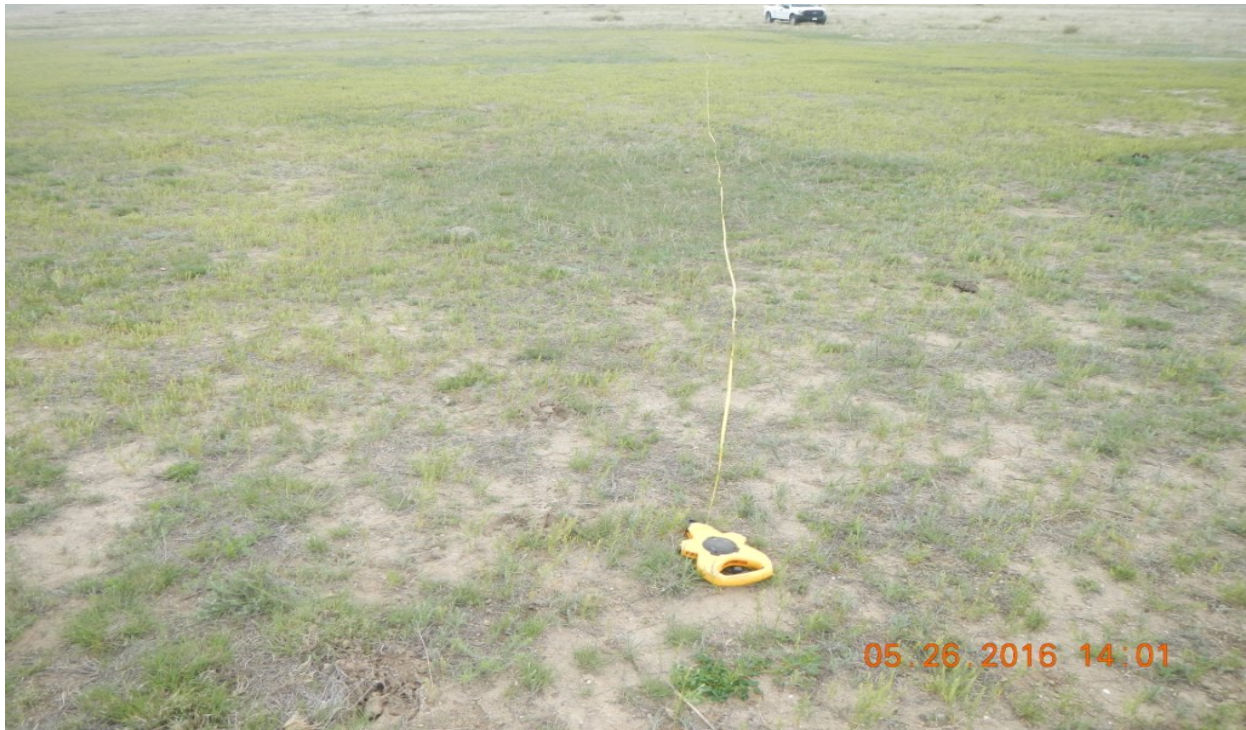
photo 5: End of transect facing south at the location (disturbed).