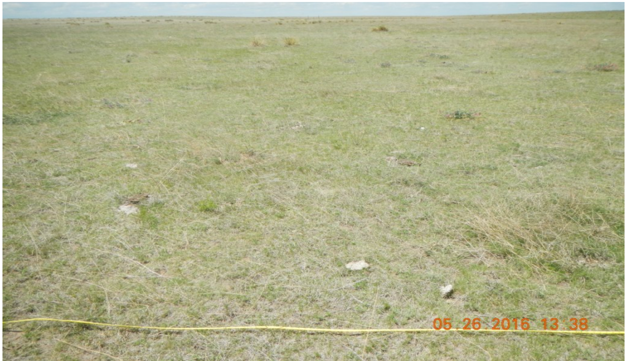
photo 9: Midpoint of transect facing northwest at the reference area.