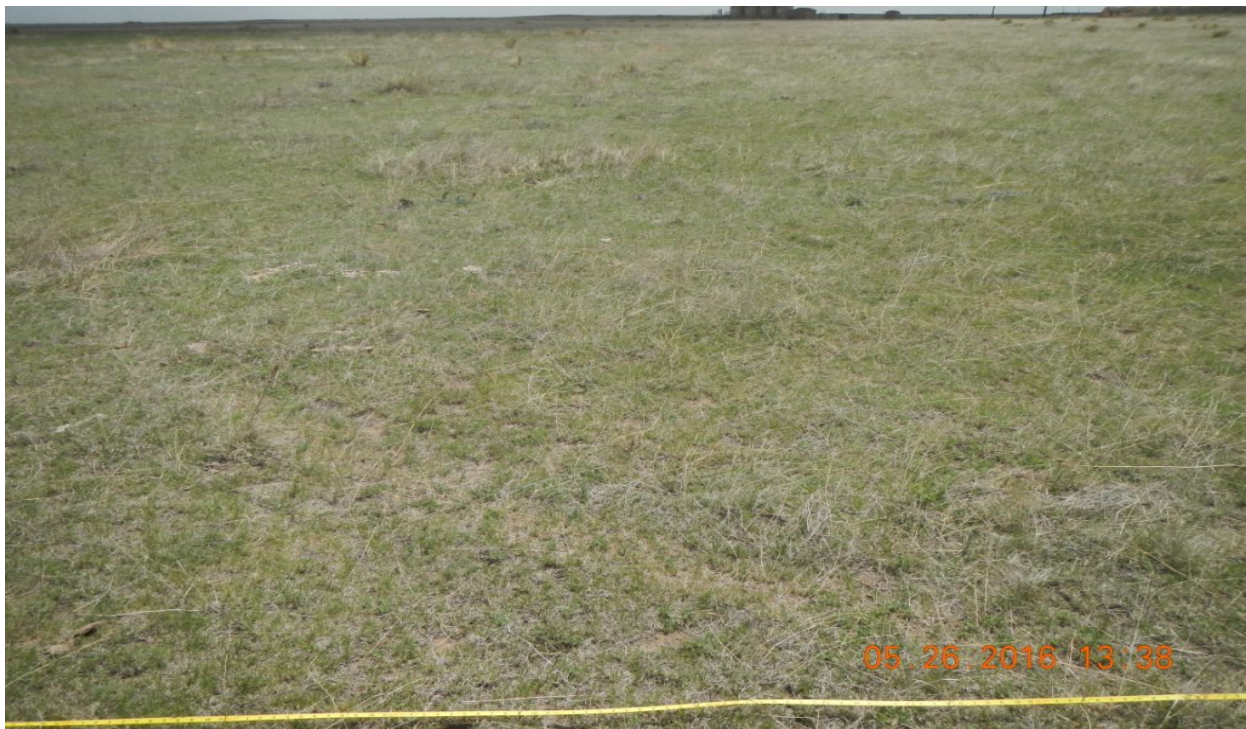
photo 8: Midpoint of transect facing southeast at the reference area.