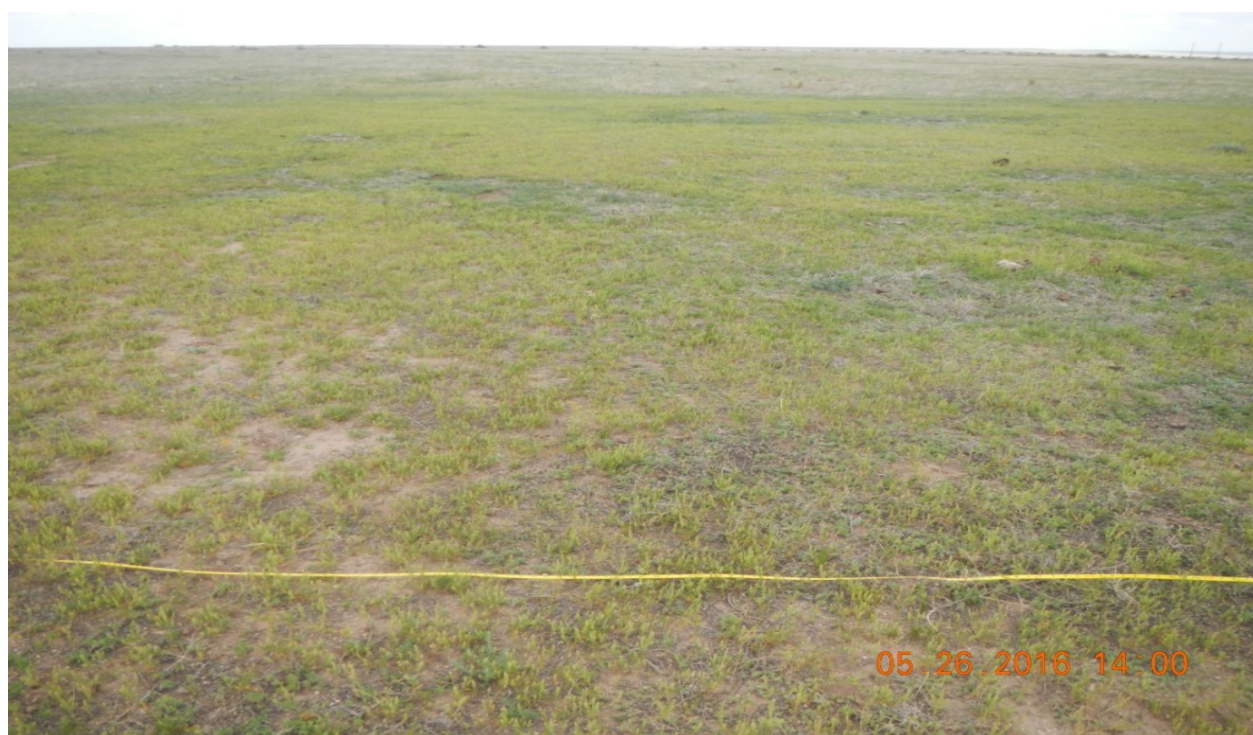
photo 4: Midpoint of transect facing east at the location (disturbed).