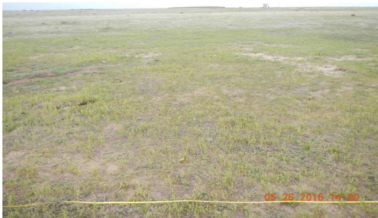
photo 3: Midpoint of transect facing west at the location (disturbed).