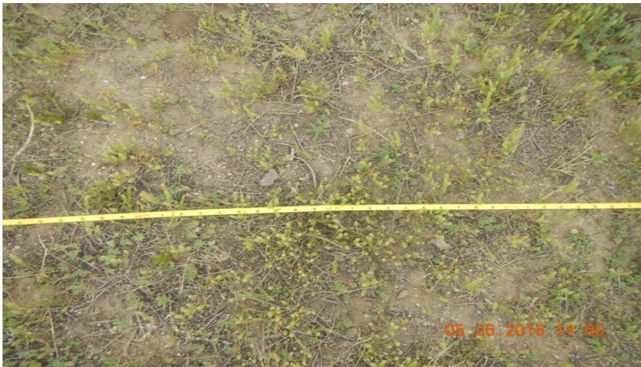
photo 2: View of groundcover at midpoint of transect at the location (disturbed).