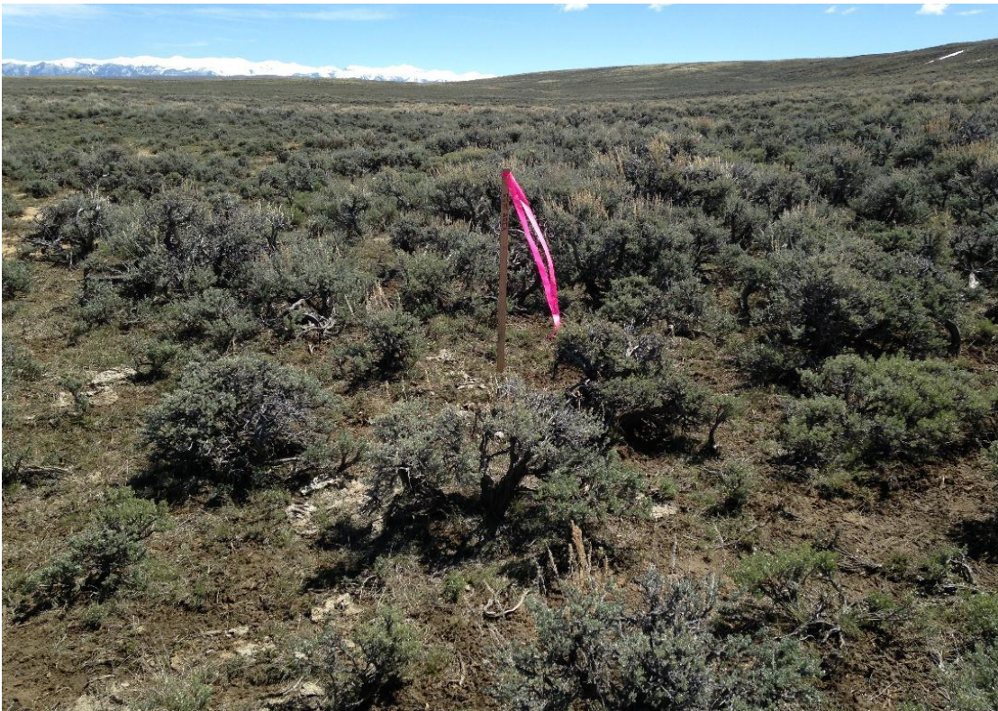
RAY RANCH 0780 S16 PAD REFERENCE AREA 40.57487668°N 106.3792392°W (NAD83, PDOP 1.129,) LOOKING EAST (May 3, 2016)