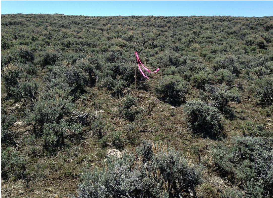
RAY RANCH 0780 S16 PAD REFERENCE AREA 40.57487668°N 106.3792392°W (NAD83, PDOP 1.129,) LOOKING SOUTH (May 3, 2016)