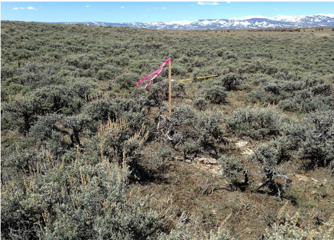
RAY RANCH 0780 S16 PAD REFERENCE AREA 40.57487668°N 106.3792392°W (NAD83, PDOP 1.129,) LOOKING WEST (May 3, 2016)