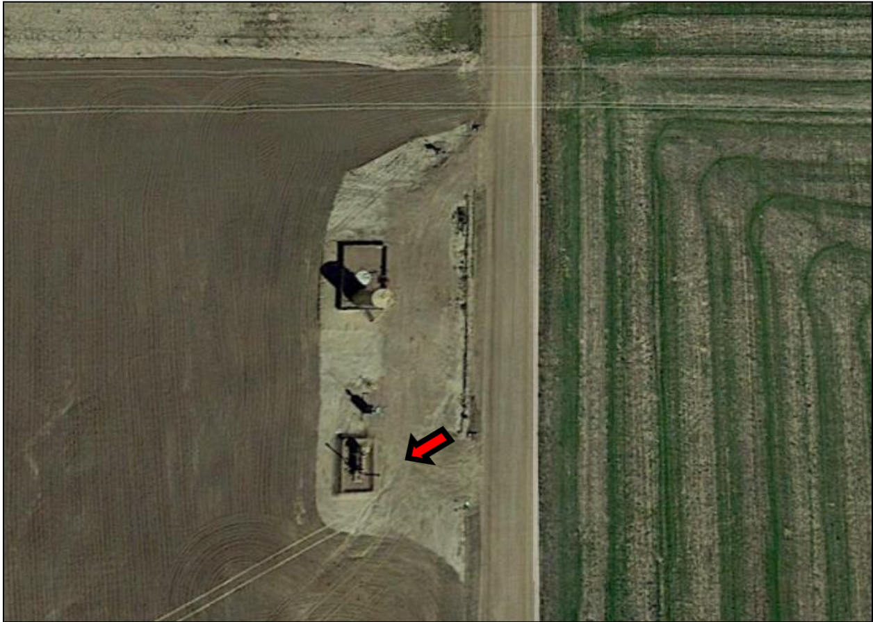
Photo 1: Aerial imagery illustrating erosion and transport of sediment initiates on location, traveling southwest onto cropland. Refer to Document# 682400493 for complete field photos from the 3/8/16 inspection.