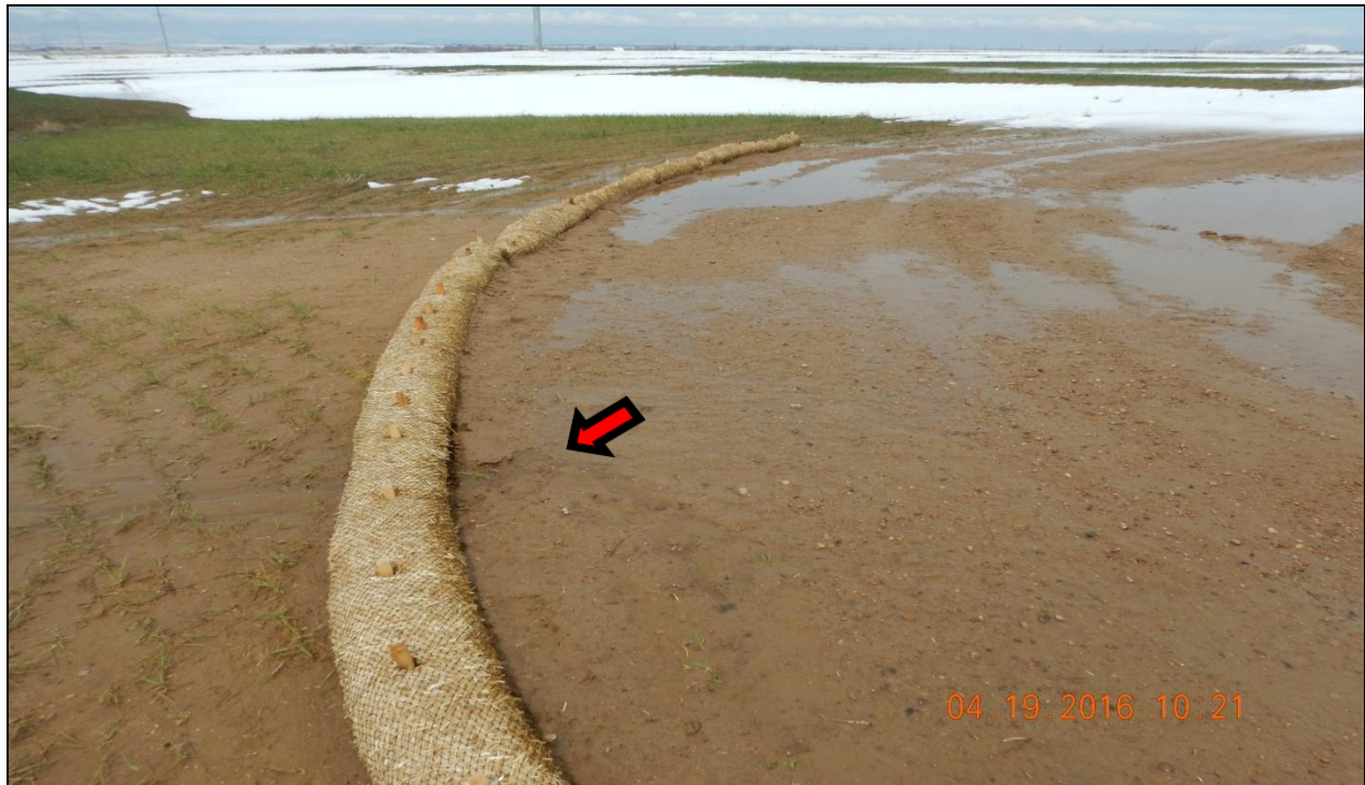
Photo 6: Photo taken 4/19/16 from southern tank battery location, facing West. Installed wattles around south, southwest location. Wattles not properly installed-transport of sediment still occurring.