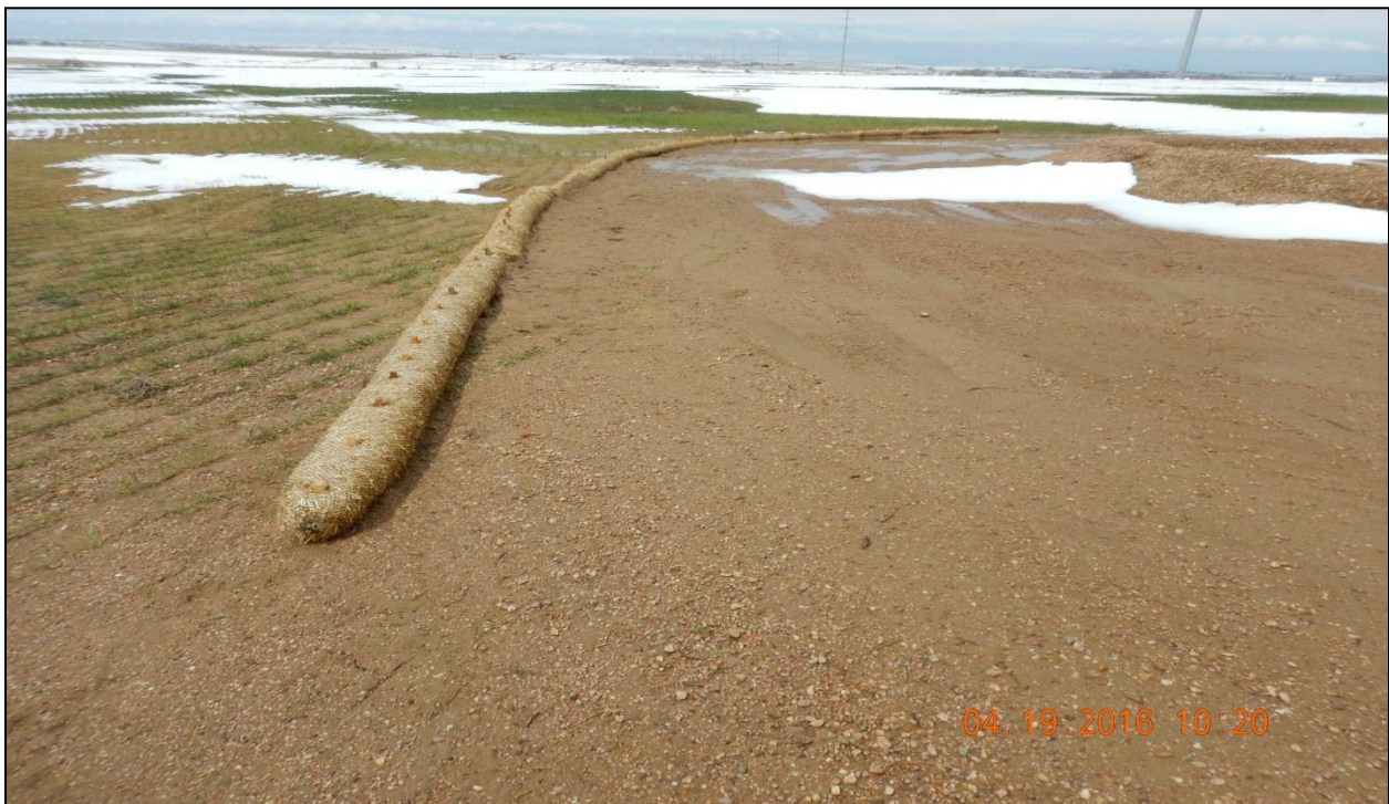
Photo 5: Photo taken 4/19/16 from southern tank battery location, facing West. Installed wattles around south, southwest location. Wattles not properly installed- see following photos.