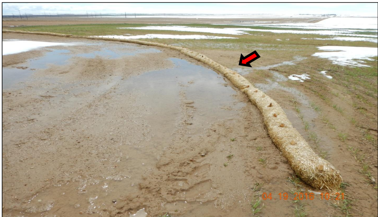
Photo 7: Photo taken 4/19/16 from southwest tank battery location, facing Southeast. Installed wattles around south, southwest location. Wattles not properly installed-transport of sediment still occurring.