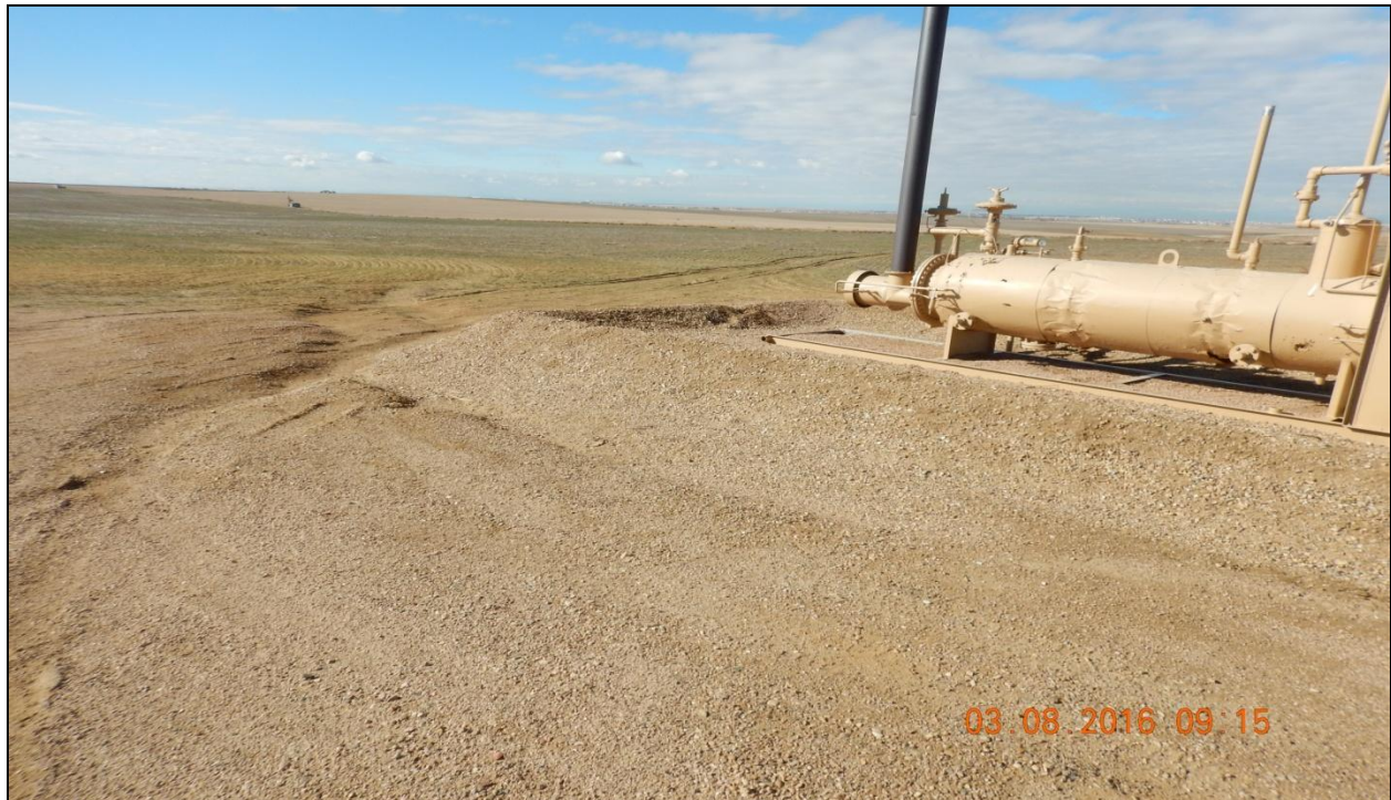
Photo 2: Photo taken 3/8/16 from the southern tank battery location, facing Southwest. Need to control stormwater runoff that minimizes erosion and transport of sediment offsite per Rule 1002.