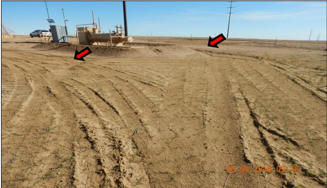
Photo 4: Photo taken 3/8/16 from the southern tank battery location, facing Northeast. Need to control stormwater runoff that minimizes erosion and transport of sediment offsite per Rule 1002.