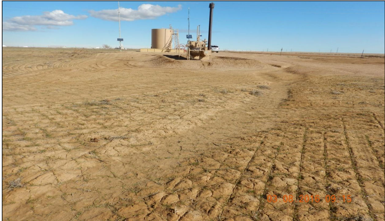
Photo 3: Photo taken 3/8/16 from the southern tank battery location, facing North. Need to control stormwater runoff that minimizes erosion and transport of sediment offsite per Rule 1002.