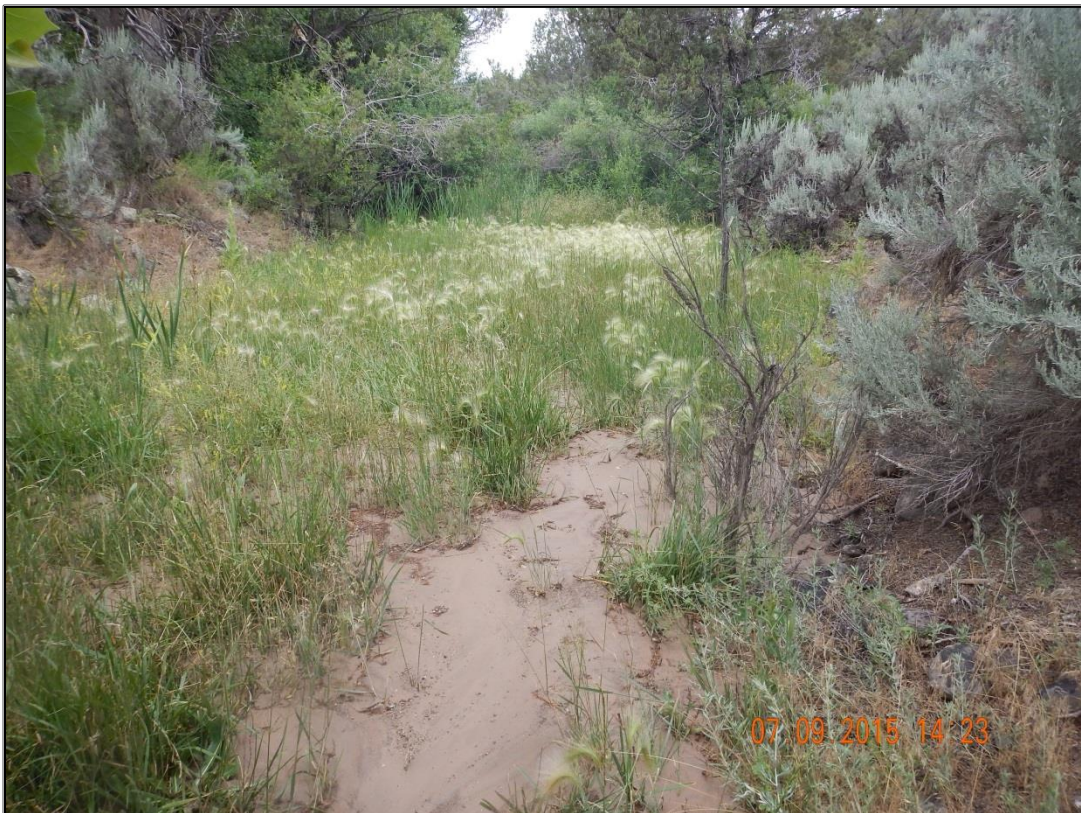
Photo 2. Drainage downstream of sampling location KP 3. (July 9, 2015)