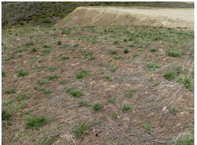
Reclaimed area southwest of pad