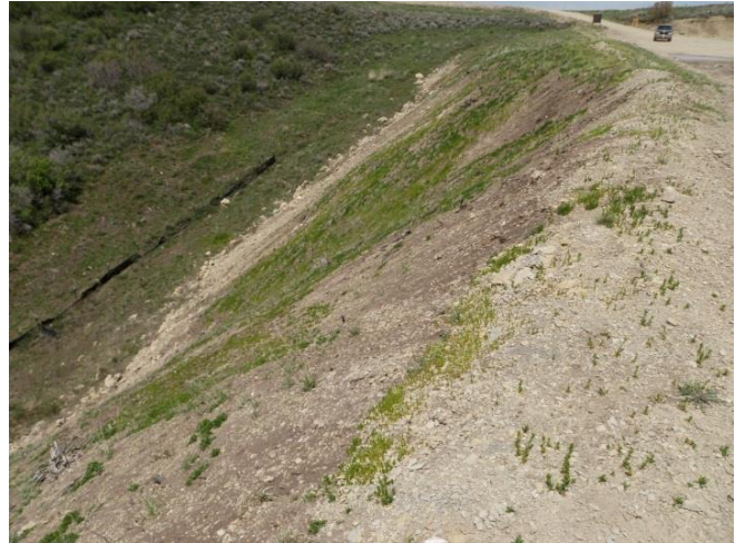
Northwestern fill slope