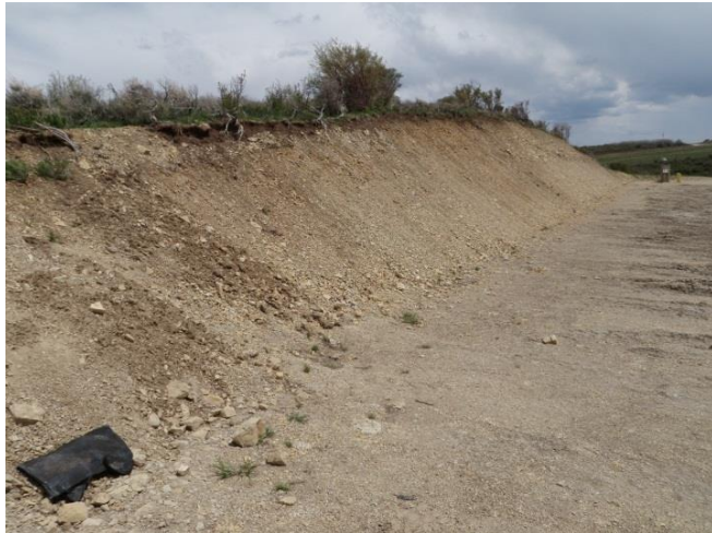
Northeastern cut slope