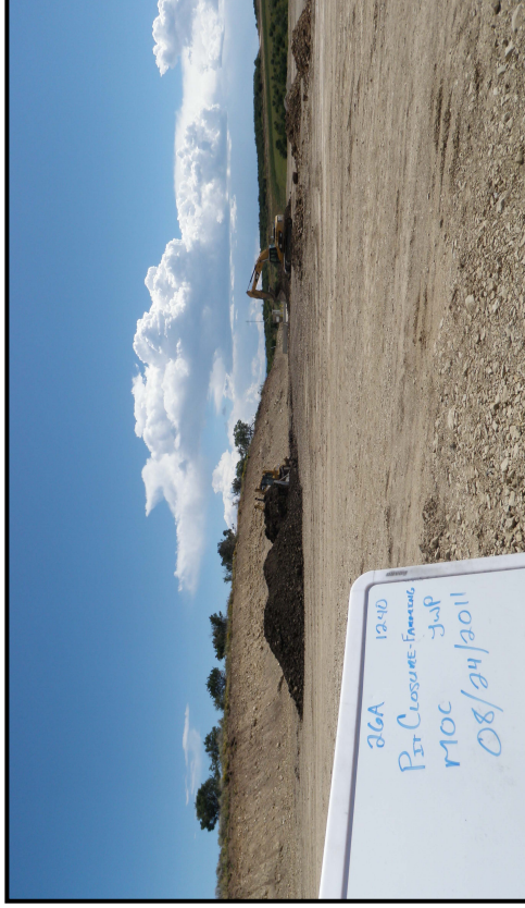
Photo 5 – Front end loader rolling material to achieve homogenous mixture.