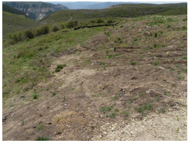
Top soil pile near south corner of pad