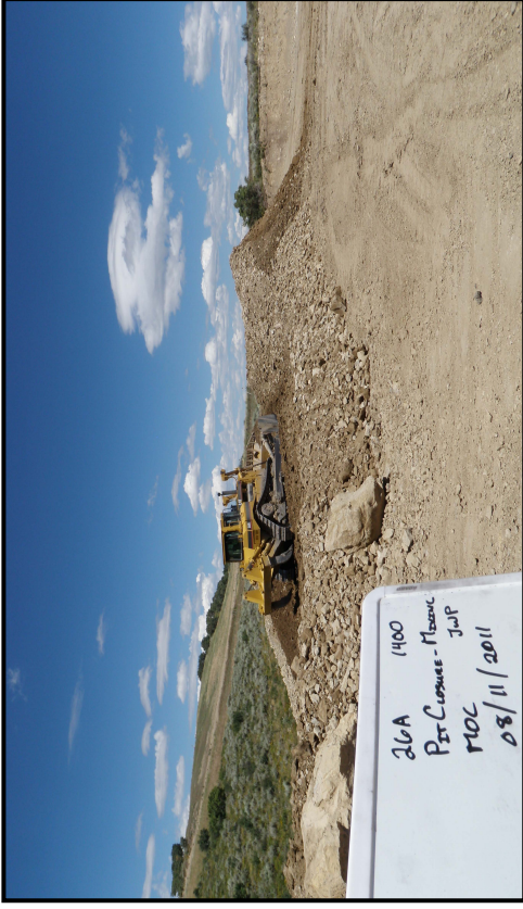
Photo 2 – D8 providing clean fill material from NW corner to track hoe for mixing.