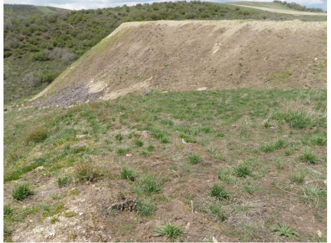
Reclaimed area southwest of pad