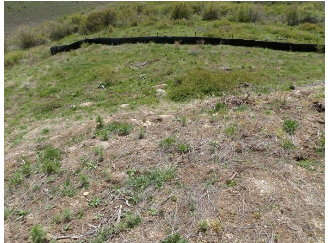
Reclaimed area near south corner of pad