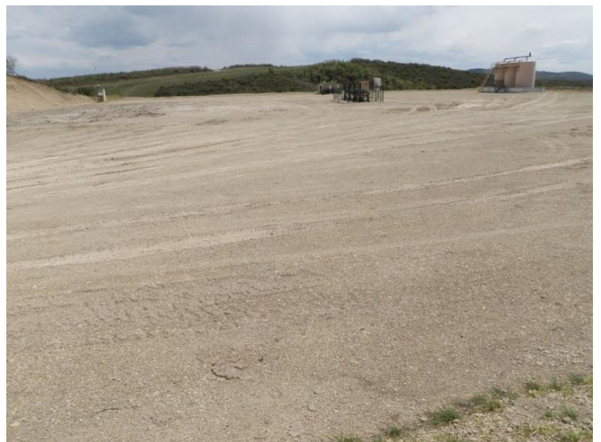
Looking east across pad