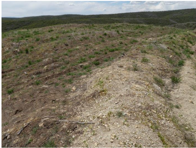
Top soil pile near south corner of pad