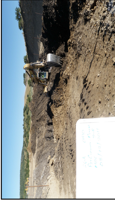
Photo 4 – Track hoe mixing pit contents with clean material within pit.