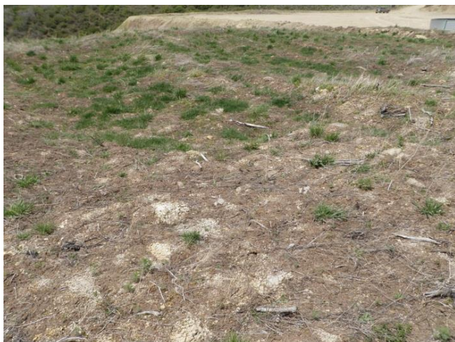
Reclaimed area southwest of pad