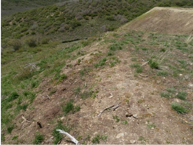
Reclaimed area southwest of pad