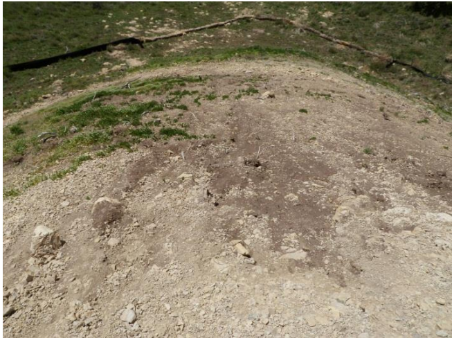
West corner fill slope