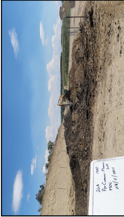
Photo 3 – Track hoe mixing pit contents with clean material within pit.