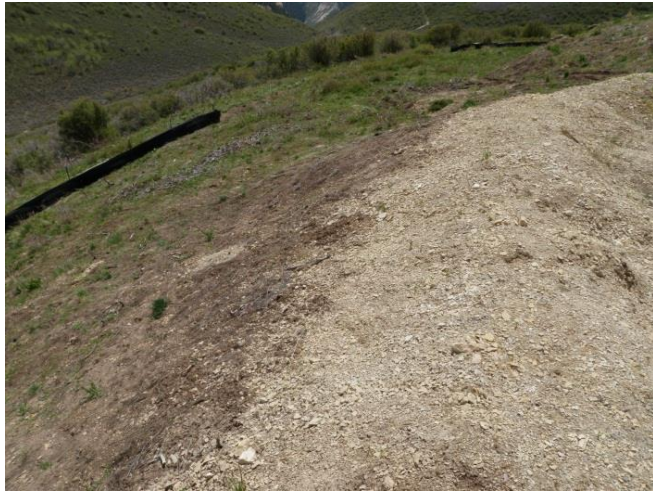
South corner of pad