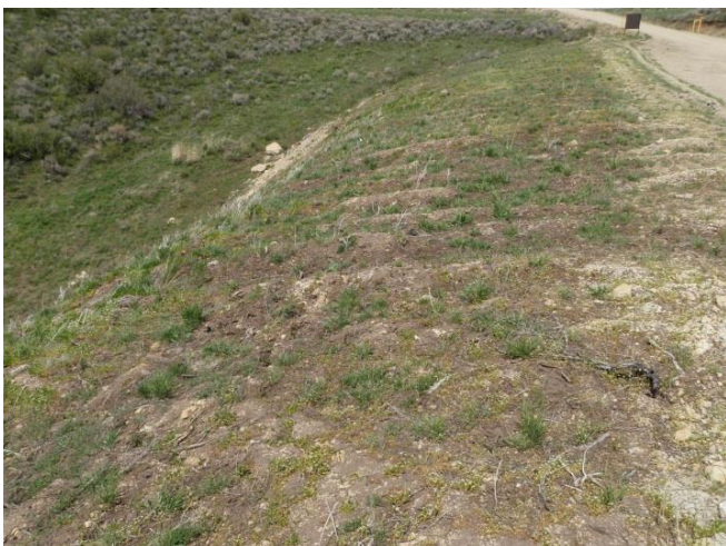
Reclaimed area northwest of pad