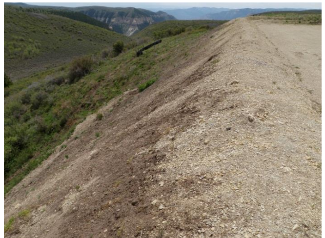
Southeastern fill slope