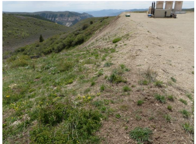
Southeastern edge of pad