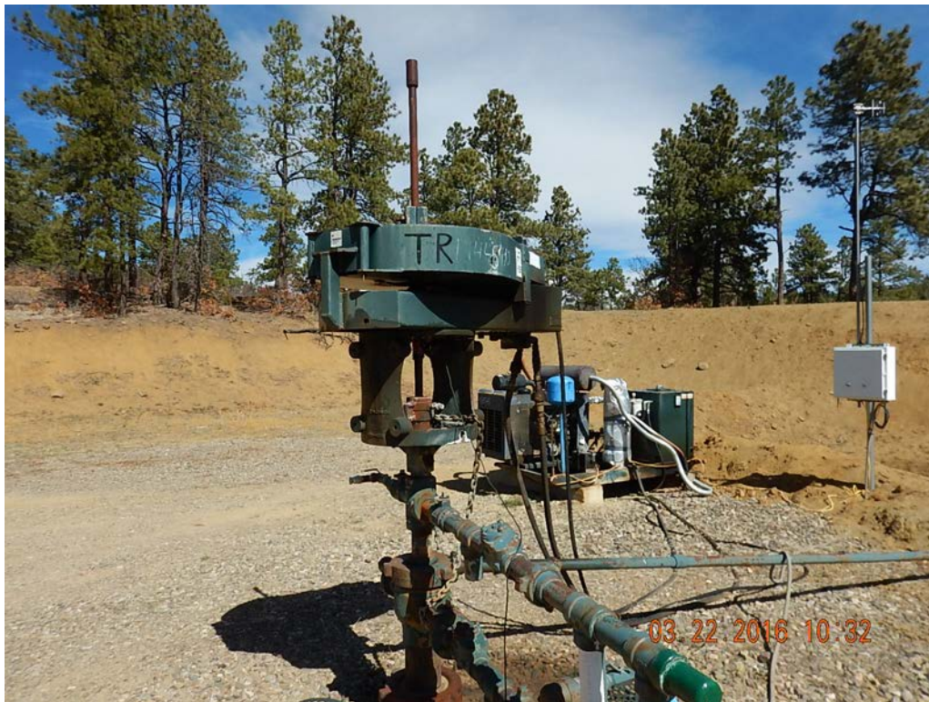
Figure 2 – Wellhead.