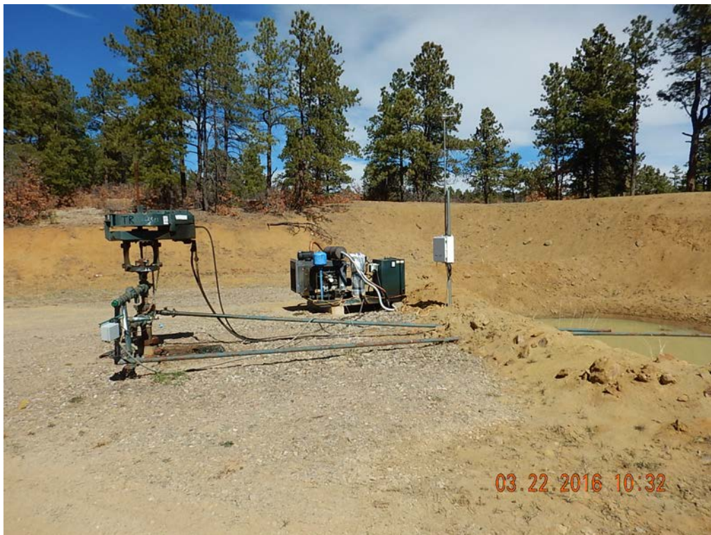
Figure 3 – Wellhead and pit.