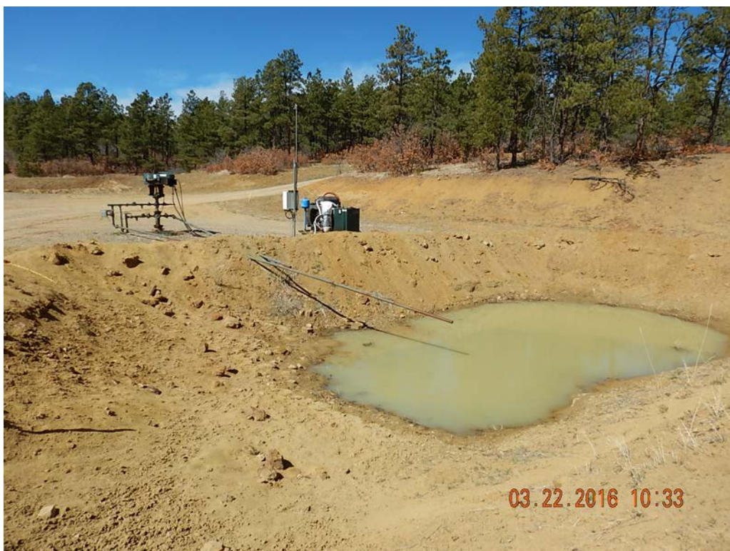
Figure 4 – Pit facility and wellhead.