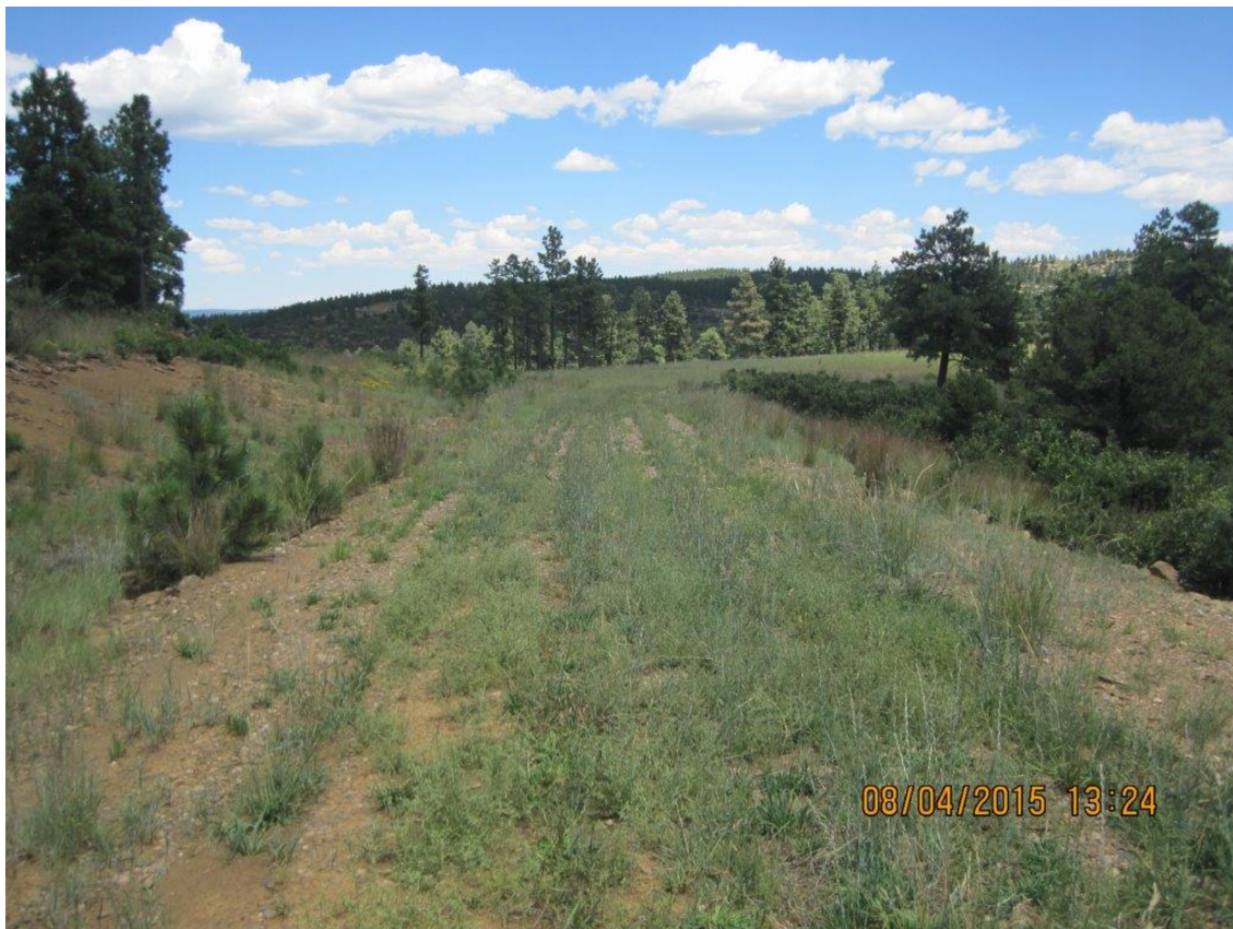
Picture.3. View of Right-of-Way with vegetation and well pad.