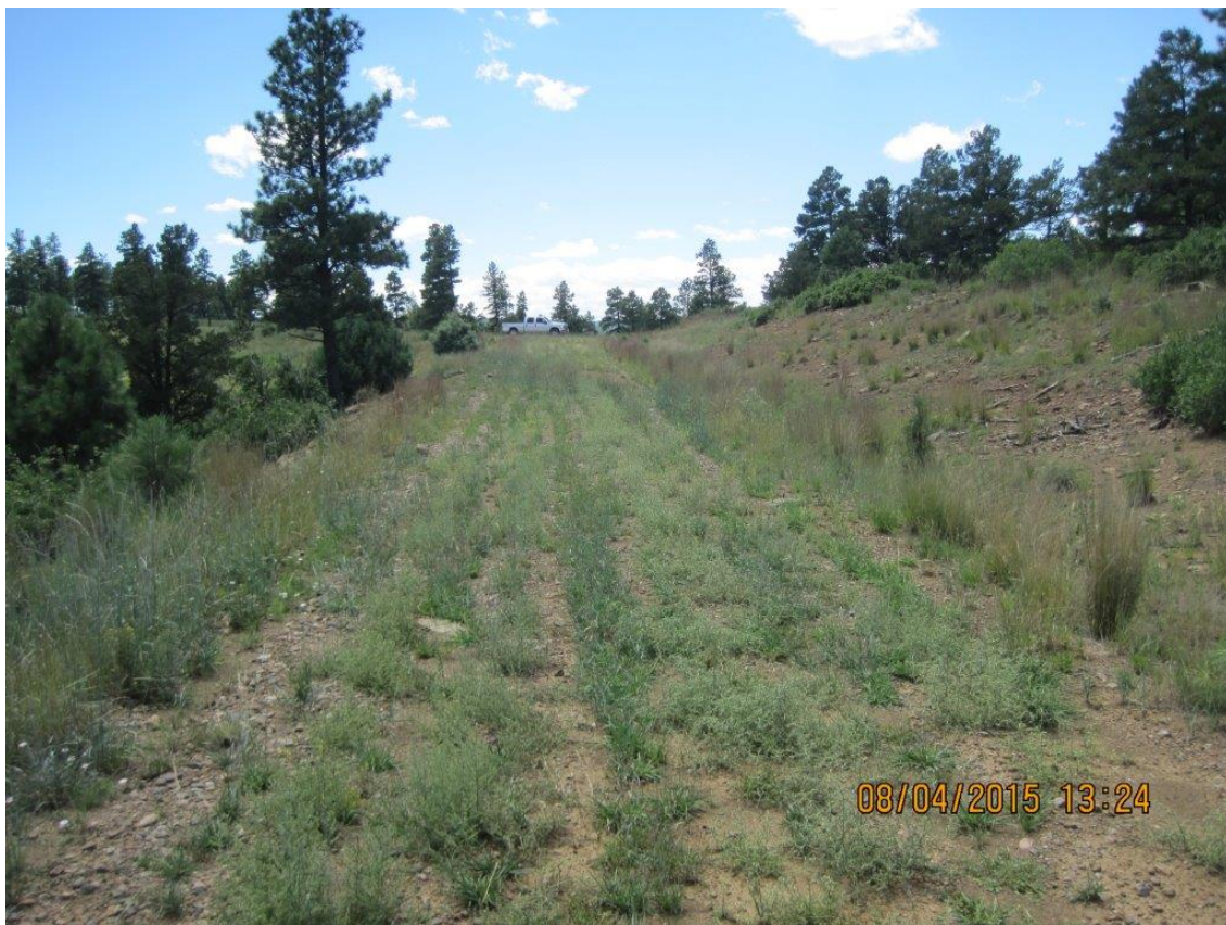
Picture.4. View of Right-of-Way looking towards entrance and main lease road.