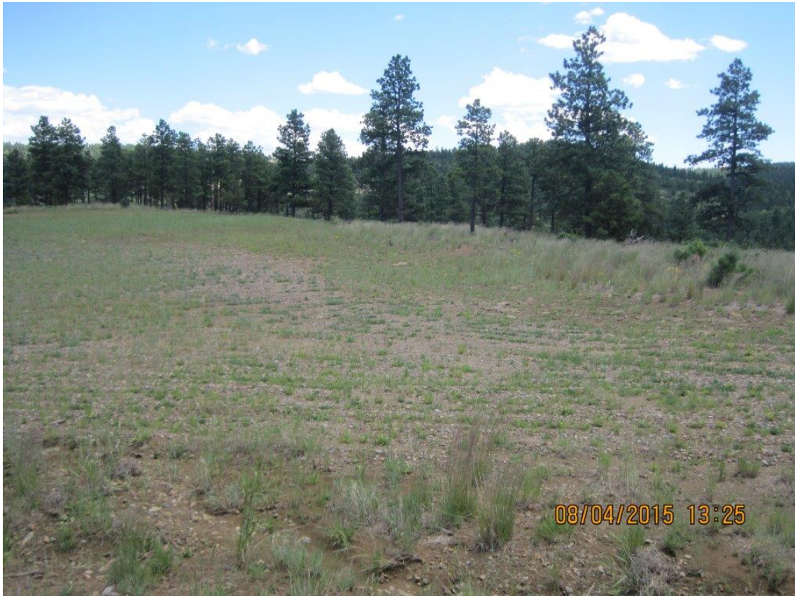
Picture.6. Northeast corner of the location facing south. Gravel remains per Surface owner request.