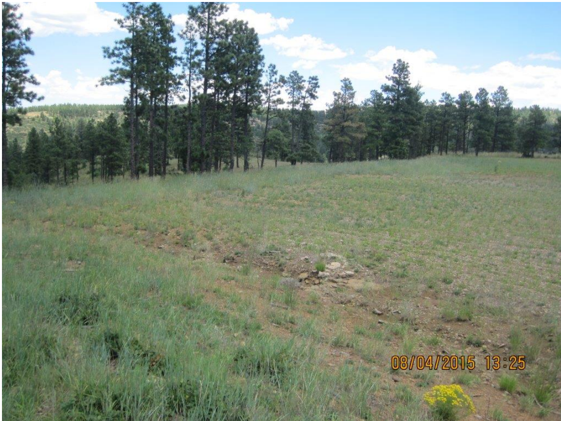
Picture.5. View facing north towards the location stormwater drainage BMP.