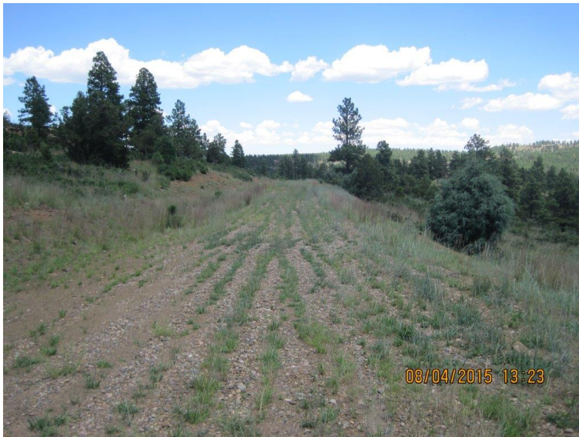
Picture.2. Surface owner requested seeding and gravel to remain on Right-of-Way.