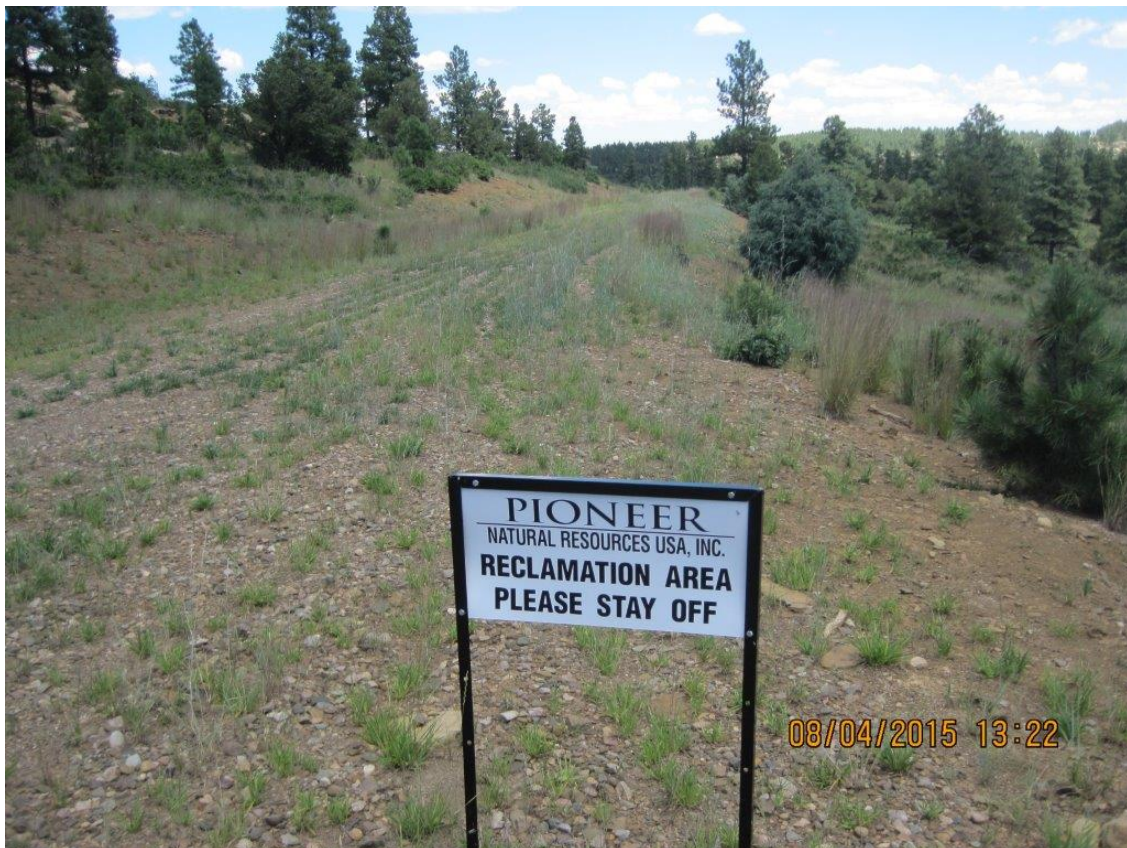
Picture .1. Access road north to the location off of the main road.