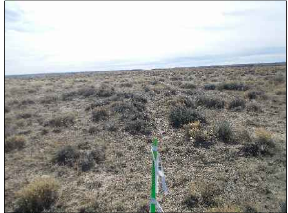
REFERENCE AREA LOOKING SOUTH 10/28/2015