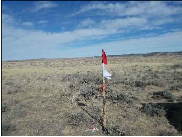
WELL LOCATION LOOKING NORTH 10/28/2015