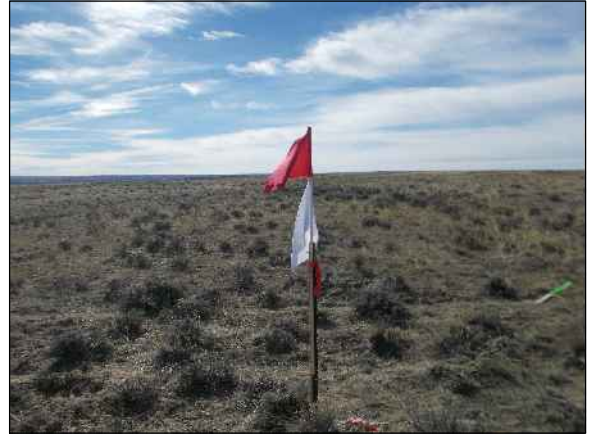
WELL LOCATION LOOKING SOUTH 10/28/2015