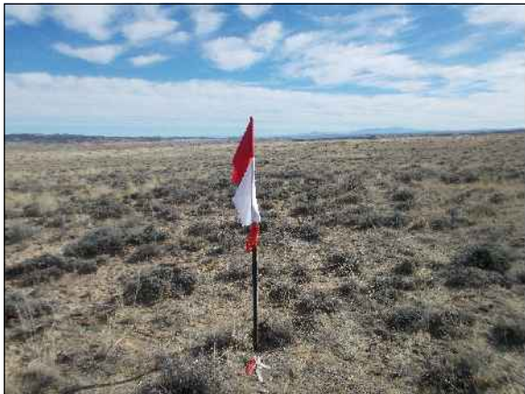
WELL LOCATION LOOKING EAST 10/28/2015