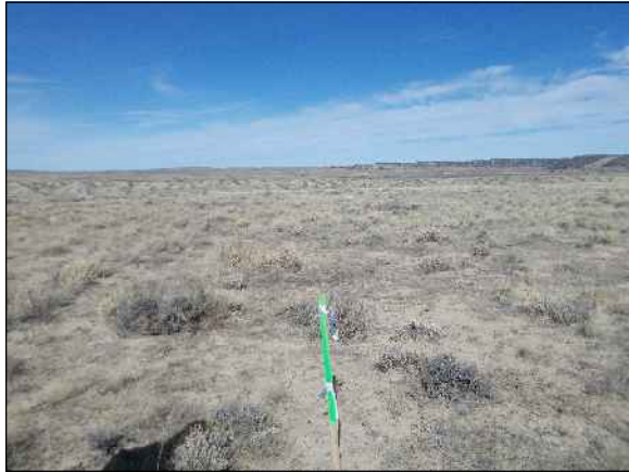
REFERENCE AREA LOOKING NORTH 10/28/2015