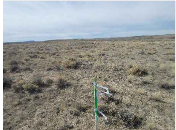
REFERENCE AREA LOOKING WEST 10/28/2015

REFERENCE AREA CENTER STAKE (DO NOT DISTURB) LATITUDE (NAD83) NORTH 40.979550 DEG. LONGITUDE (NAD83) WEST 108.331423 DEG.