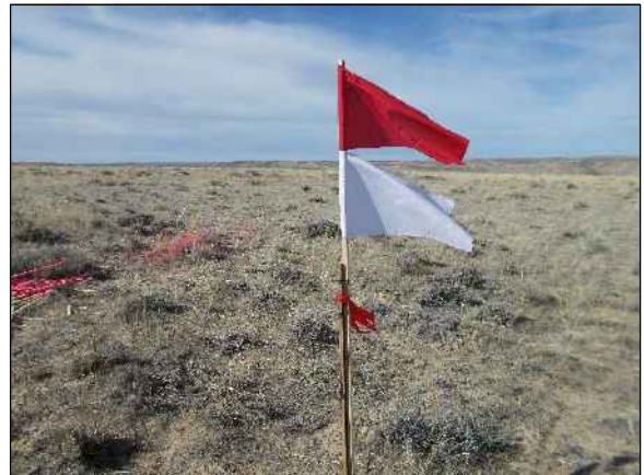
WELL LOCATION LOOKING WEST 10/28/2015