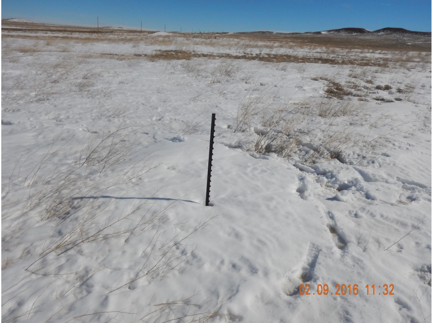
Figure 3: Photo taken from location, facing east. Note stake marking well location as not been removed.