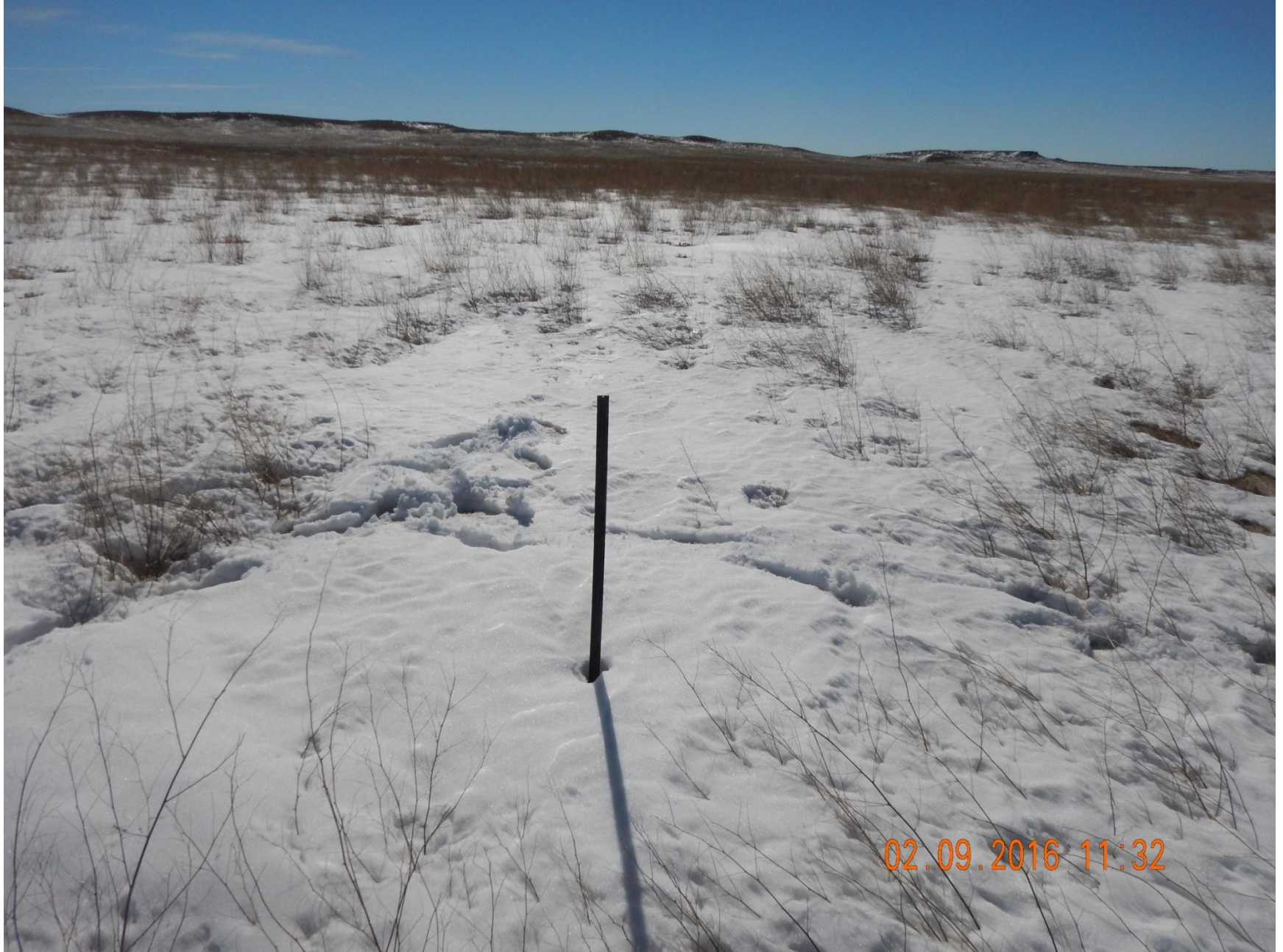
Figure 4: Photo taken from location, facing south. Note stake marking well location as not been removed.