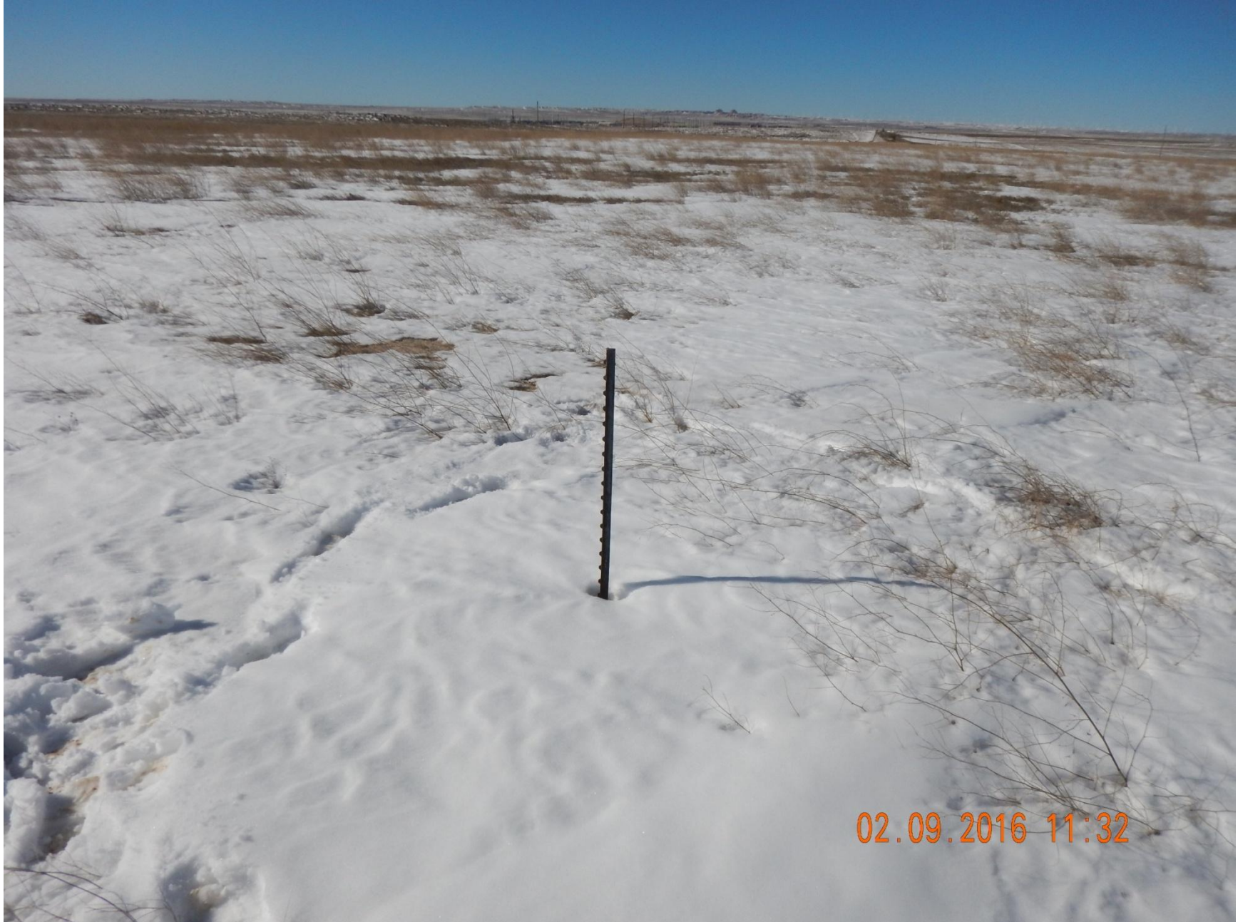
Figure 5: Photo taken from location, facing west. Note stake marking well location as not been removed.