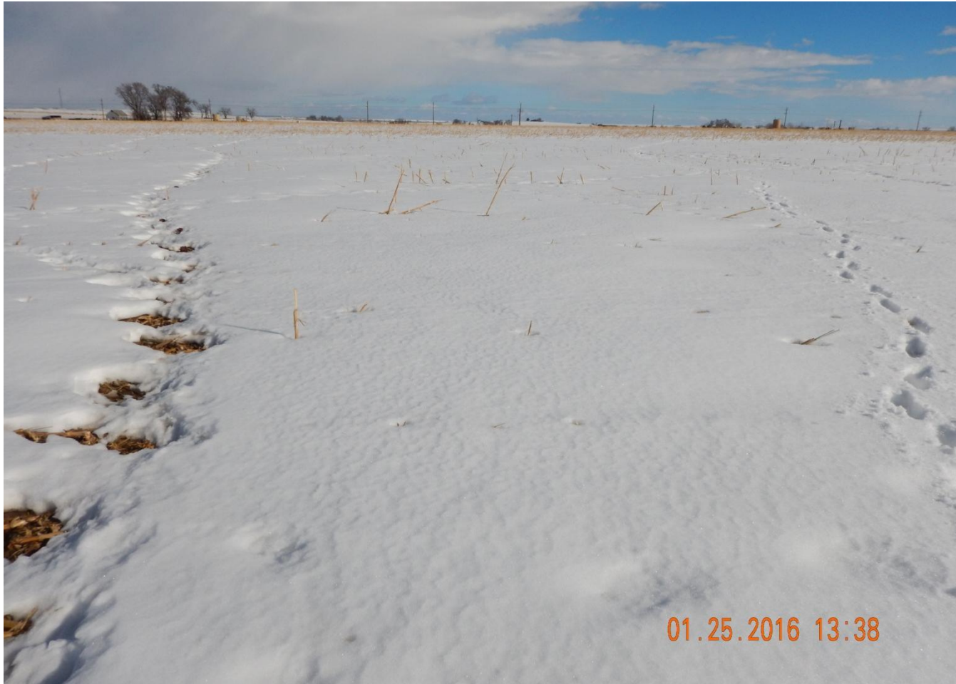
Photo 3. Photo taken from center of location, facing East. It appears the location was never built.