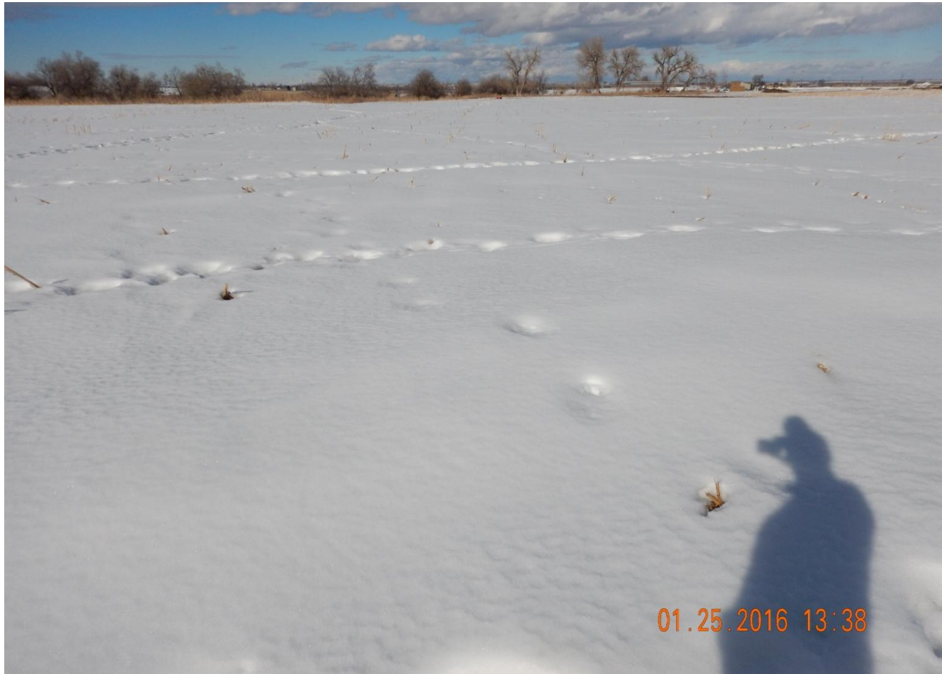
Photo 2. Photo taken from center of location, facing North. It appears the location was never built.