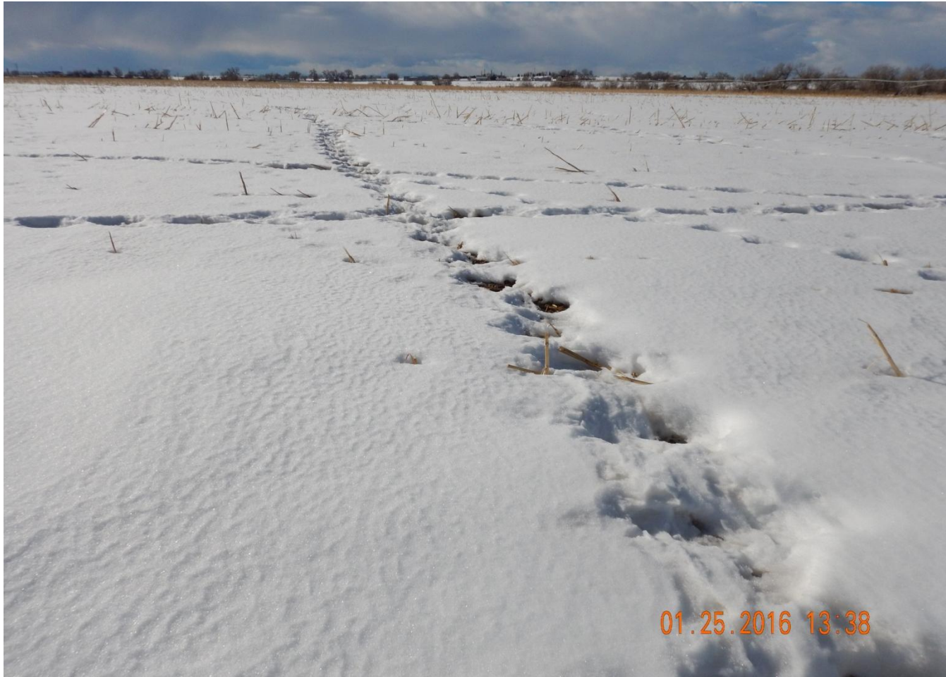
Photo 1. Photo taken from center of location, facing West. It appears the location was never built.