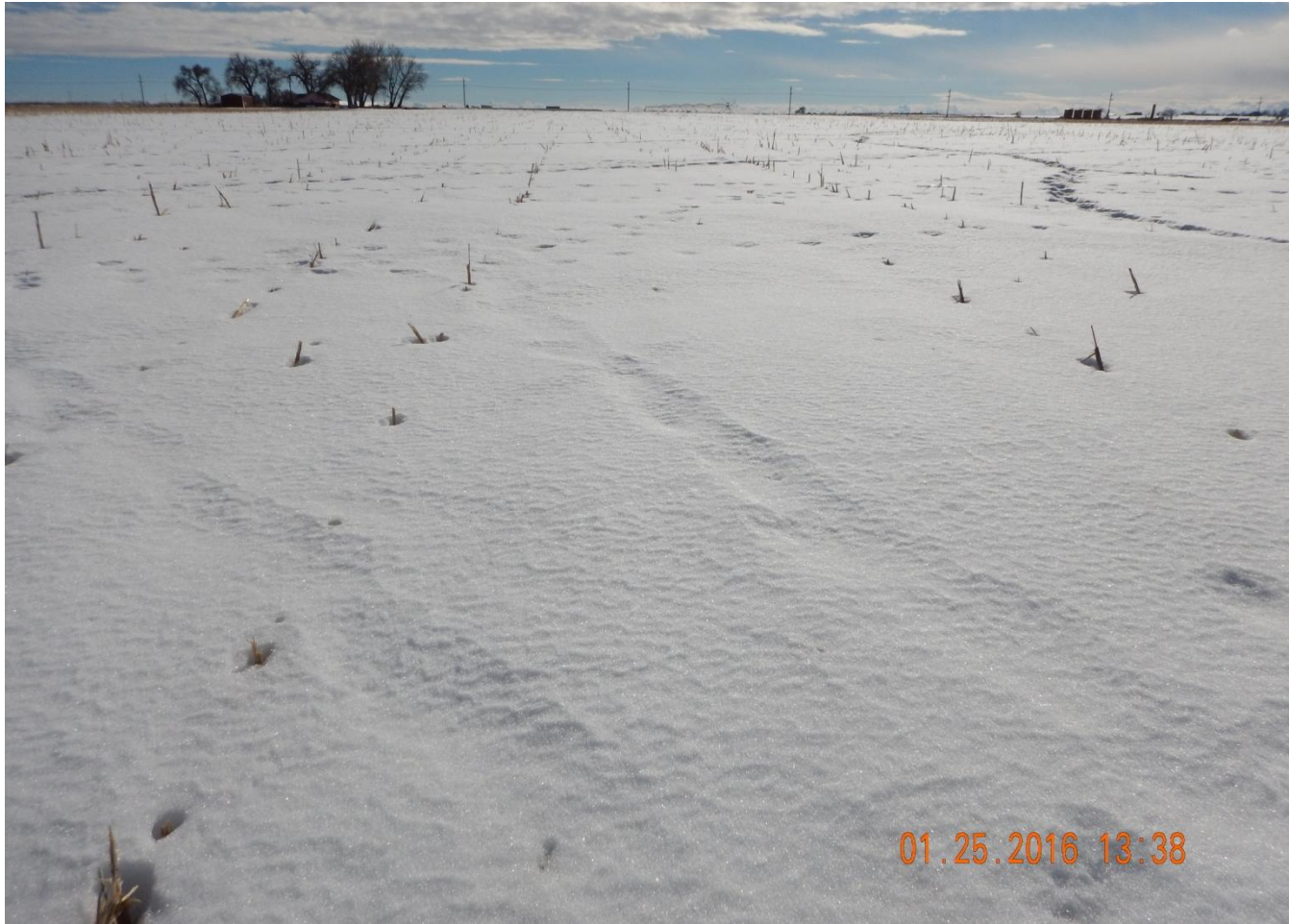
Photo 4. Photo taken from center of location, facing South. It appears the location was never built.