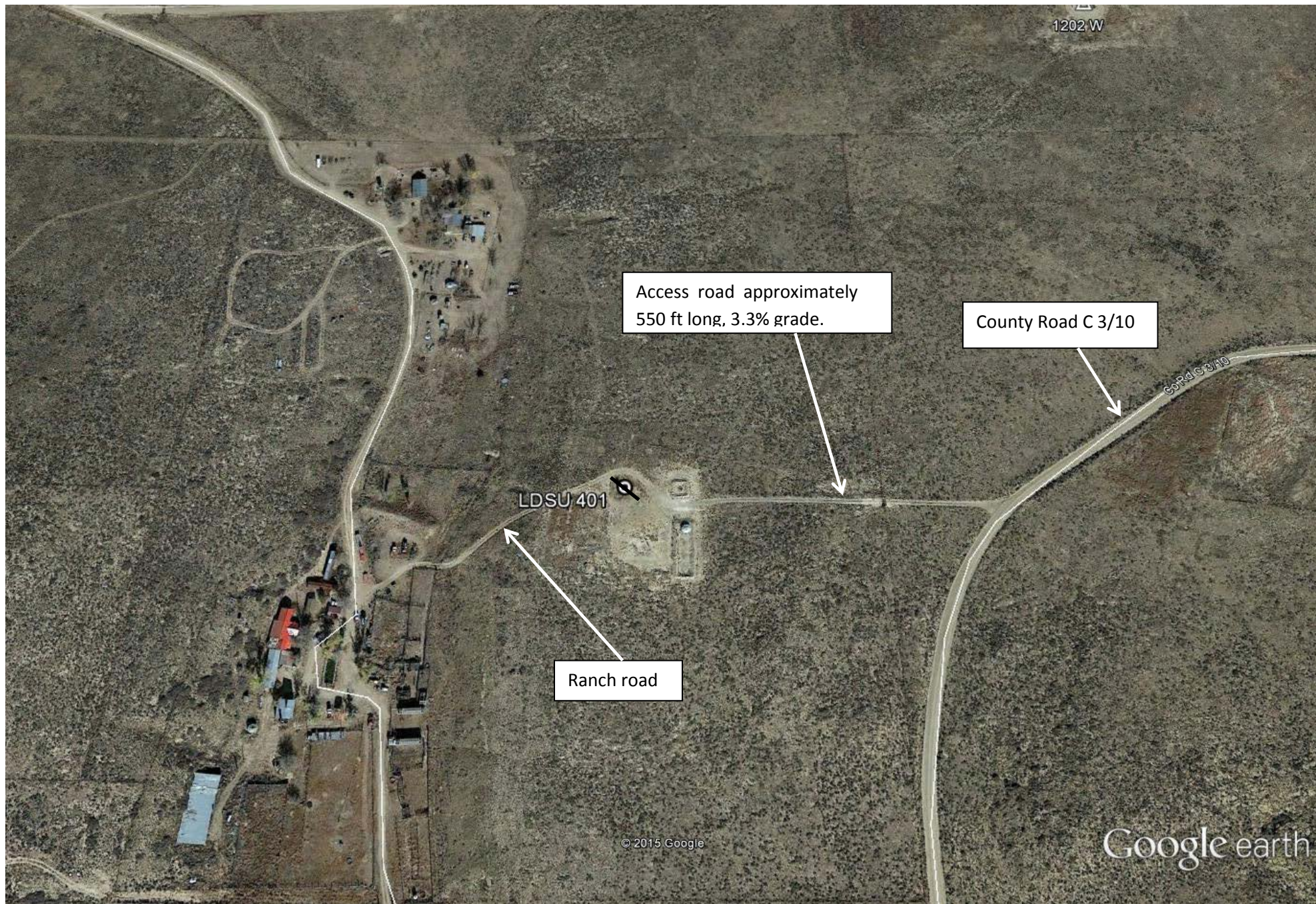
LDSU 401 Location NE NW Section 12, Township 35 South, Range 46 West, Baca County, CO