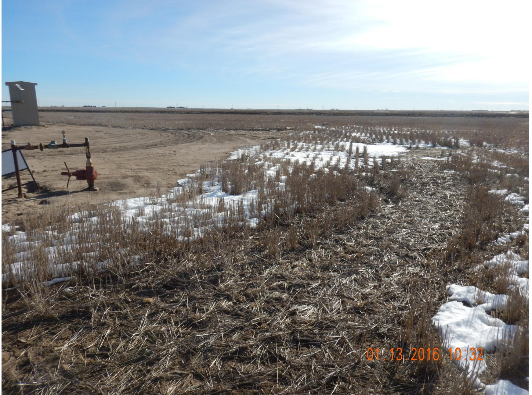
Figure 2: Photo taken from northwest end of location, facing south. Photo shows interim reclamation and project area.