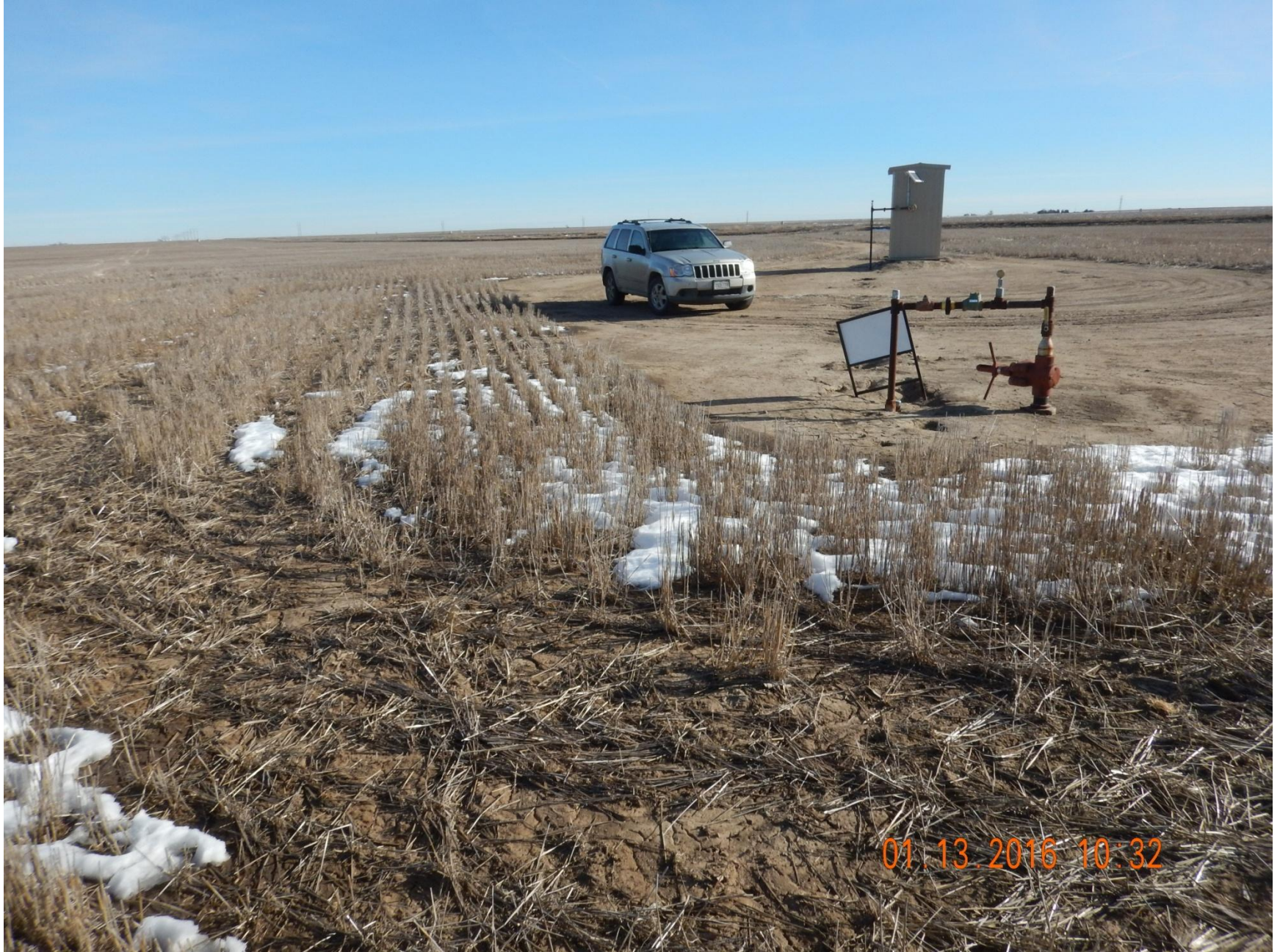
Figure 3: Photo taken from northwest end of location, facing east. Photo shows interim reclamation and project area.