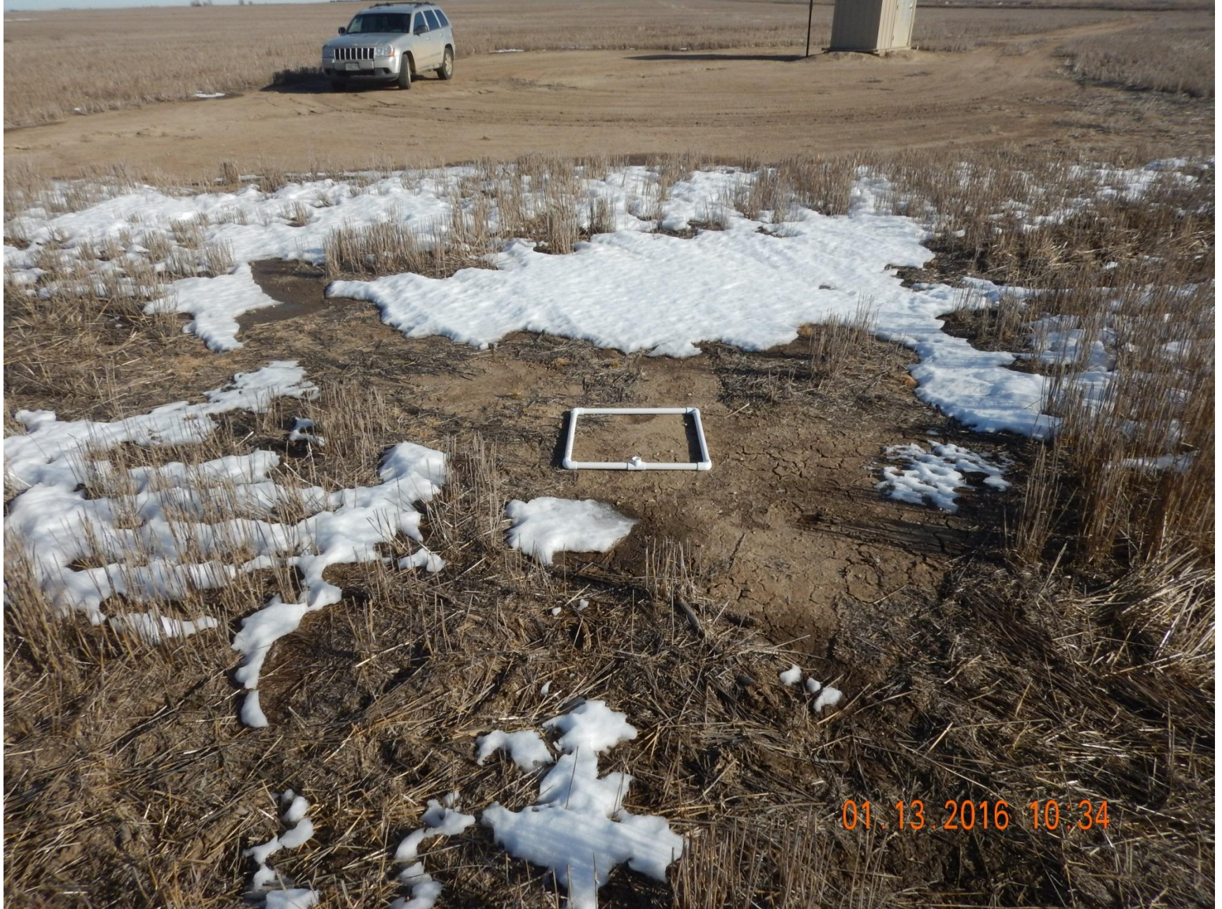
Figure 5: Photo taken from west end of location. Photo shows sparse vegetation and exposed soil in interim area. \frac{1}{2} square meter quadrat for reference.