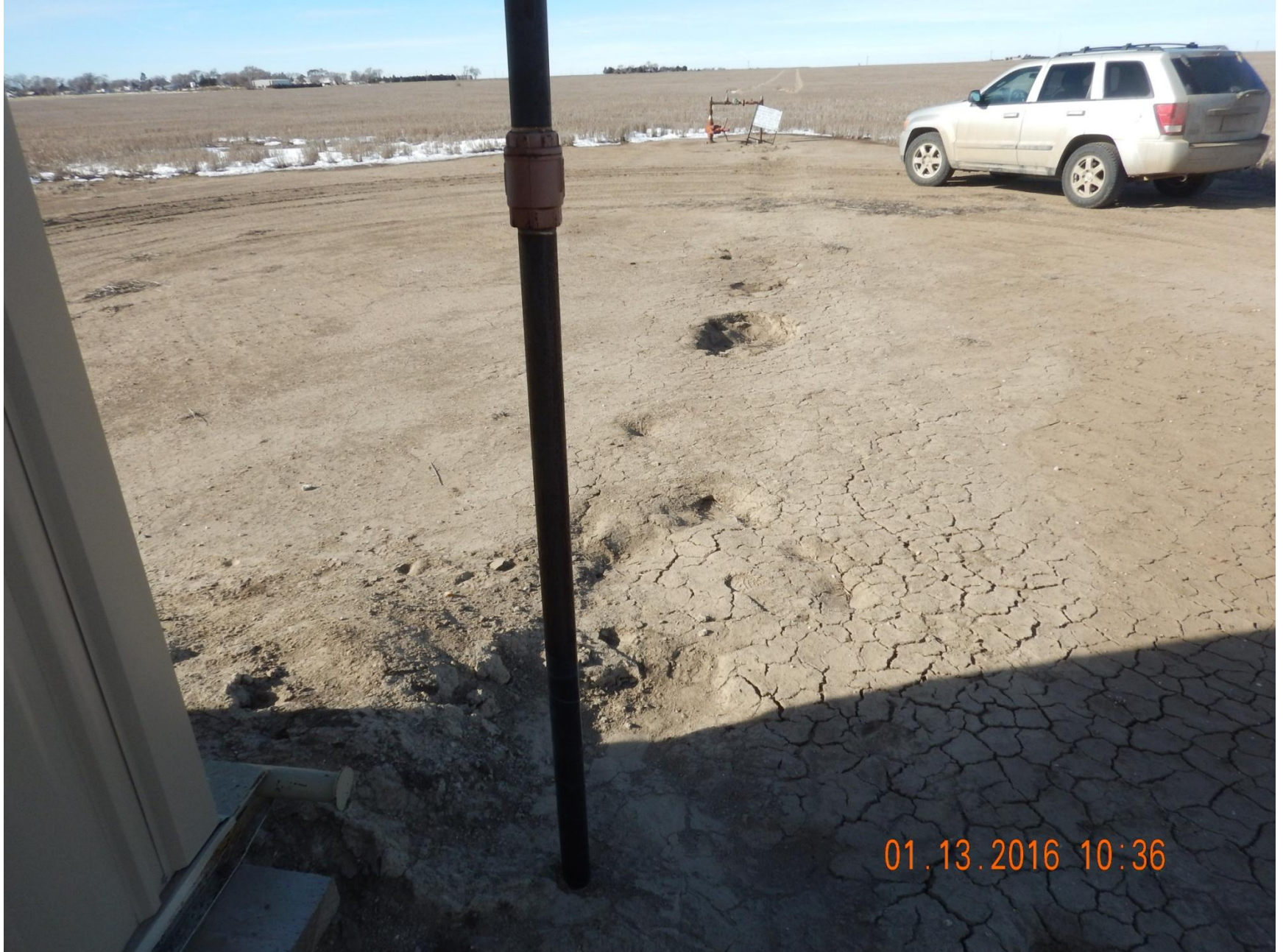
Figure 7: Photo taken from east end of location, facing west. Photo shows surface depression on pad occurring along pipeline.