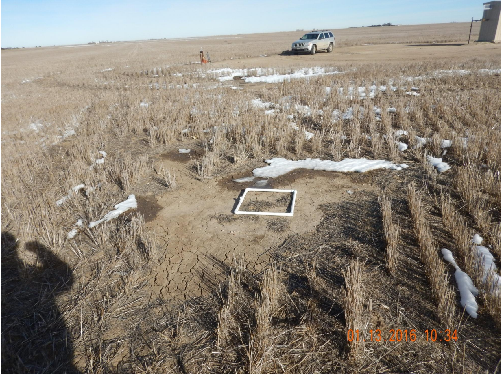
Figure 4: Photo taken from southwest end of location, facing north. Photo shows sparse vegetation and exposed soil in interim area. \frac{1}{2} square meter quadrat for reference.