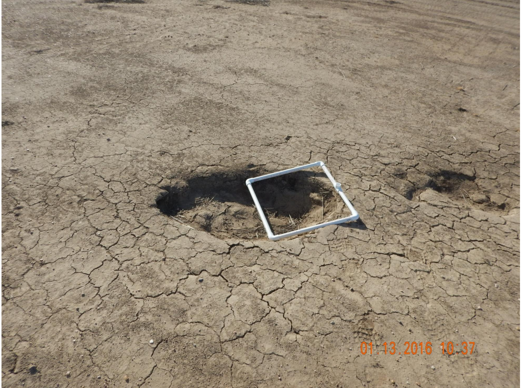
Figure 8: Photo shows sinkhole(s) forming along pipeline in location. \frac{1}{2} square meter quadrat for reference.