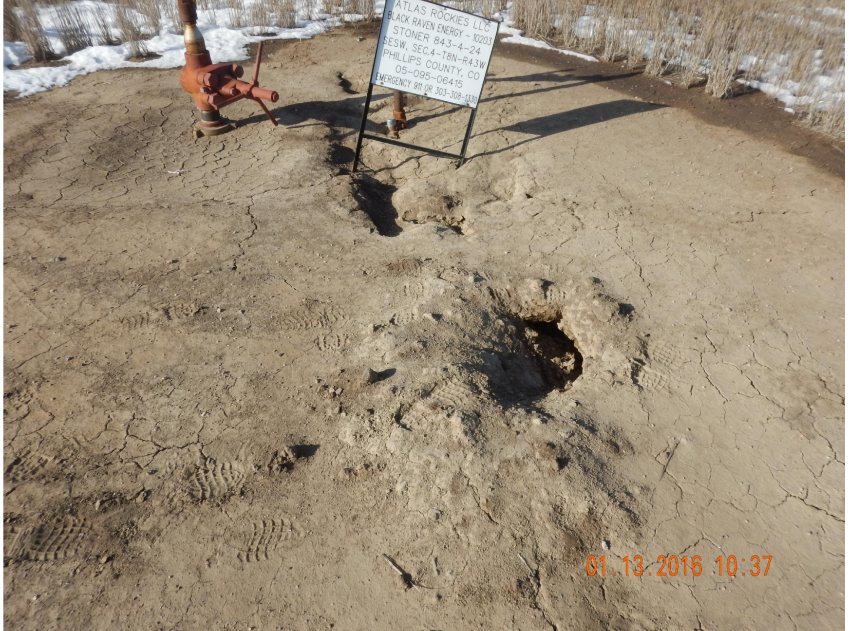
Figure 9: Photo shows sinkhole(s) forming along pipeline in location. \frac{1}{2} square meter quadrat for reference.