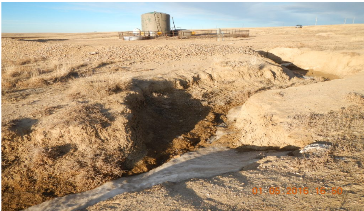
Photo 10: Facing north toward the location. Erosion gully is evident at the southwest side of the location.