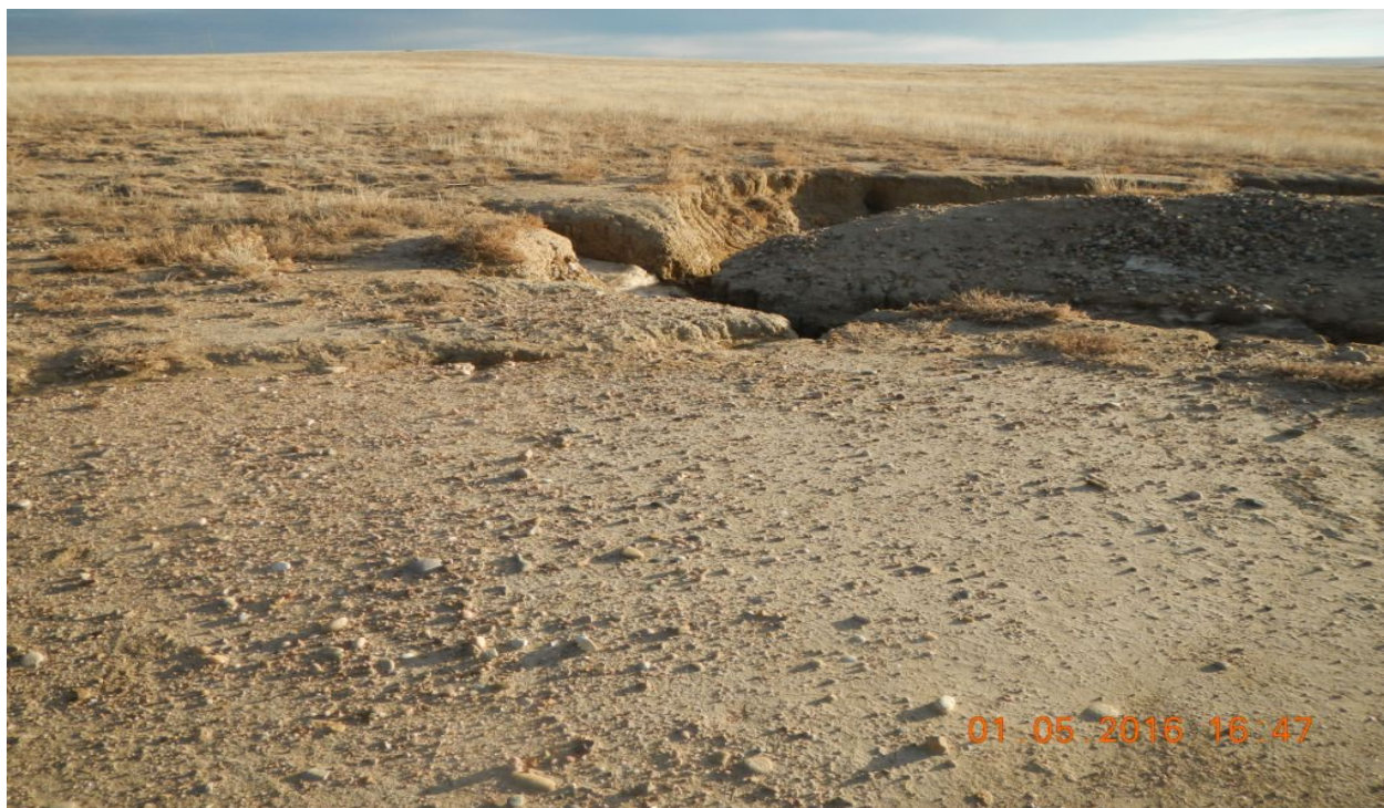
Photo 7: Facing towards the south side of the location where erosion gully has formed.