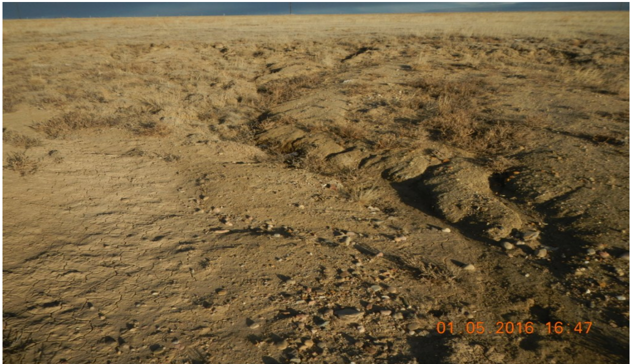
Photo 5: Facing east at the east side of the location. Evidence of erosion occurring onto the location.