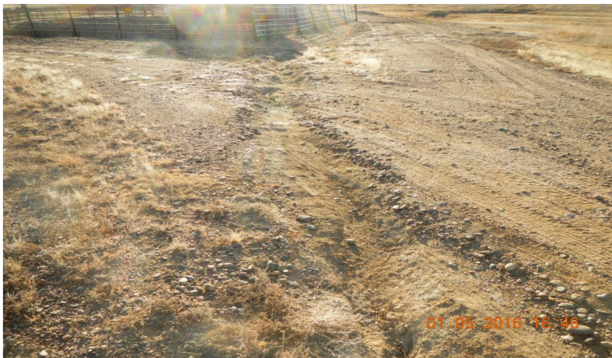
photo 3: Erosion channel cutting across the access road at the location.