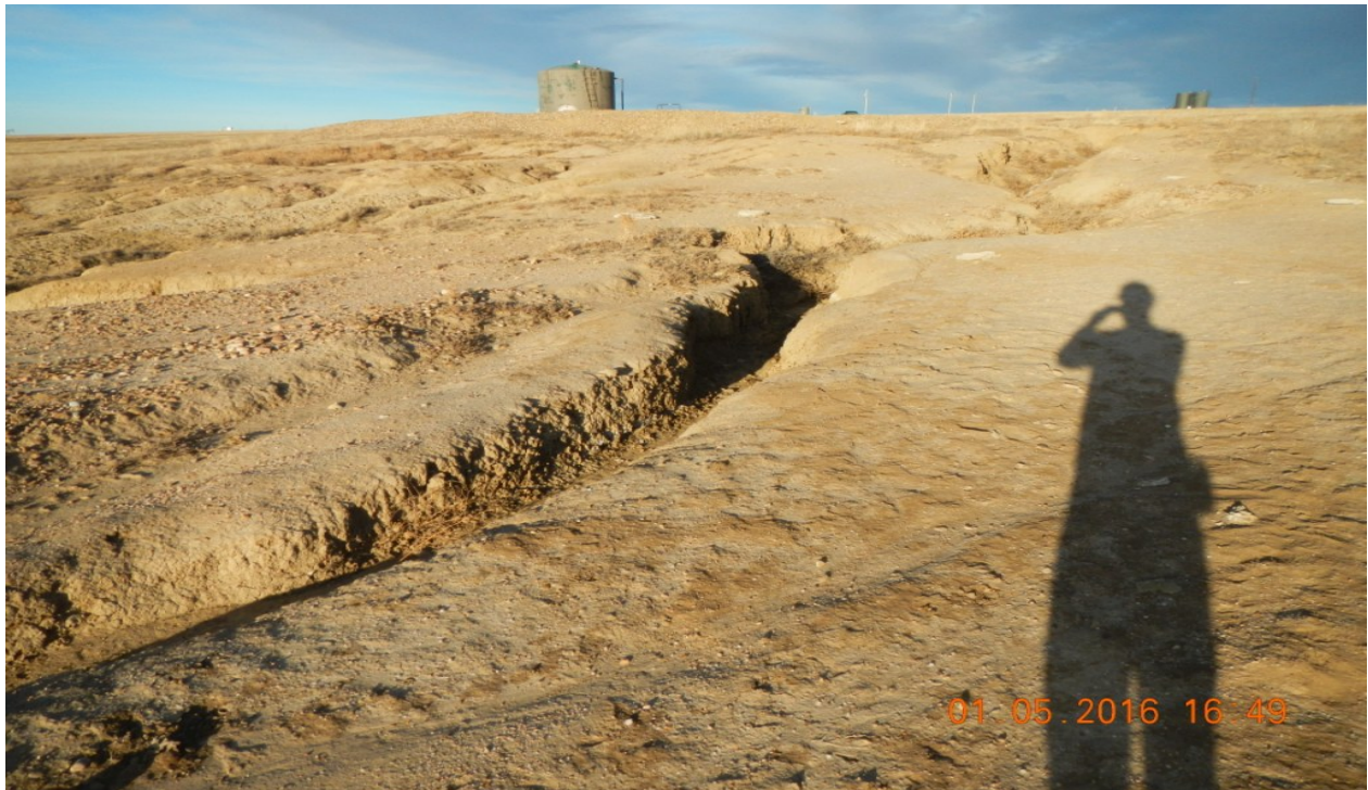
Photo 9: Facing north towards the location where erosion disturbances are evident.