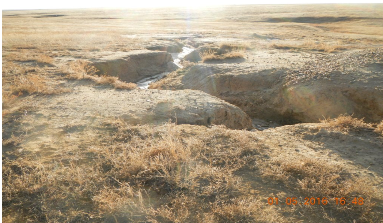
Photo 8: An erosion gully has formed off the southwest side of the location.