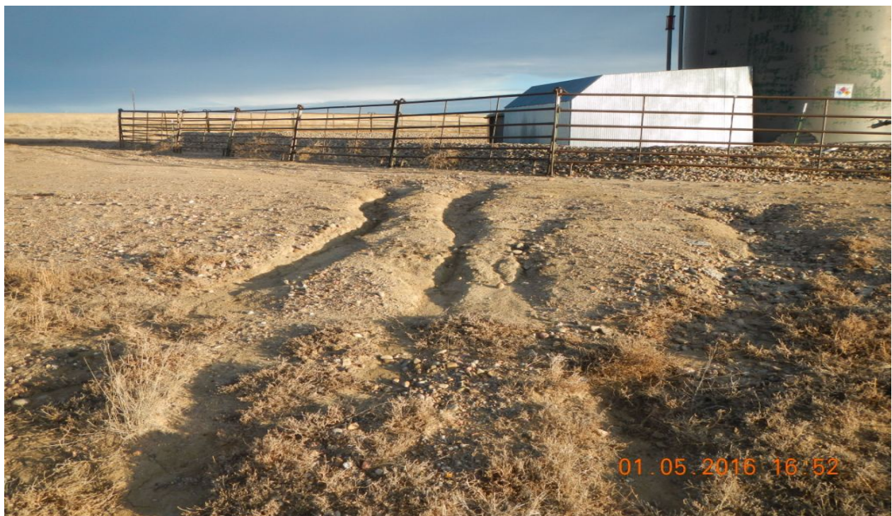
Photo 12: Erosion channels off the northwest side of the location.