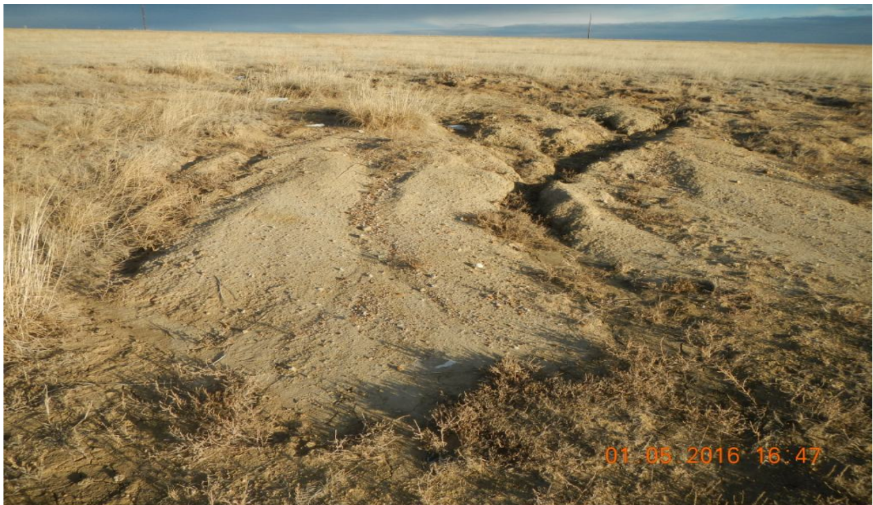
Photo 6: Facing east at the east side of the location. Evidence of erosion occurring onto the location.