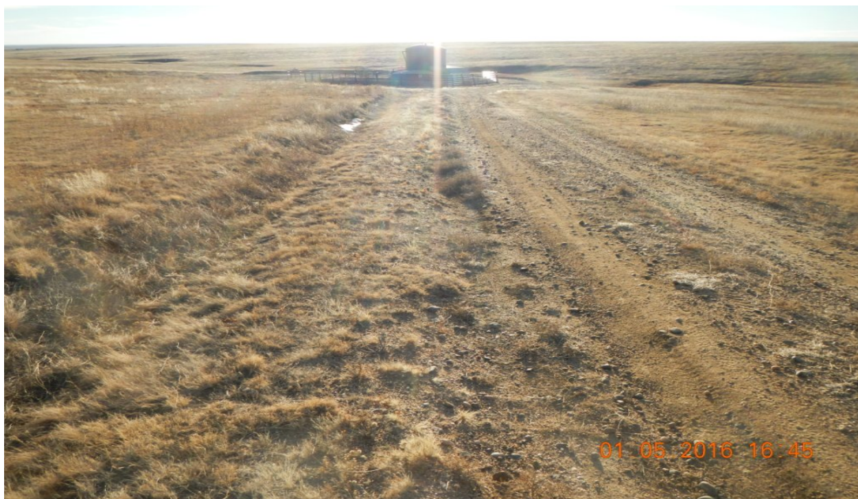
photo 1: Facing southwest towards the location along the access road.