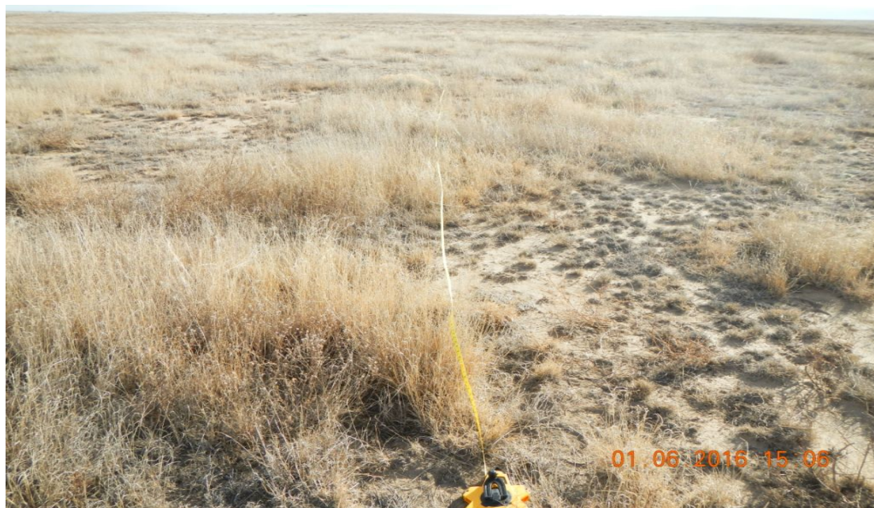
photo 10: End of the vegetation transect facing south at the reference area.