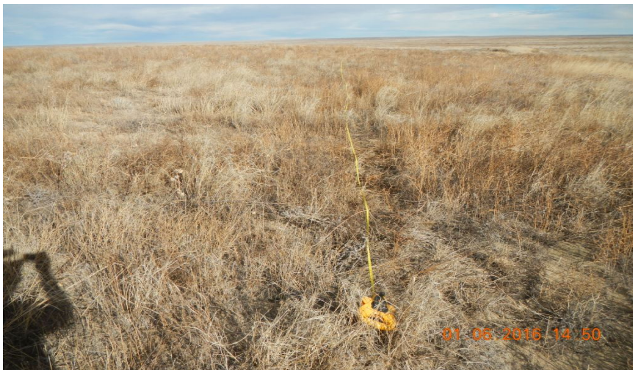
photo 5: End of the vegetation transect facing east at the location.