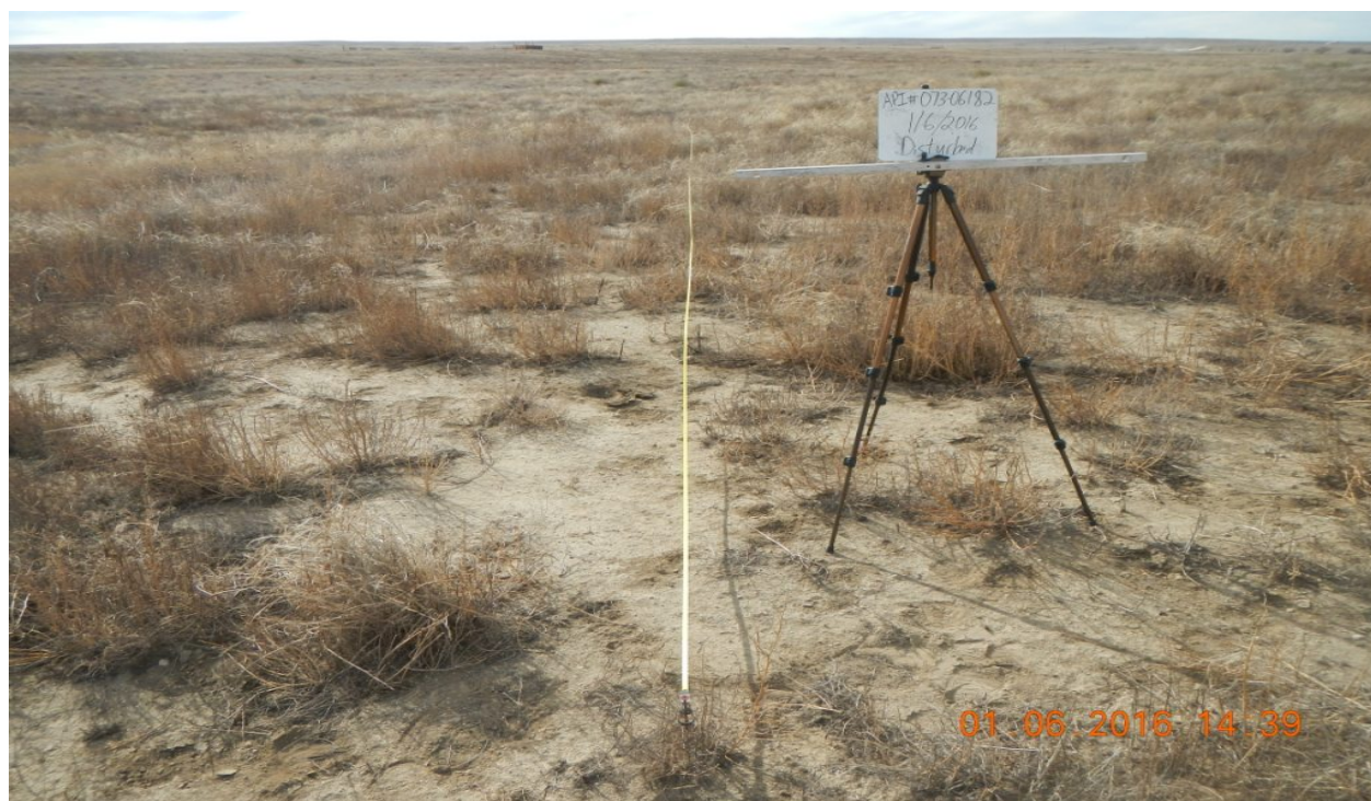
photo 1: Beginning of the vegetation transect facing west at the location.