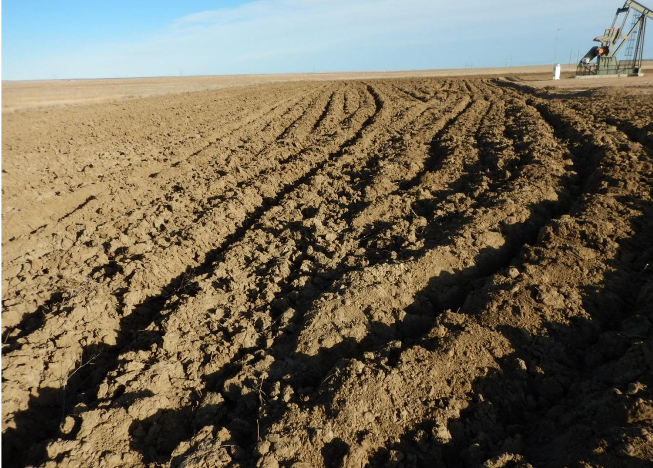
Photo 6. Photo taken from northern location, facing East. Recent interim reclamation work has been completed. Reclaimed area lacks stabilization post seeding. Surface roughening is a temporary BMP and should be used in conjunction with other BMPs.