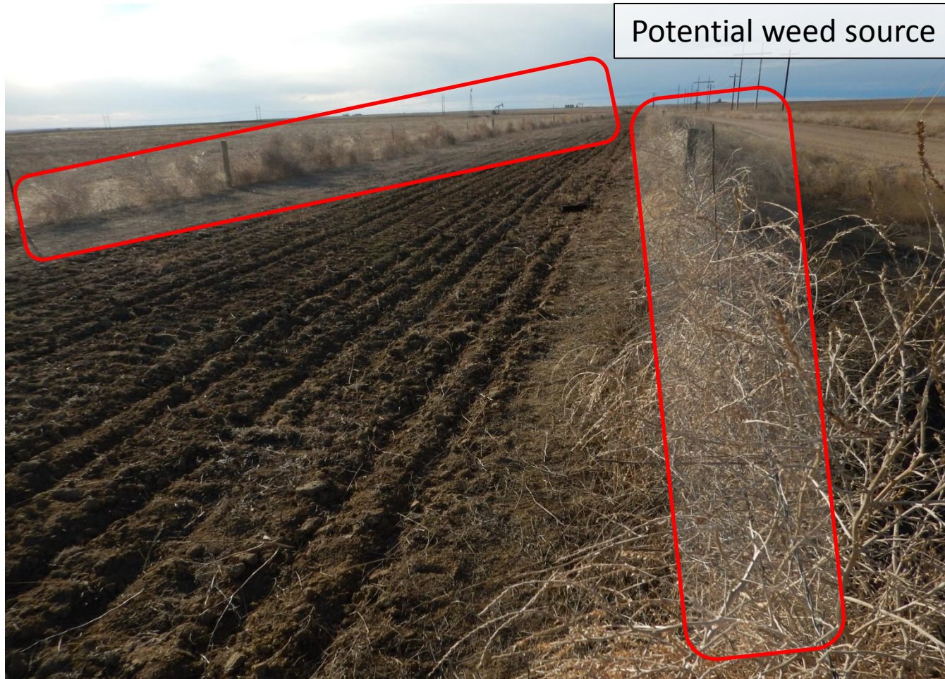
Photo 9. Photo taken from eastern pipeline ROW, facing West. Recent interim reclamation work has been completed. Tumbleweeds caught inside the fence could be a potential weed source affecting perennial vegetative growth. Pipeline ROW lacks stabilization post seeding. Surface roughening is a temporary BMP and should be used in conjunction with other BMPs.