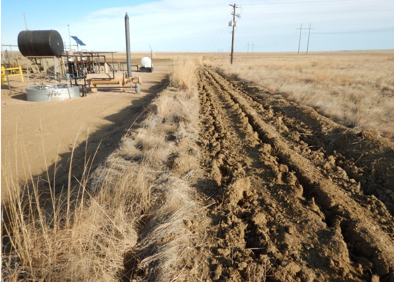
Photo 2. Photo taken from southern location, facing East. Recent interim reclamation work has been completed. Reclaimed area lacks stabilization post seeding. Surface roughening is a temporary BMP and should be used in conjunction with other BMPs.