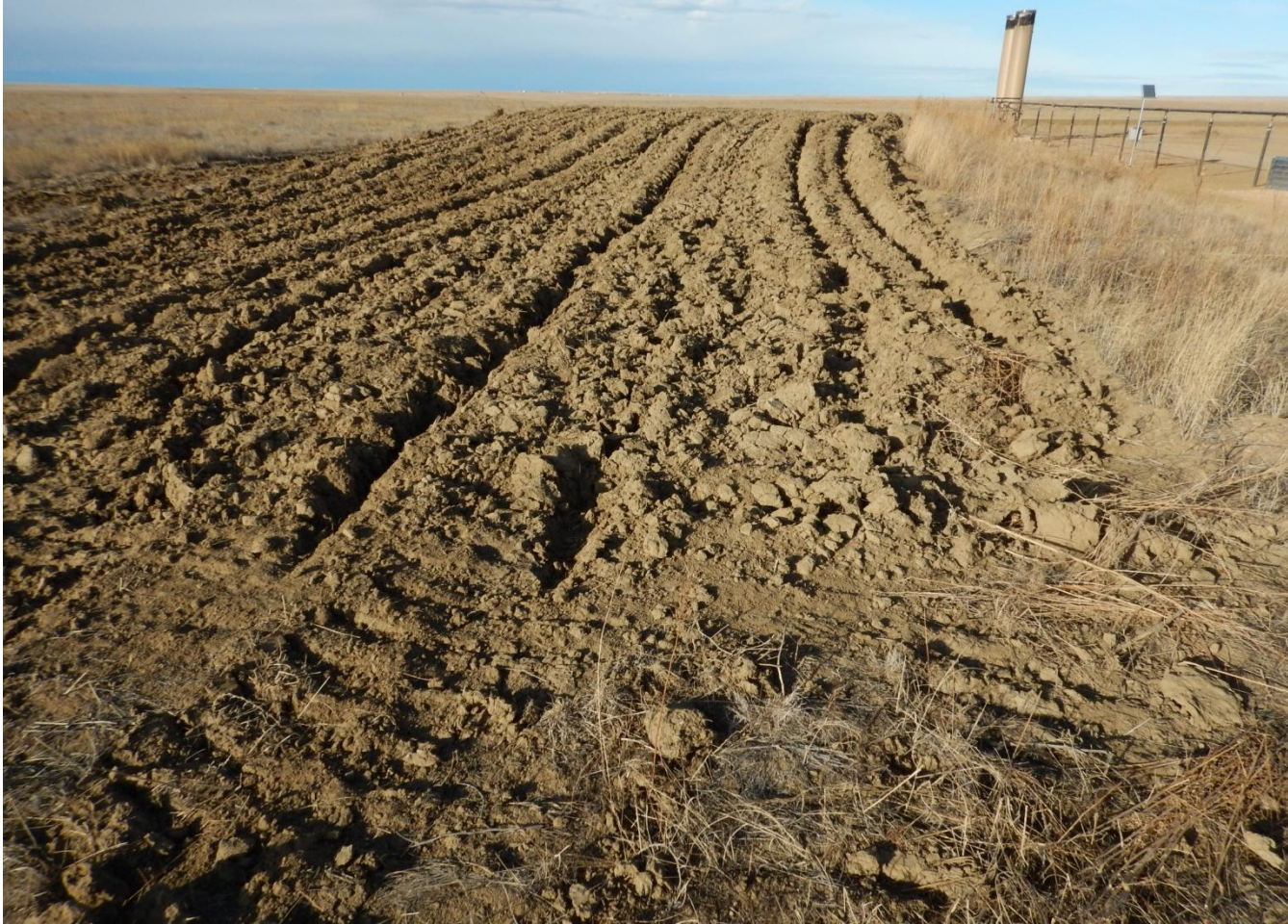
Photo 4. Photo taken from southern location, facing North towards topsoil stockpile. Recent interim reclamation work has been completed. Reclaimed area lacks stabilization post seeding. Surface roughening is a temporary BMP and should be used in conjunction with other BMPs.