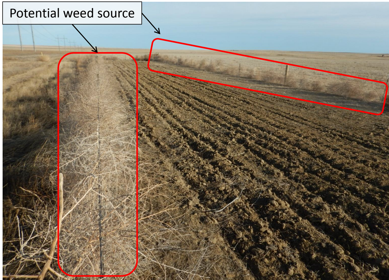
Photo 8. Photo taken from eastern pipeline ROW, facing East. Recent interim reclamation work has been completed. Tumbleweeds caught inside the fence could be a potential weed source affecting perennial vegetative growth. Pipeline ROW lacks stabilization post seeding. Surface roughening is a temporary BMP and should be used in conjunction with other BMPs.