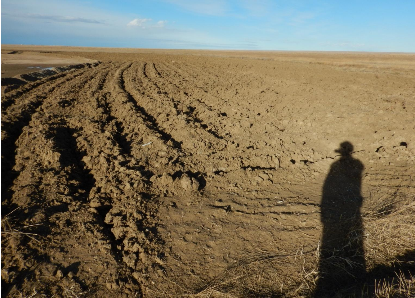
Photo 7. Photo taken from southeast location, facing North. Recent interim reclamation work has been completed. Reclaimed area lacks stabilization post seeding. Surface roughening is a temporary BMP and should be used in conjunction with other BMPs.