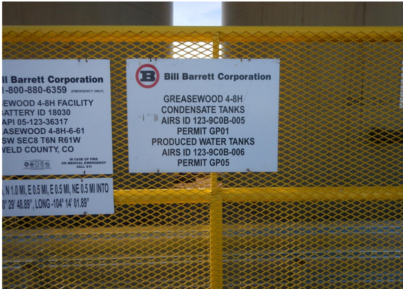
Photo 1. Photo taken of well sign for the location of interest- Greasewood 4-8H.