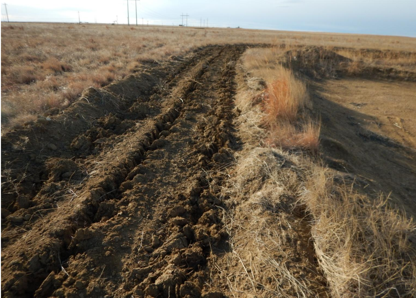
Photo 3. Photo taken from southern location, facing West. Recent interim reclamation work has been completed. Reclaimed area lacks stabilization post seeding. Surface roughening is a temporary BMP and should be used in conjunction with other BMPs.