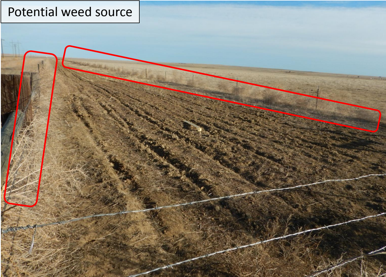
Photo 10. Photo taken from western pipeline ROW, facing East. Recent interim reclamation work has been completed. Tumbleweeds caught inside the fence could be a potential weed source affecting perennial vegetative growth. Pipeline ROW lacks stabilization post seeding. Surface roughening is a temporary BMP and should be used in conjunction with other BMPs.