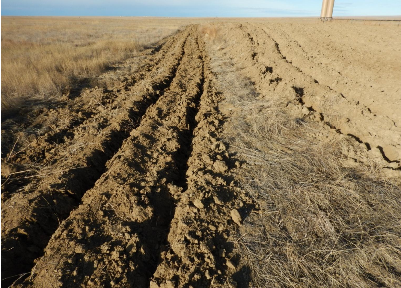
Photo 5. Photo taken from southwest location, facing North towards topsoil stockpile. Recent interim reclamation work has been completed. Reclaimed area lacks stabilization post seeding. Surface roughening is a temporary BMP and should be used in conjunction with other BMPs.